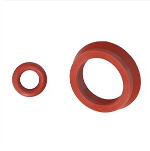
Image: A close-up view of the lip seal and O-ring included in the Set -37.