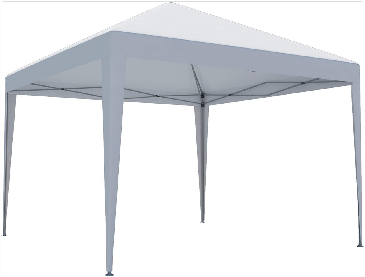
Figure 1.1: Fully assembled Material EORI Garden Gazebo in light grey.