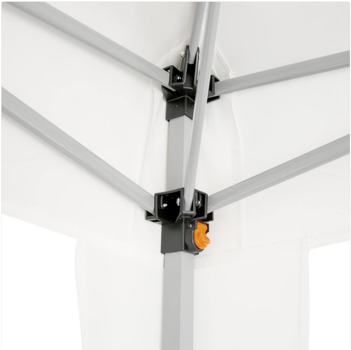
Figure 4.2: Detail of the frame joint mechanism, showing the locking button for secure assembly.