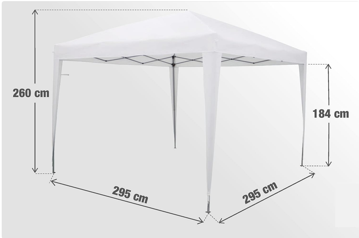
Figure 8.1: Dimensional diagram of the Material EORI Garden Gazebo.