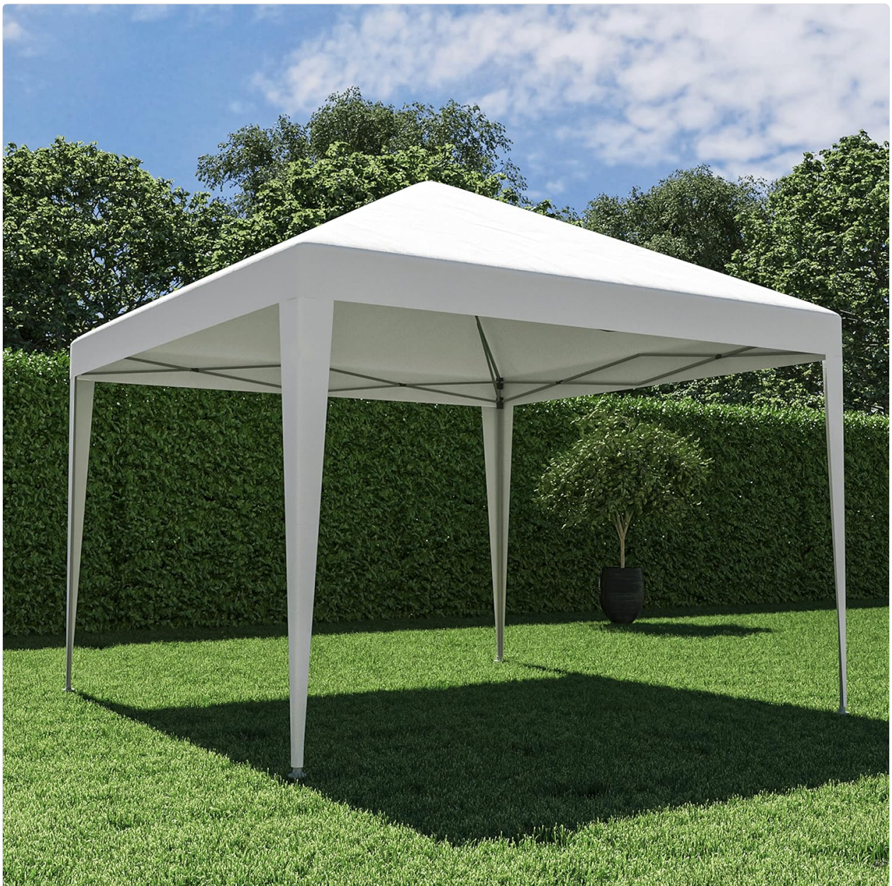
Figure 5.1: The gazebo provides a comfortable shaded area in a garden setting.