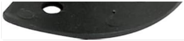
Figure 4.4: The leg base plate includes holes for securing the gazebo with ground stakes.