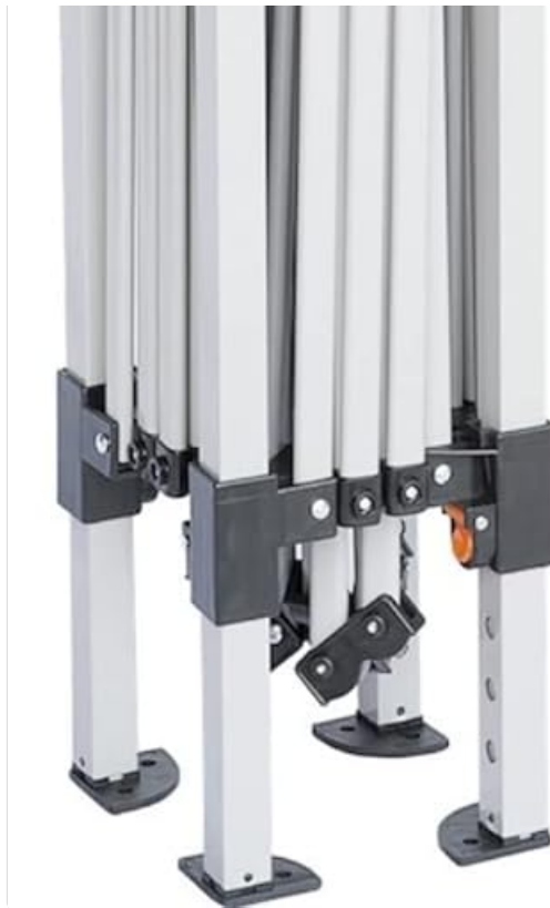
Figure 6.1: The gazebo frame folds compactly for convenient storage and transport.