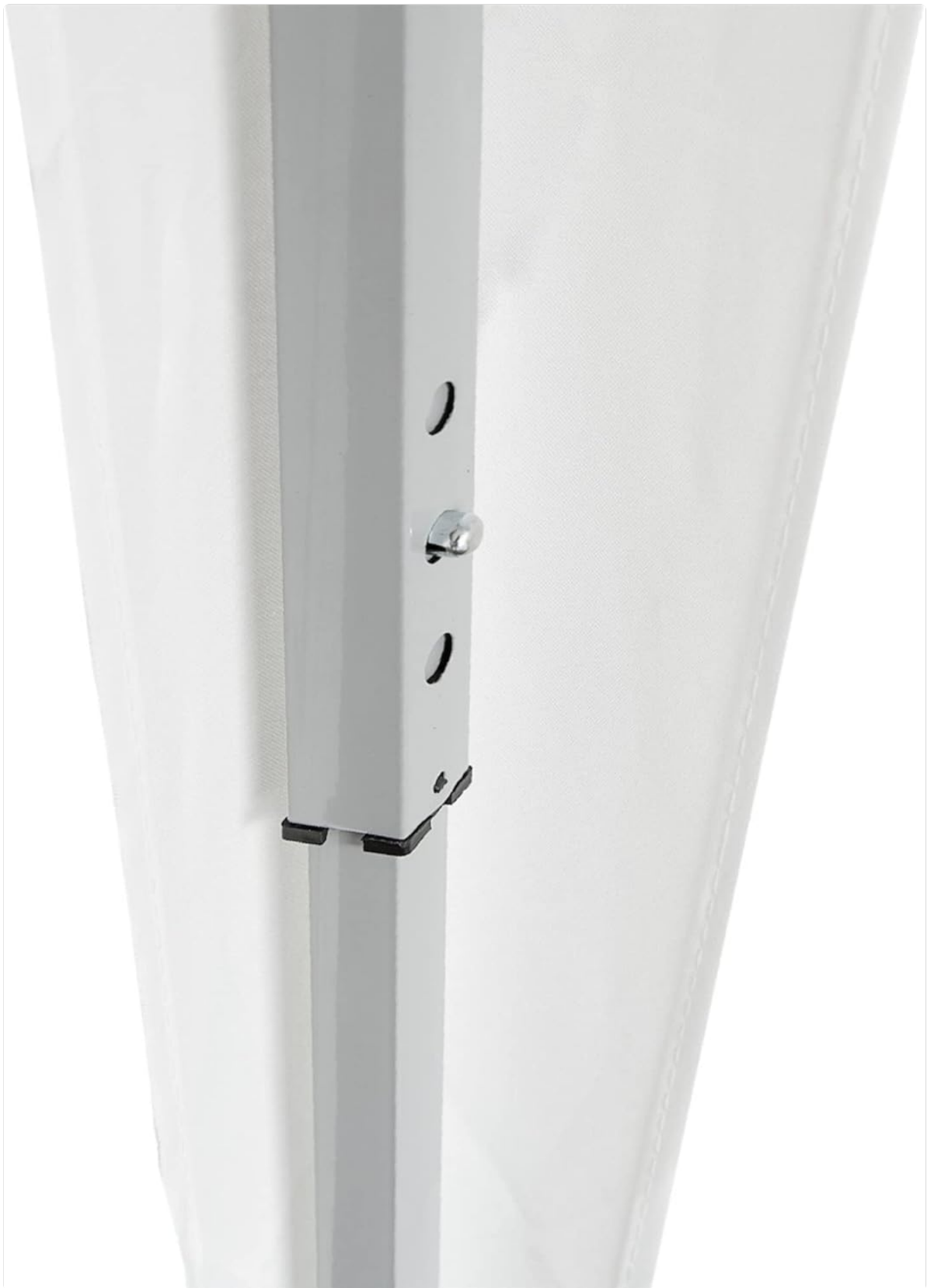
Figure 4.3: The leg adjustment pin allows for easy height modification and secure locking.