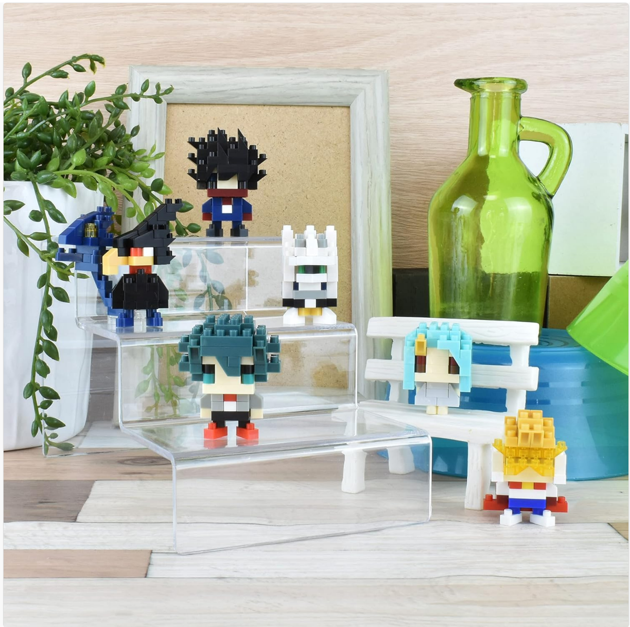
Image: The complete set of six assembled nanoblock My Hero Academia characters, displayed together.