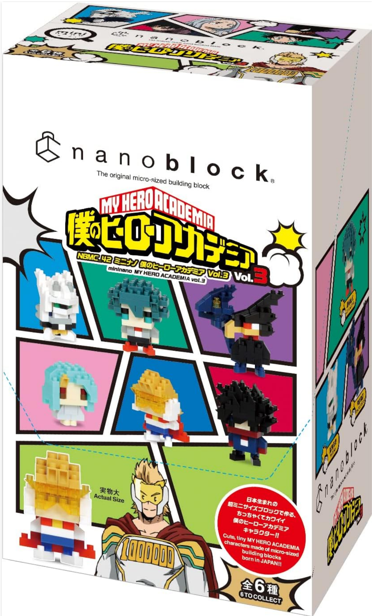
Image: The back of the product box, illustrating the six characters included in the set.