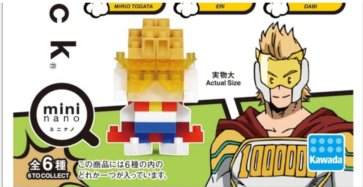
Image: An example of a detailed instruction sheet for assembling a nanoblock character, Mirio Togata.