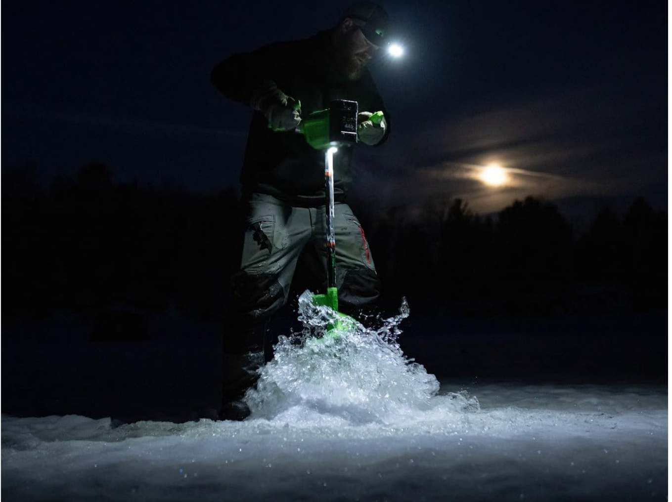
Image: Headlamp being used in a wet environment, demonstrating its water-resistant capability.