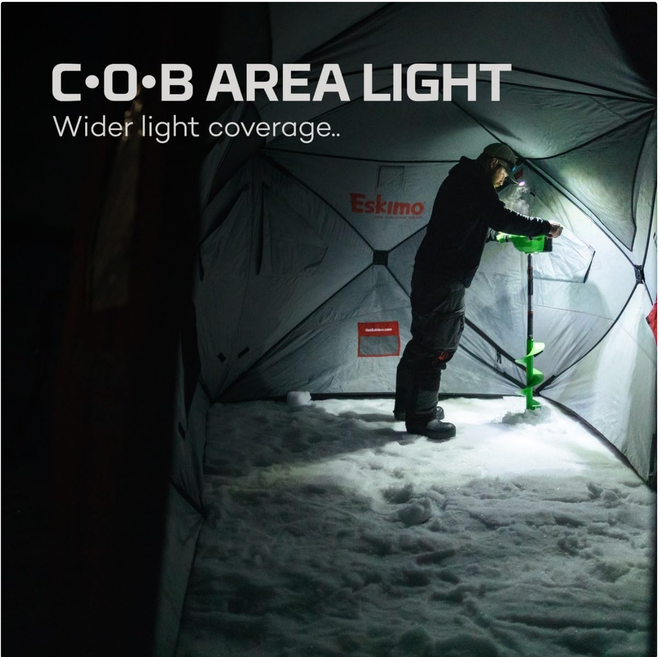
Image: Headlamp in COB area light mode, providing wider light coverage for close-up tasks.