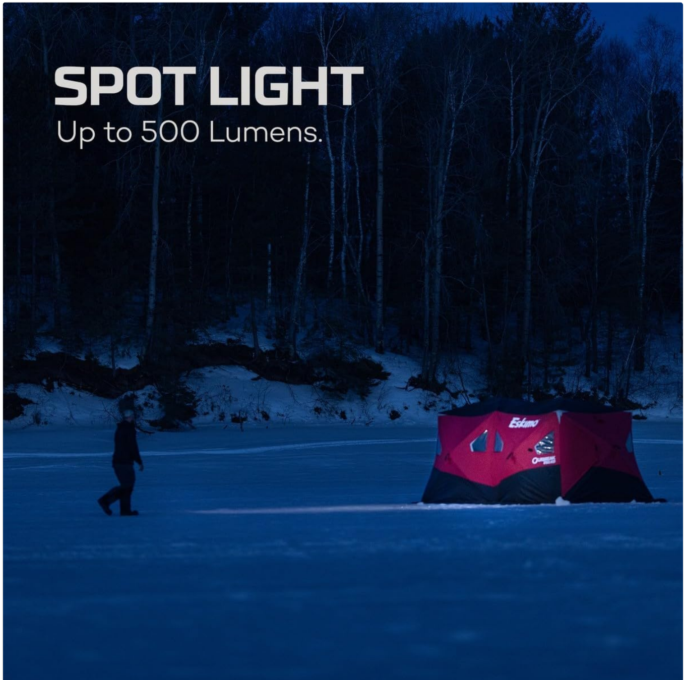
Image: Headlamp in spotlight mode, illuminating a distant object with up to 500 lumens.