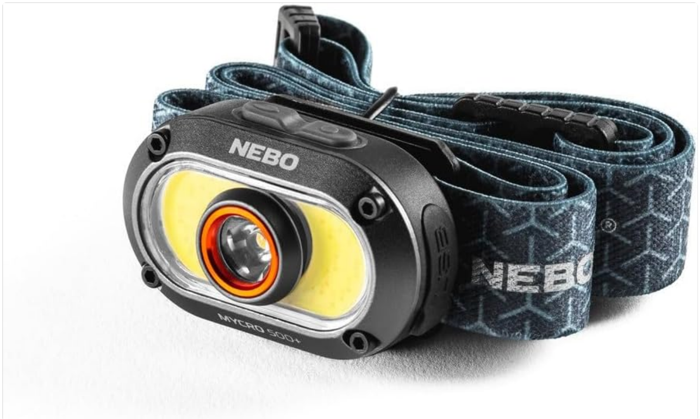
Image: The NEBO MYCRO 500+ headlamp, showing its compact design and adjustable head strap.

The NEBO MYCRO 500+ is a lightweight and versatile rechargeable LED headlamp designed for various applications, including outdoor activities, mechanical work, and general illumination. It delivers an impressive 500 lumens and features multiple light modes, water resistance, and a convenient detachable cap clip.