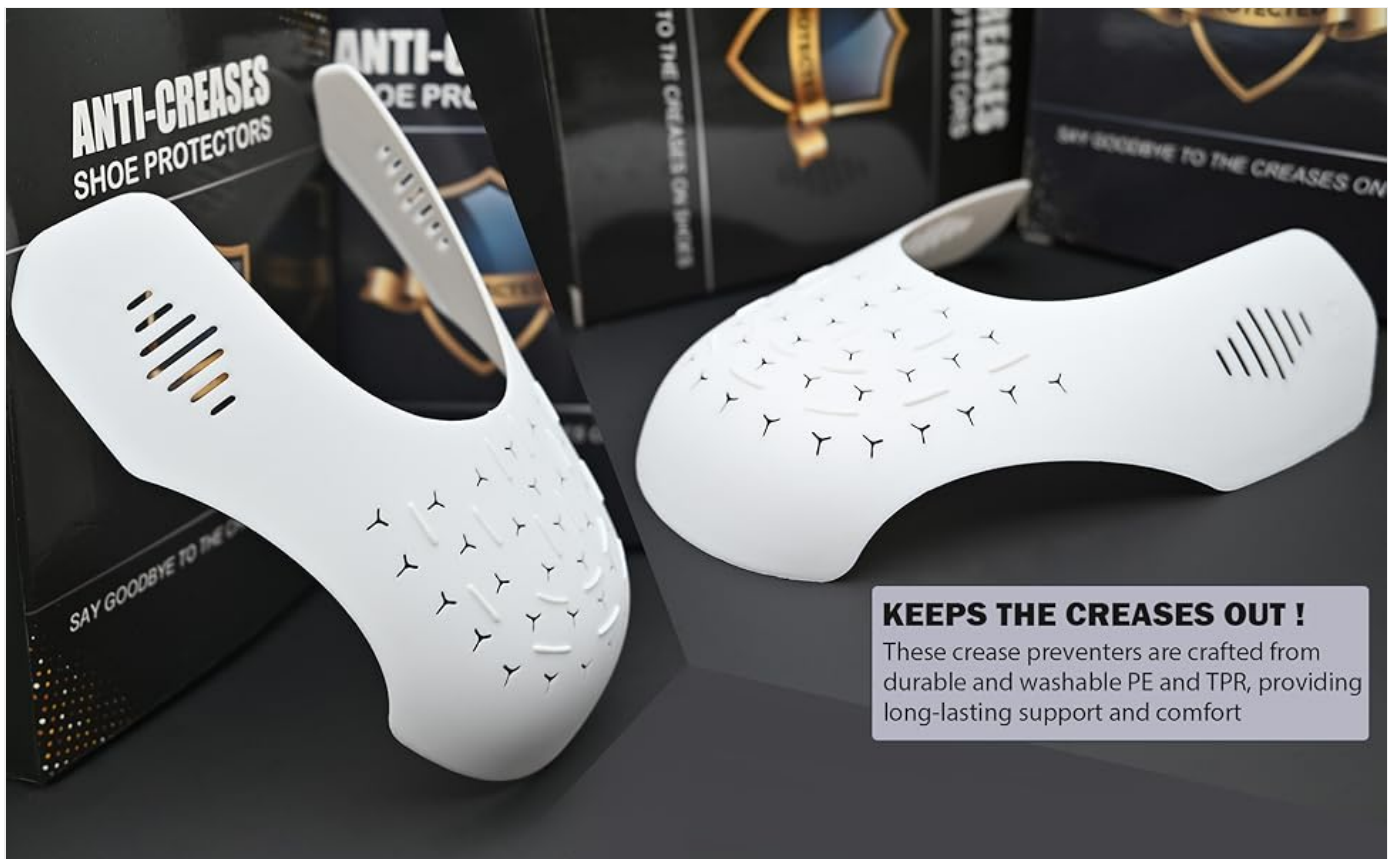
Image: TUPEED Shoe Crease Preventers in black and white, displayed with their product packaging.