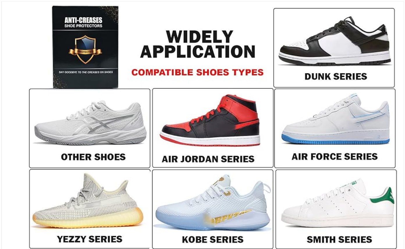
Image: A collage showcasing the wide application of the shoe crease preventers across different shoe types, including Dunk, Air Jordan, Air Force, Yeezy, Kobe, and Smith series.