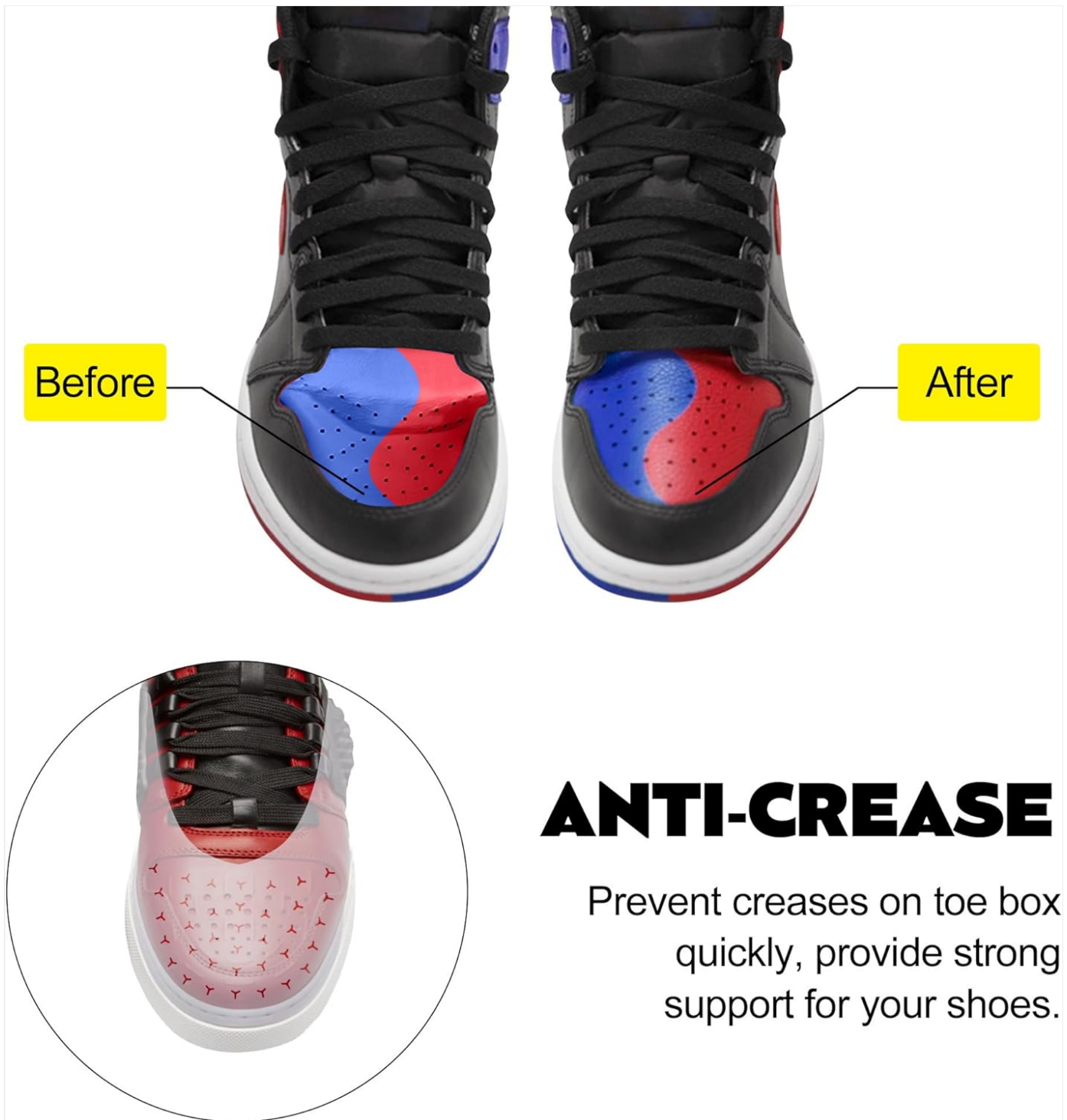
Image: A visual comparison showing a shoe's toe box "Before" (with creases) and "After" (smooth, with a crease protector inserted).