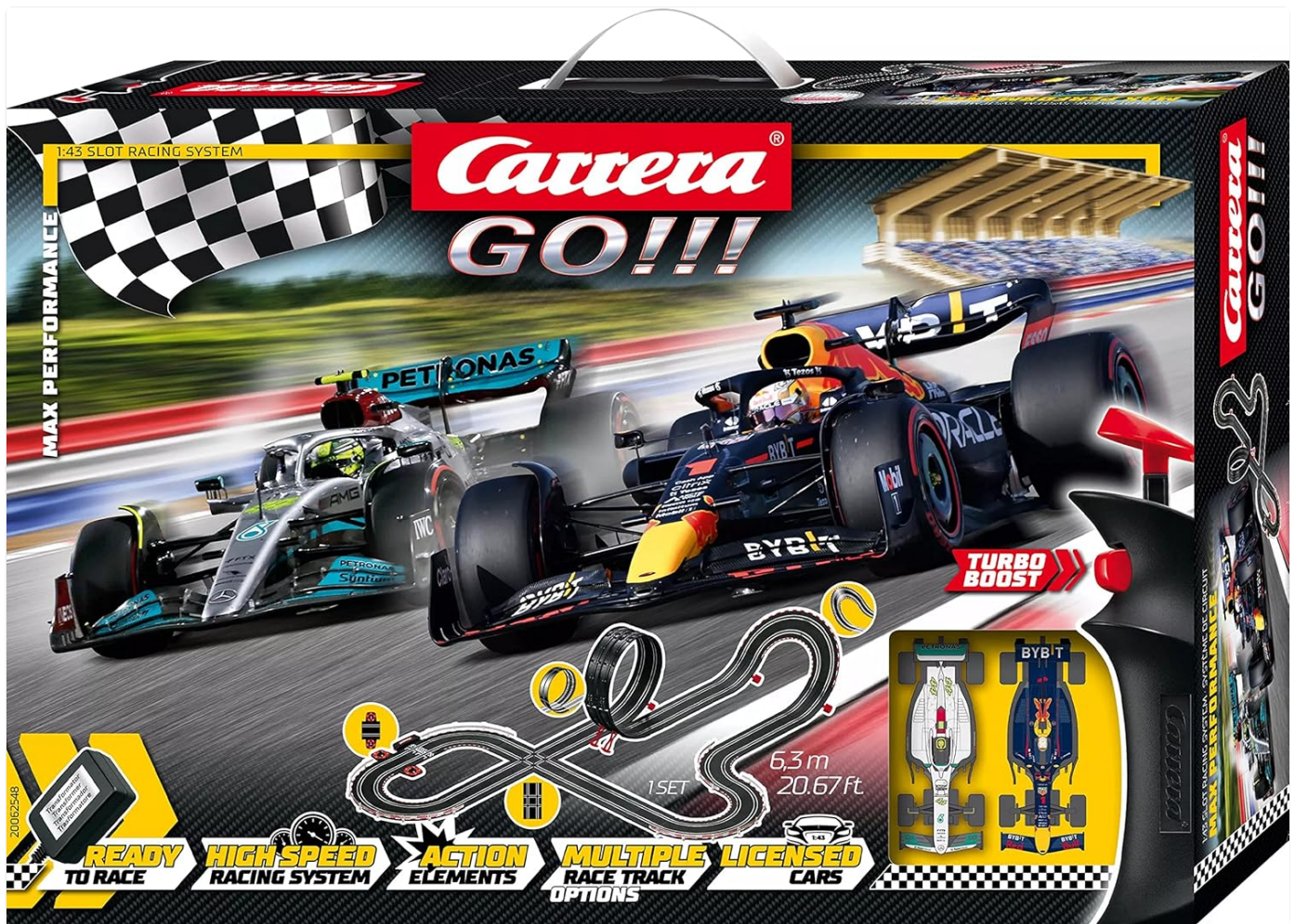
Image: The product packaging for the Carrera GO!!! Max Performance set, displaying the track layout and the two included F1 race cars.