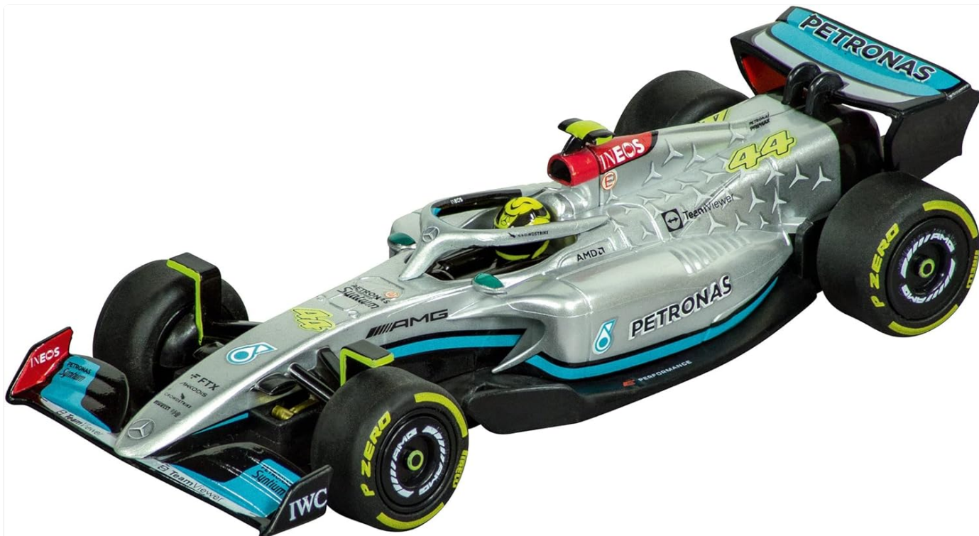
Image: A detailed view of the F1 Mercedes 2022 "Hamilton, No.44" 1:43 scale slot car, one of the vehicles included in the set.