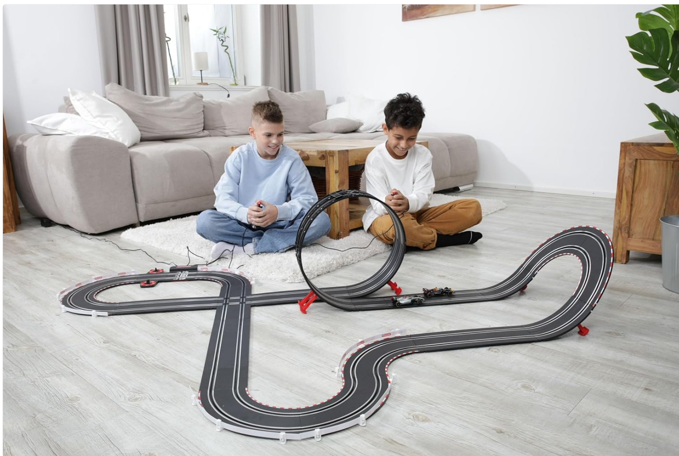
Image: Two children seated on the floor, actively engaged in racing their slot cars on the assembled Carrera GO!!! track.