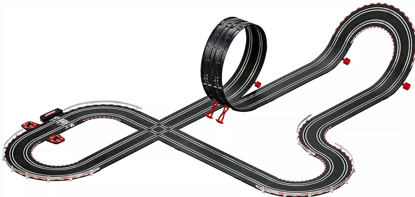
Image: A fully assembled Carrera GO!!! Max Performance track, showcasing its various elements including the loop, intersection, and banked curve.