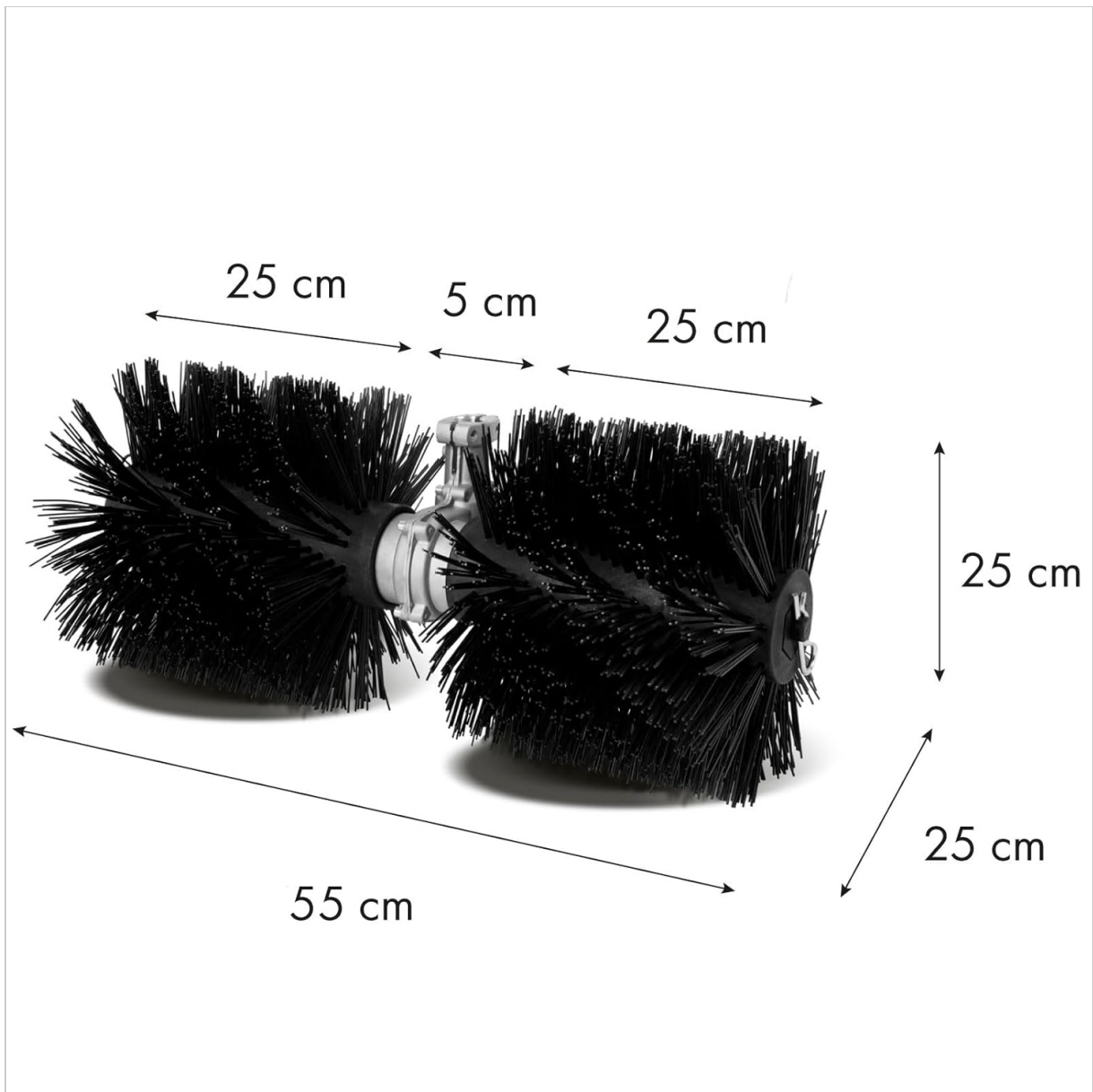
Image: Dimensional overview of the sweeping roller brush, indicating a total width of 55 cm and brush diameter of 25 cm.