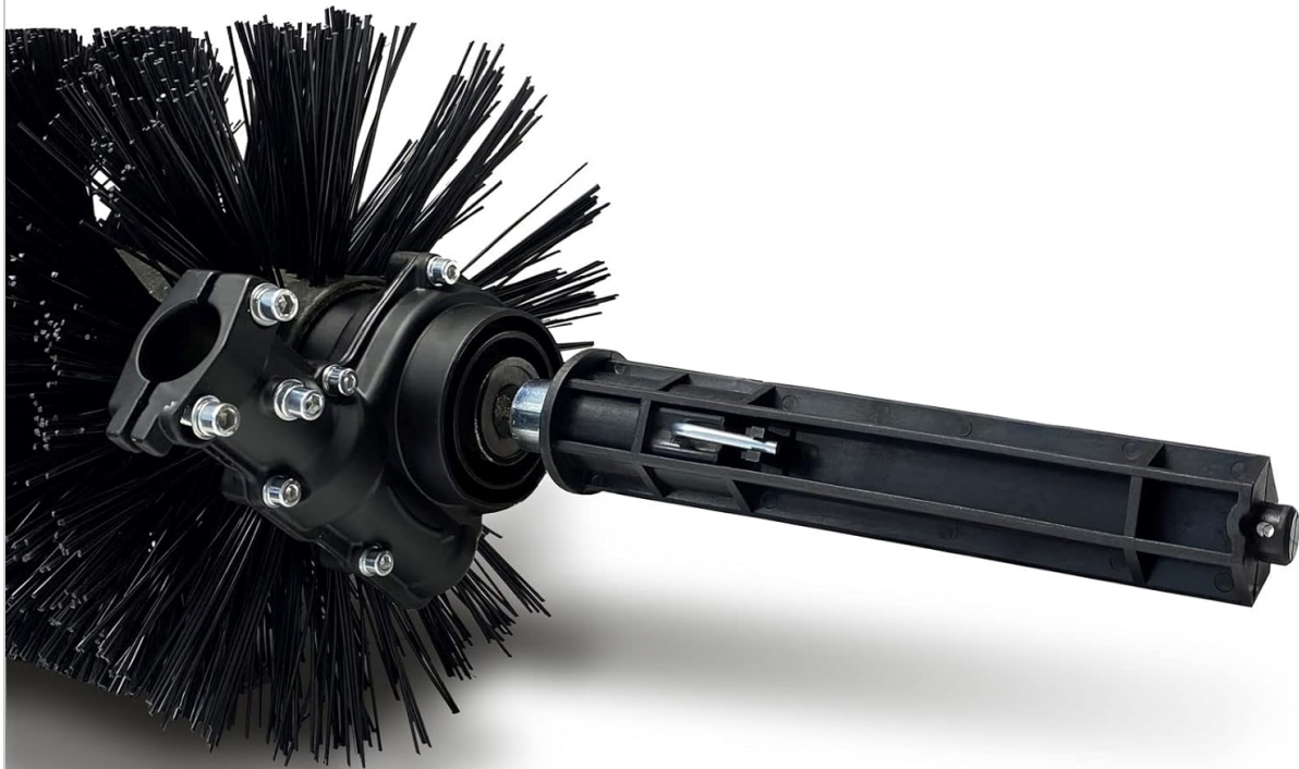
Image: Side profile of the sweeping roller brush, highlighting the integrated drive bar for connection to the sweeper.