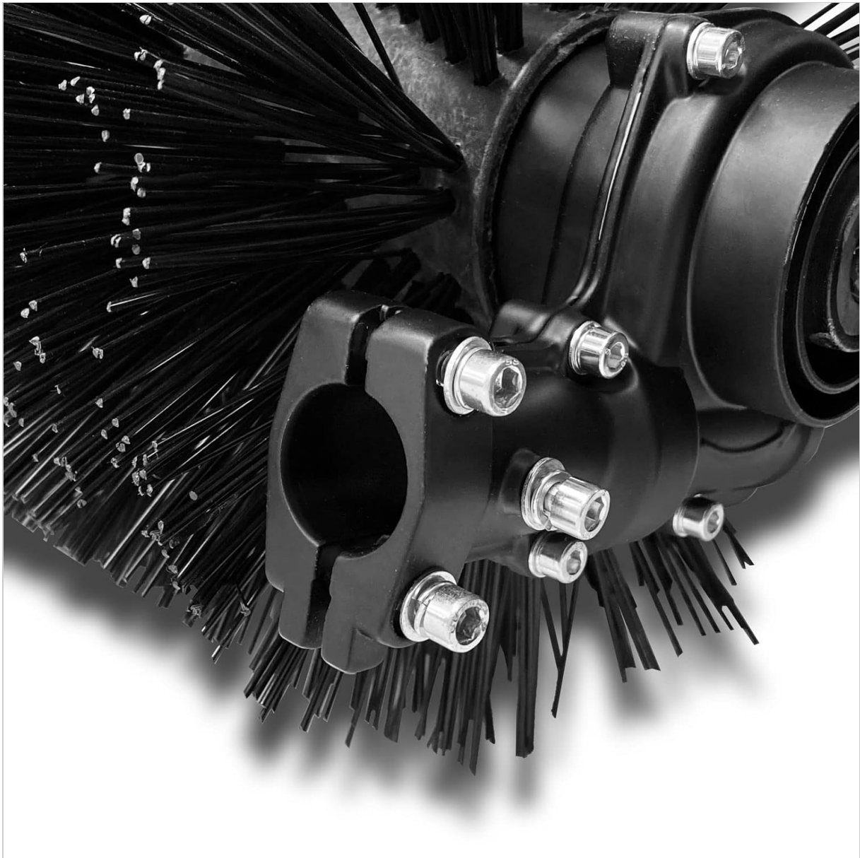
Image: Close-up of the clamping mechanism, showing how the brush is secured to the sweeper's shaft.

The brush is compatible with various brands that utilize a 27 mm connection, as depicted in the product images.