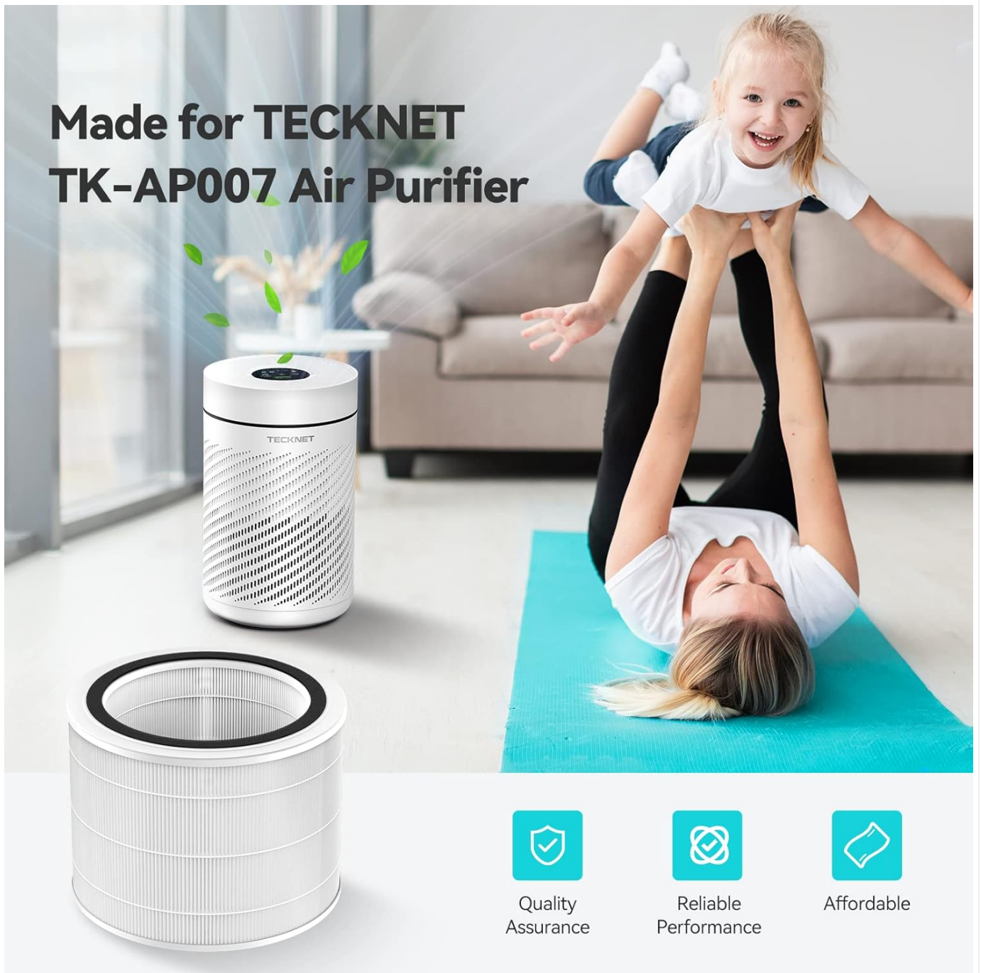
Image 2: The TECKNET H13 HEPA filter shown alongside the TECKNET TK-AP007 air purifier, indicating compatibility.