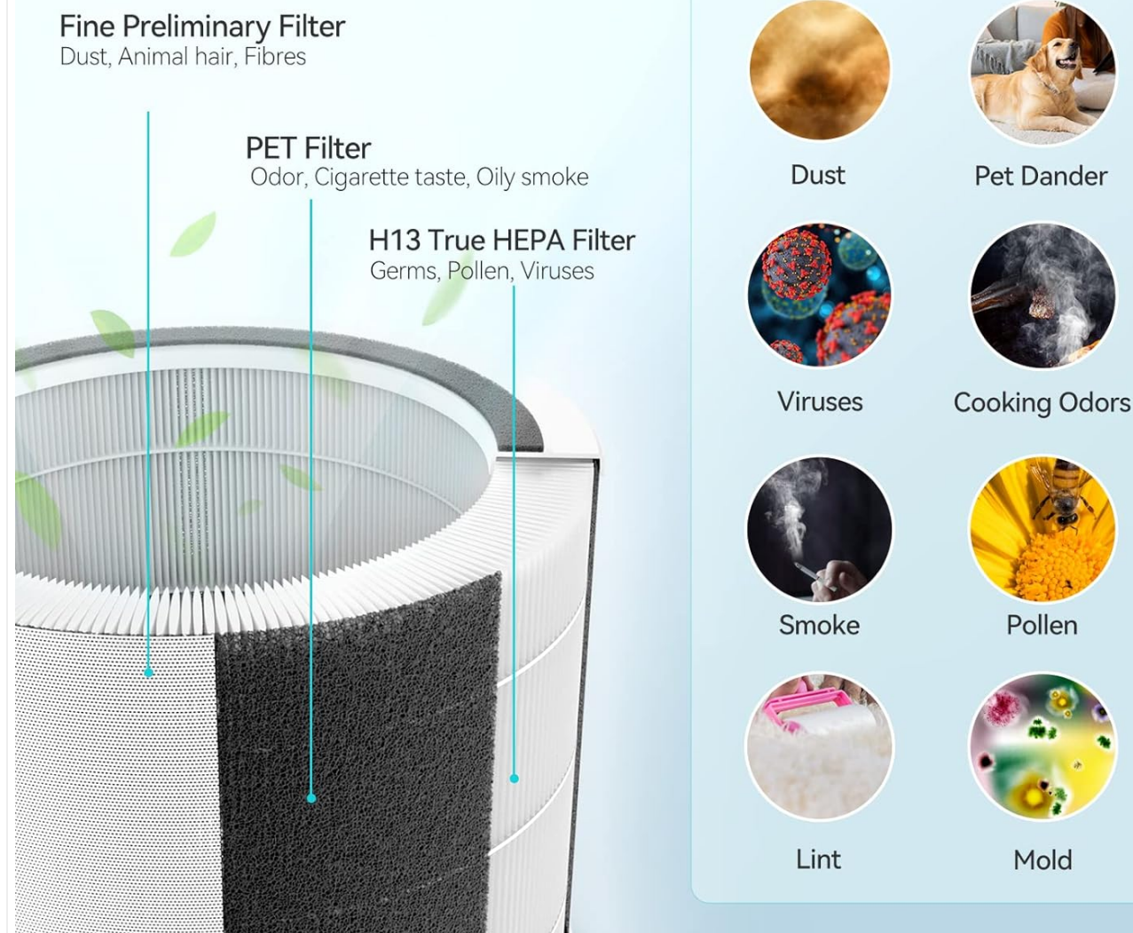
Image 4: A diagram illustrating the triple-layer filtration system (Fine Preliminary Filter, PET Filter, H13 True HEPA Filter) and the types of particles it captures, such as dust, pet dander, viruses, cooking odors, smoke, pollen, lint, and mold.

Triple-layer filter, effectively cleans 99.97% of fine particles, dust, bacteria, allergens, etc.