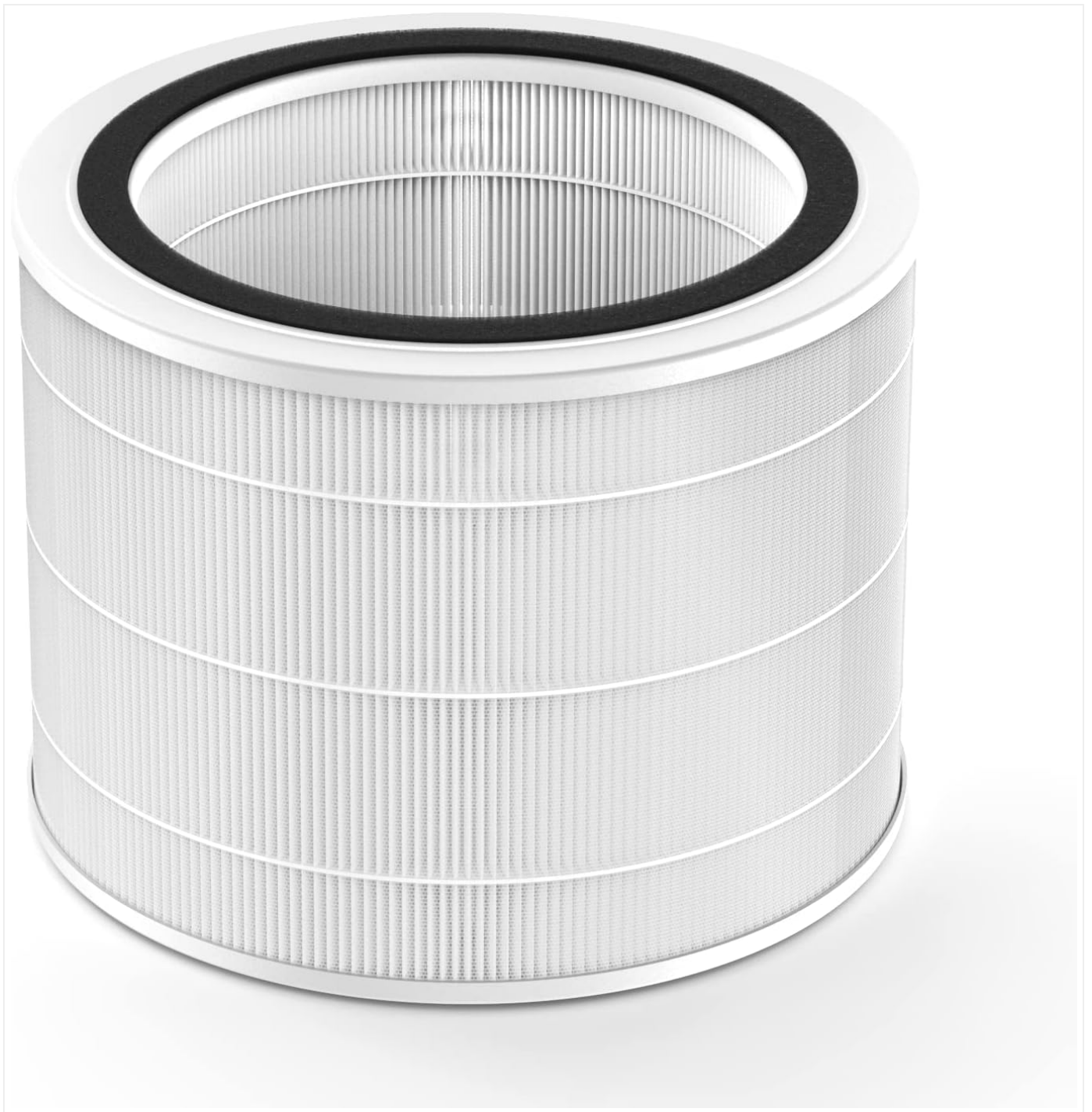
Image 1: The TECKNET H13 HEPA Replacement Filter, a cylindrical filter with a black rubber seal on top.