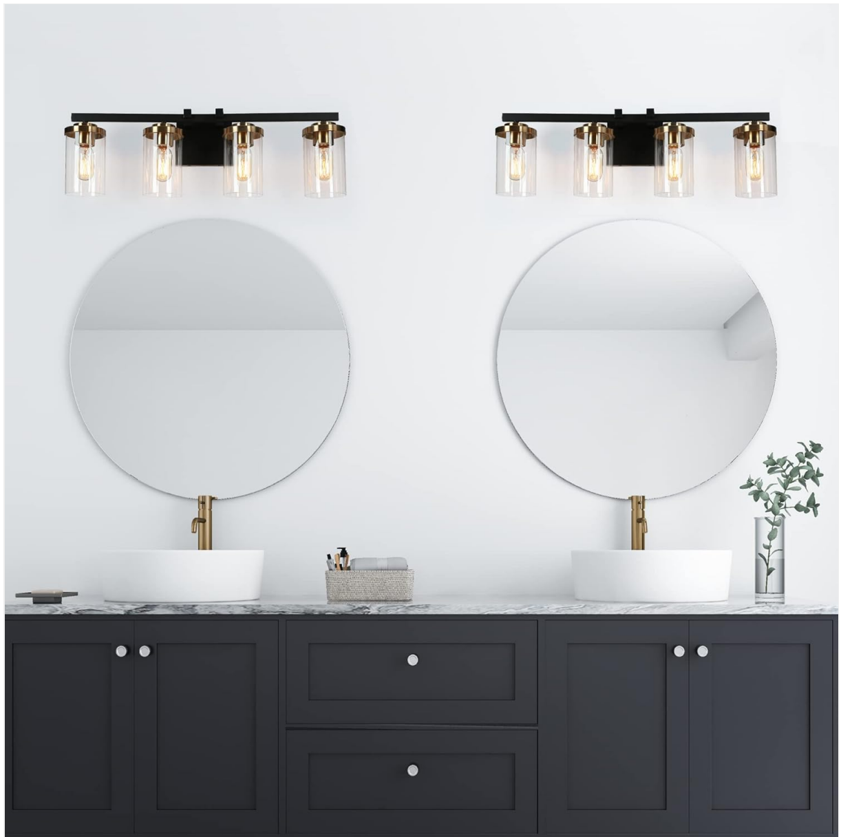
Figure 5: Dual installation of ZEVNI Black Vanity Lights. This image shows two fixtures complementing a double vanity setup with round mirrors.