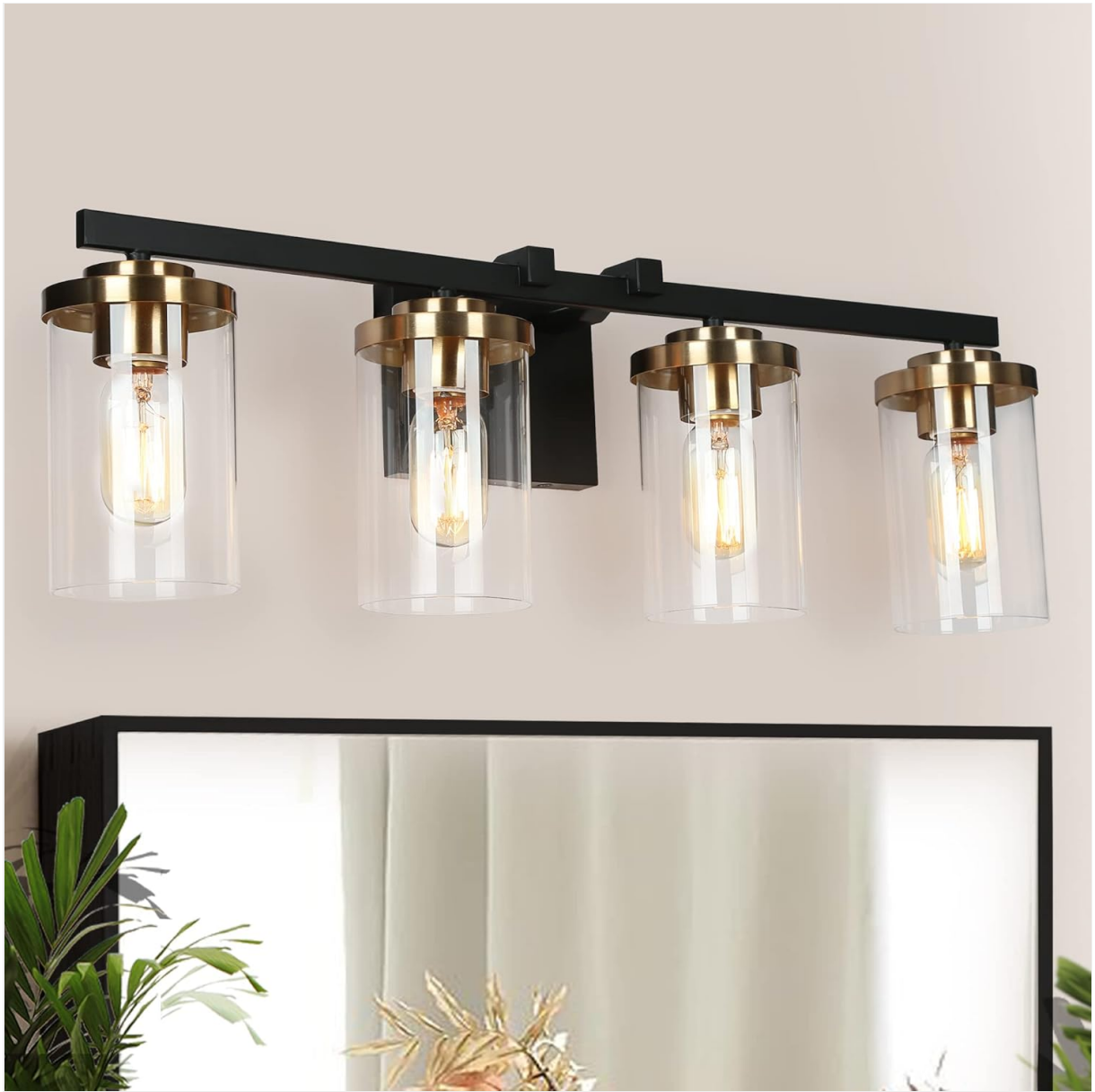
Figure 4: ZEVNI Black Vanity Light in a modern bathroom setting. This image displays the 4-light fixture mounted above a mirror, showcasing its design and illumination.