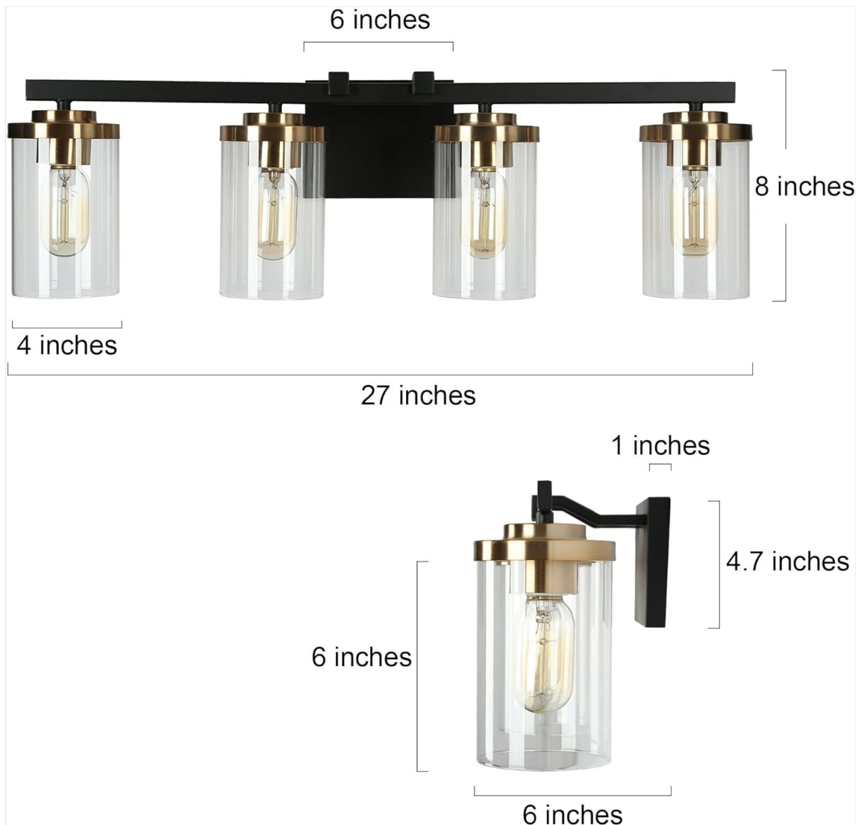
Figure 1: Product Dimensions. This diagram illustrates the overall length (27 inches), width (6 inches), and height (8 inches) of the vanity light, along with individual shade dimensions and canopy measurements.