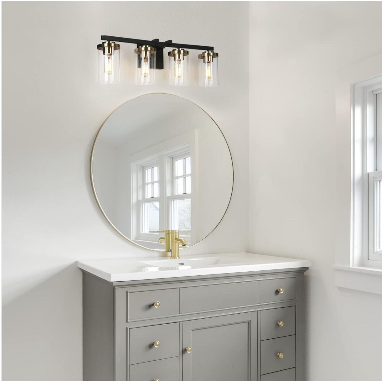
Figure 7: ZEVNI Black Vanity Light with a round mirror. This image demonstrates the fixture's aesthetic appeal when paired with a circular mirror and a grey vanity.