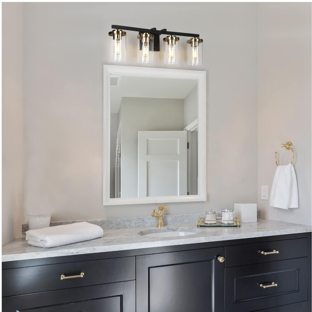
Figure 6: ZEVNI Black Vanity Light above a rectangular mirror. This image provides another perspective of the fixture in a bathroom, highlighting its versatility with different mirror styles.