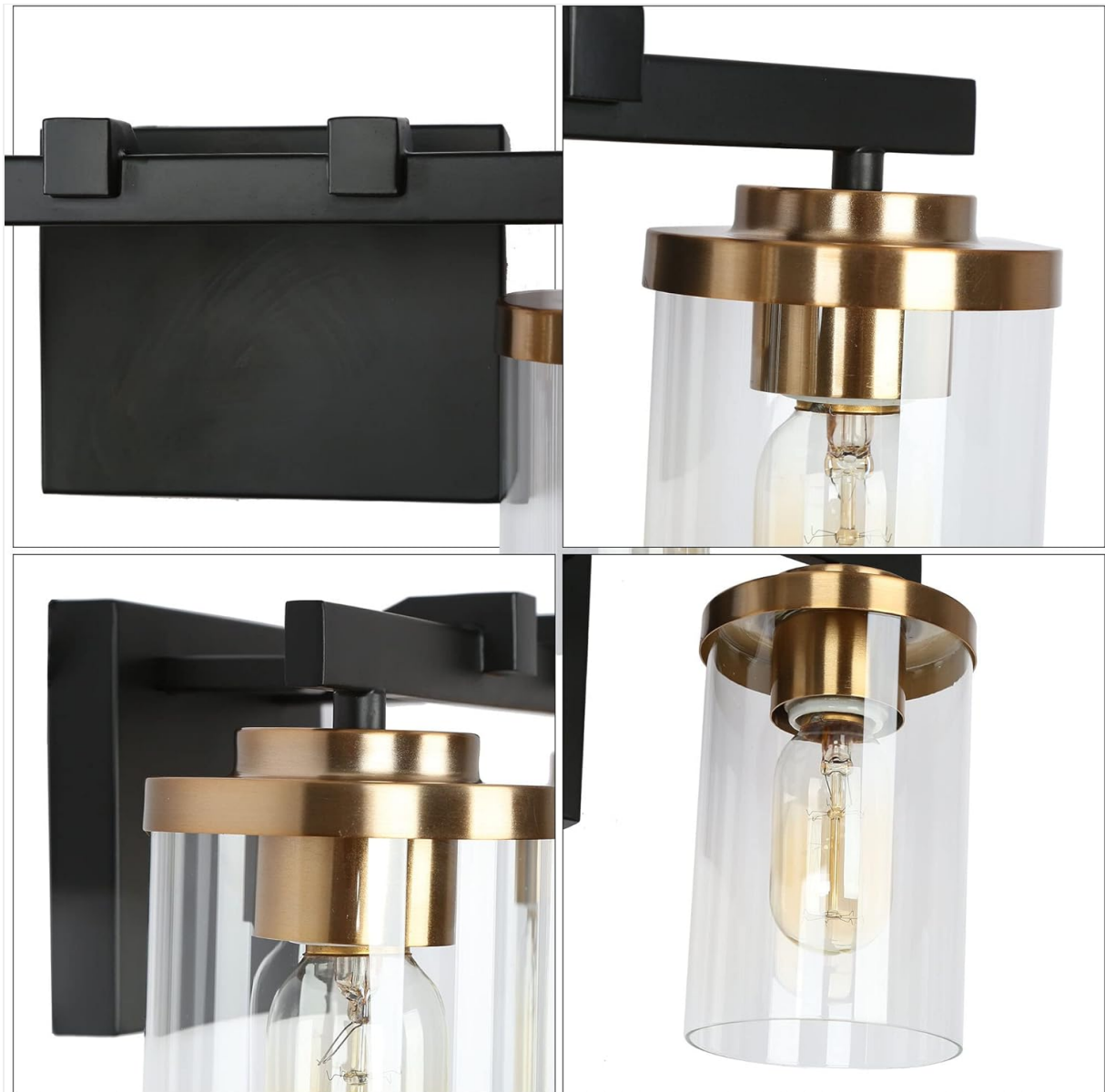
Figure 2: Component Detail. This image shows a detailed view of the fixture's construction, highlighting the black metal backplate, gold accents, and clear glass shade attachment points.