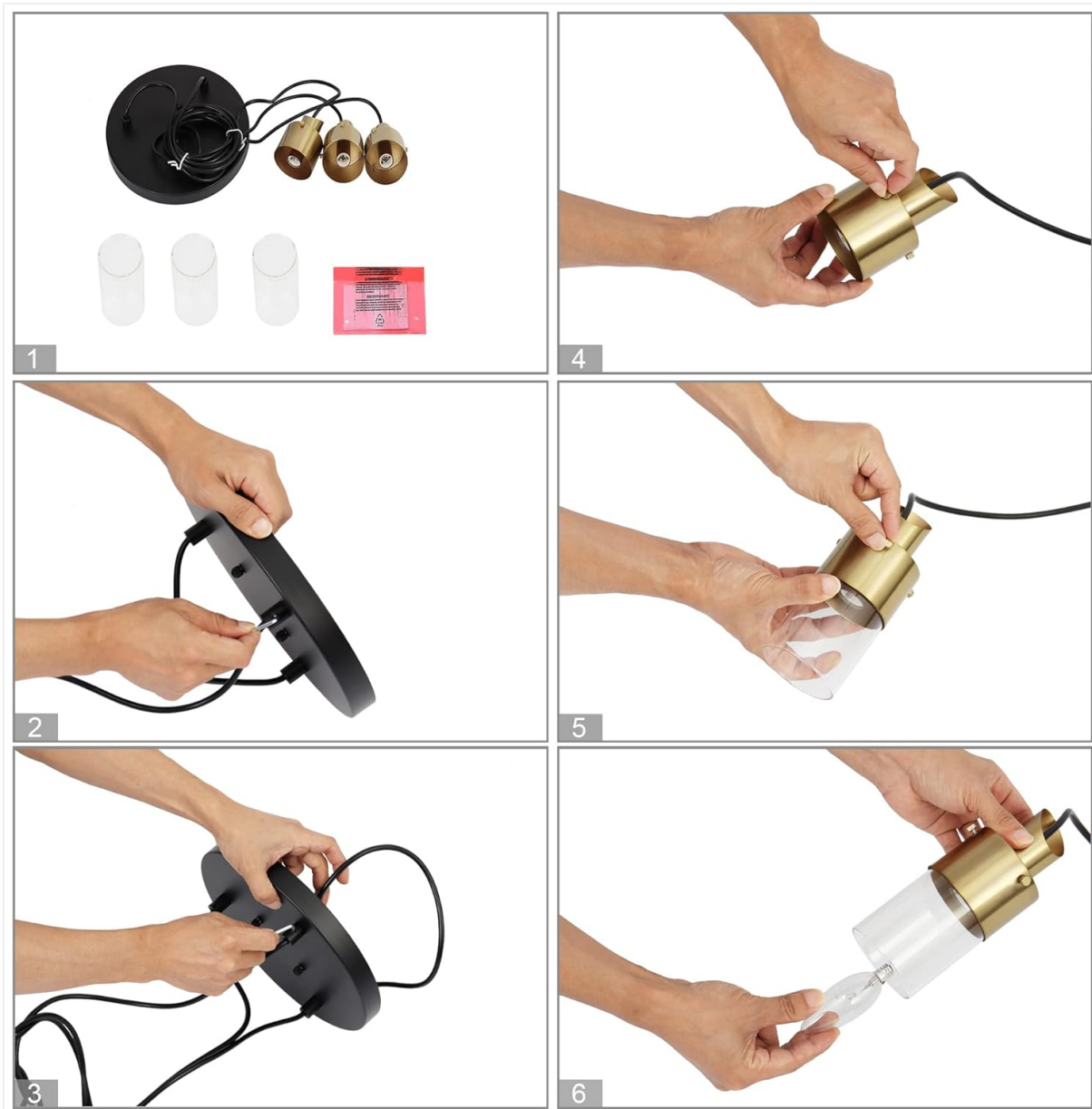
Figure 3: Assembly Steps