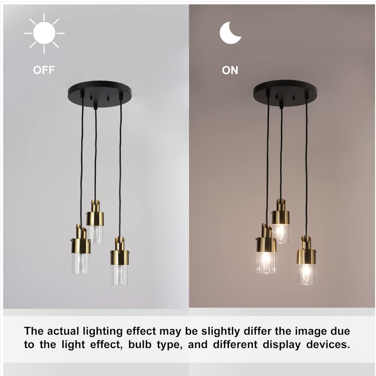
Figure 4: Light On/Off States