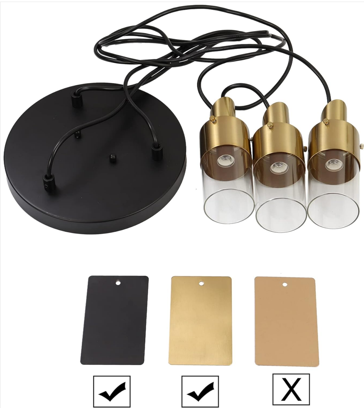
Figure 1: Included Components