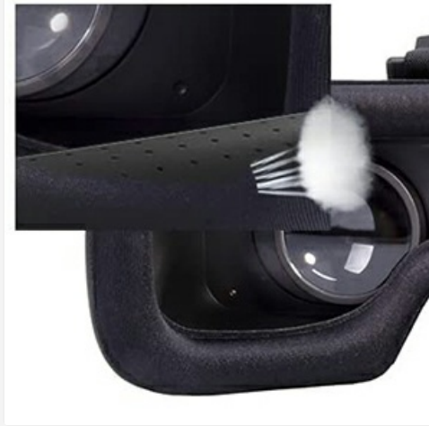
Figure 6.1: The breathable PU material mask ensures comfort during extended use and is easy to clean.