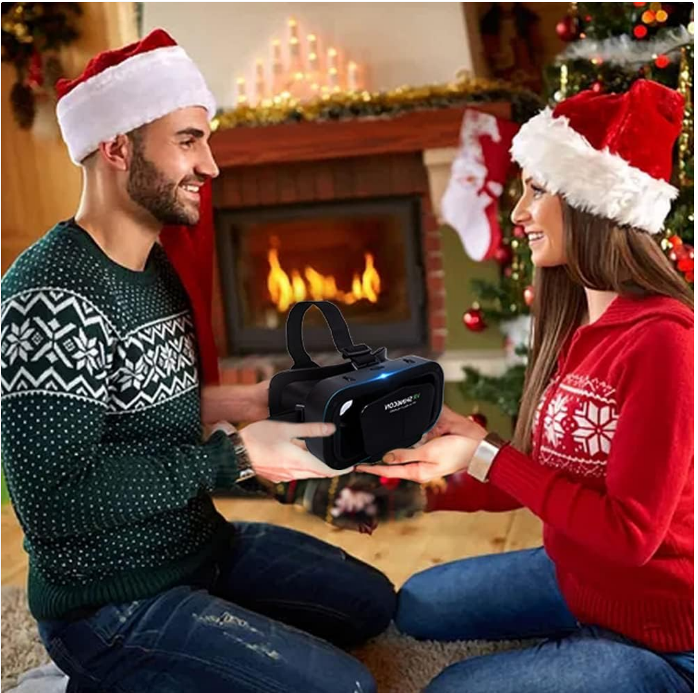
Figure 5.2: Transform your space into a private theatre for a realistic 3D movie experience with panoramic scene roaming.