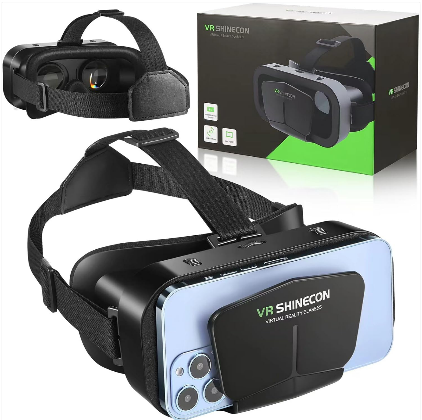
Figure 1.1: The VR SHINECON Virtual Reality VR Headset with its retail packaging.