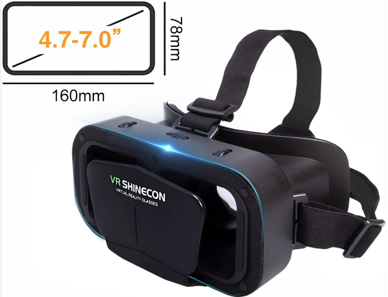
Figure 4.1: The headset is compatible with smartphones measuring 4.7 to 7.0 inches diagonally, with a maximum width of 78mm and length of 160mm.

It is suitable for most smart phone in the market with the size of 4.7 to 7.0inch. Bigger screen, better resolution, and you will enjoy better 3D effect!