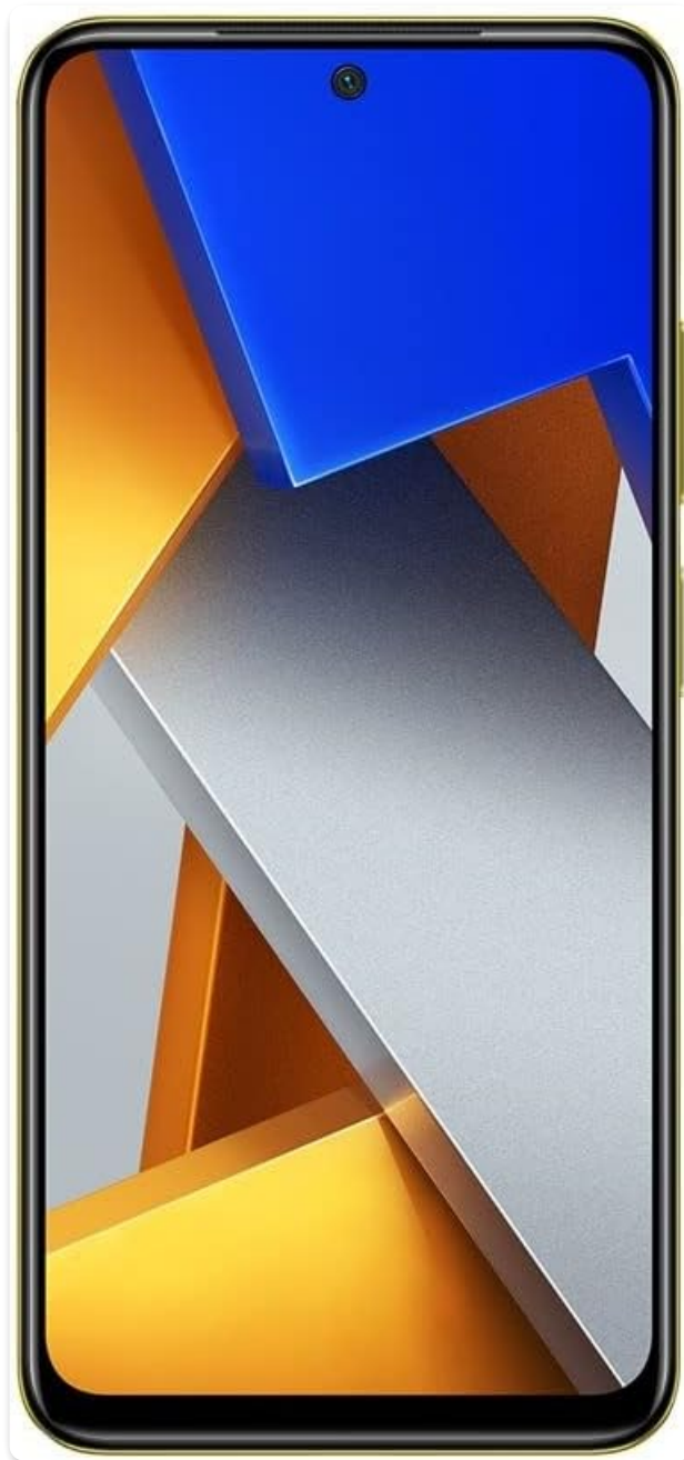
Figure 1: Front view of the Poco M4 PRO 4G smartphone, showcasing its vibrant AMOLED display.