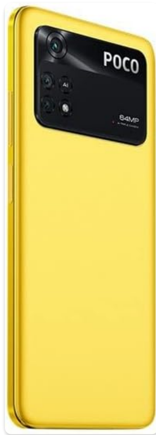
Figure 3: The immersive 6.43-inch FHD+ AMOLED DotDisplay of the Poco M4 PRO 4G.

providing a vibrant and smooth visual experience. It also includes a Certified Eye Care Display to reduce eye strain from blue light.