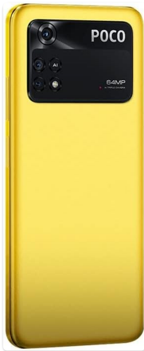
Figure 4: The rear of the Poco M4 PRO 4G, featuring the 64MP triple camera system.