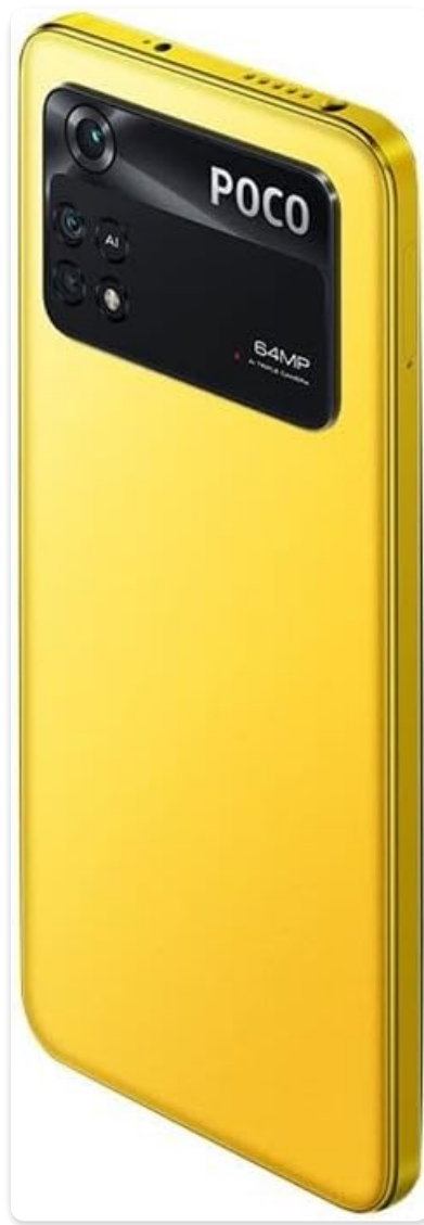
Figure 2: Side view of the Poco M4 PRO 4G, highlighting the SIM card tray location.