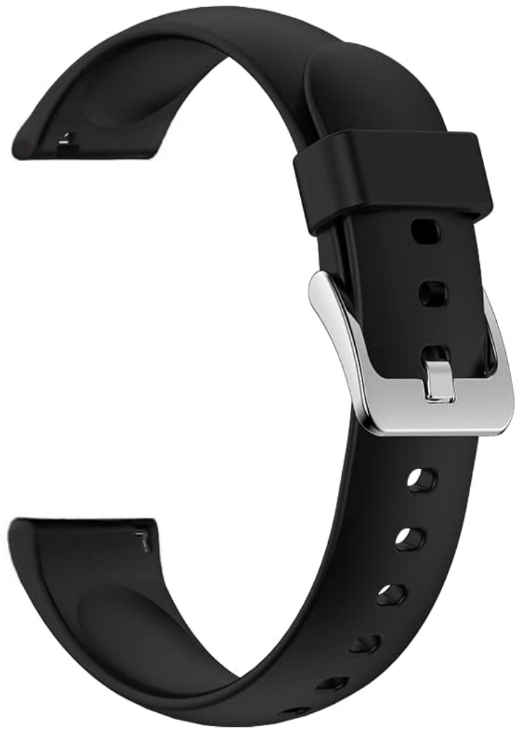
Image: Detailed view of the FITVII 16mm Quick Release Watch Band highlighting its key features: quick release pins for easy attachment, a durable stainless steel buckle, and flexible TPE material for comfort.