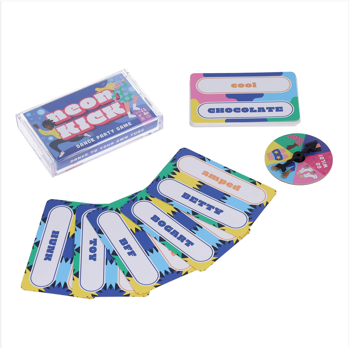
Image: The game box for Ridley's Neon Kick Dance Party Game, featuring colorful graphics and game title.