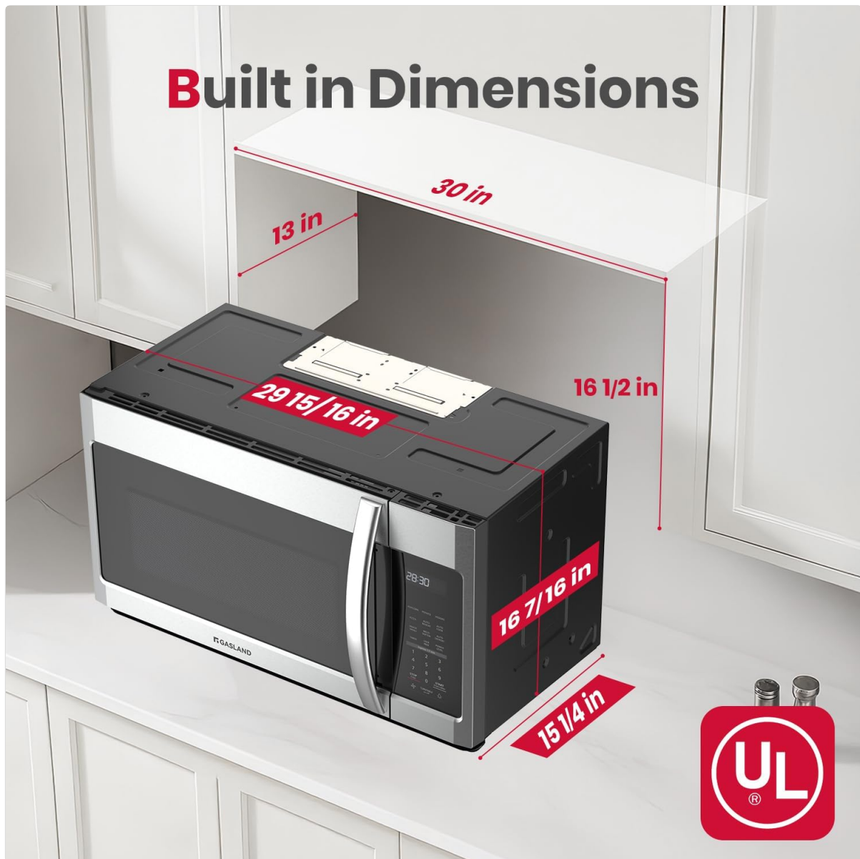
Figure 3.1: Built-in dimensions for the GASLAND OTR1902S microwave oven. The unit measures approximately 15.28 inches deep, 29.92 inches wide, and 16.42 inches high.