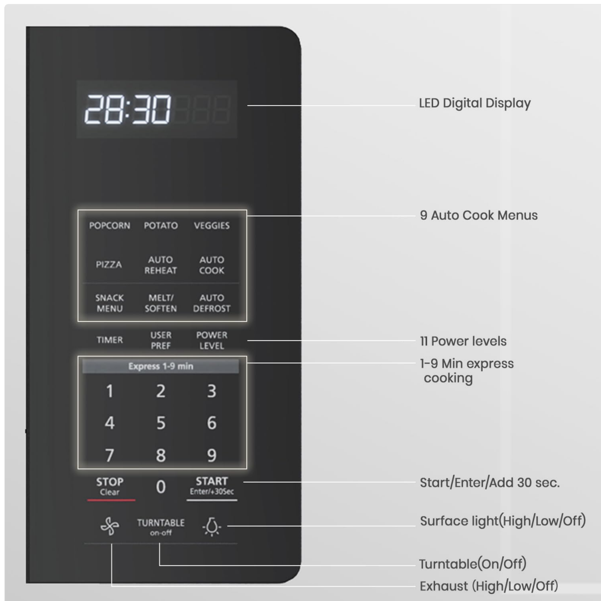
Figure 4.1: Detailed view of the control panel, highlighting the LED Digital Display, 9 Auto Cook Menus, 11 Power Levels, Express Cook, Start/Enter/+30 Sec, Surface Light, Turntable On/Off, and Exhaust Fan controls.

The control panel provides various options for cooking and convenience. Familiarize yourself with the buttons and their functions.