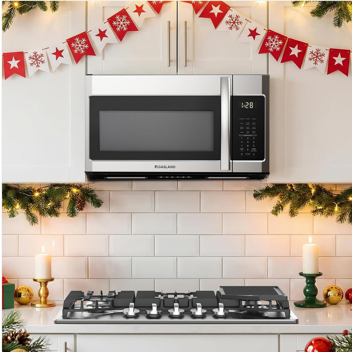
Figure 2.1: The GASLAND OTR1902S microwave oven in a kitchen setting, installed above a stove.