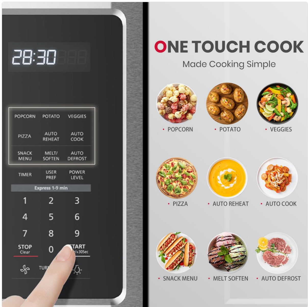
Figure 4.3: The control panel features dedicated buttons for Popcorn, Potato, Veggies, Pizza, Snack Menu, Melt/Soften, Auto Reheat, Auto Cook, and Auto Defrost for simplified cooking.