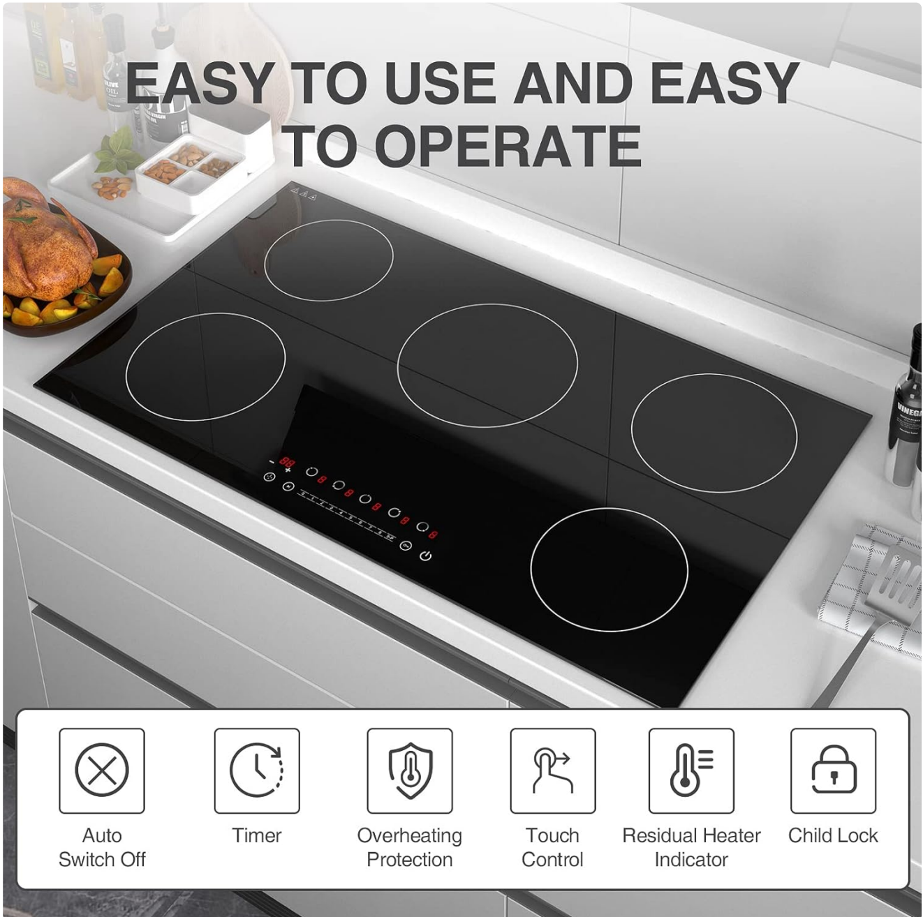
The control panel highlights key safety and operational features.