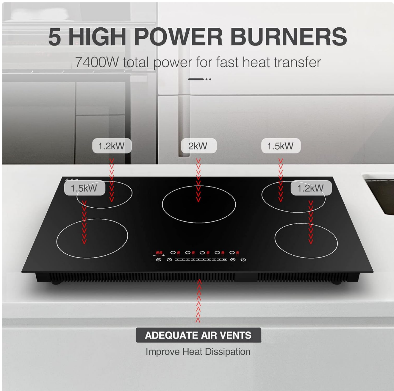
Illustration of the five high-power burners and their respective wattages.

The total power output is 7400W, ensuring fast heat transfer and energy efficiency.