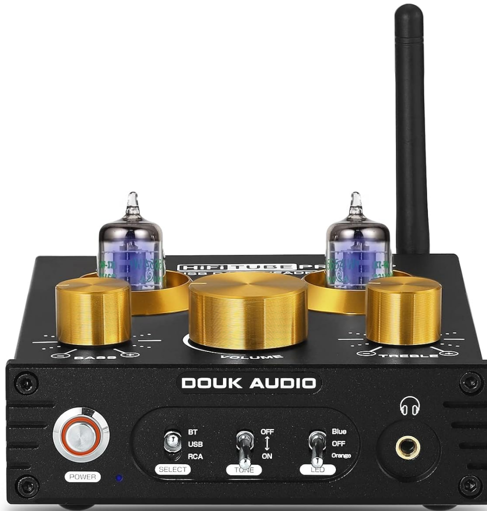
Image: Front view of the Douk Audio P1, showing the power button, input selector, tone controls (bass, volume, treble), tone bypass switch, LED indicator, and headphone output.