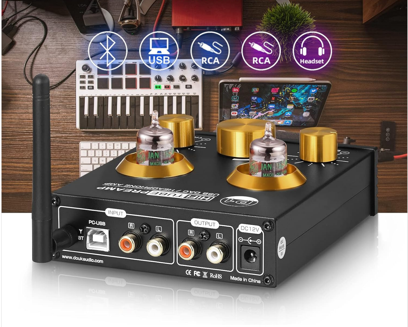
Image: Rear view of the Douk Audio P1, showing PC-USB input, RCA inputs, RCA outputs, DC 12V power input, and Bluetooth antenna port.

USB DAC、またはHiFiクリア、ウォーム、ダイナミック、スイートチューブを備えたヘッドフォンアンプとして使用するもともできます。