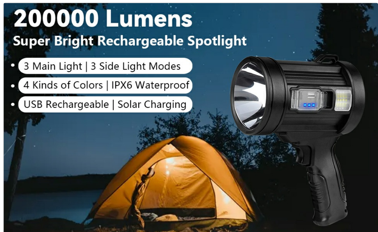
Image 1.1: The GAMERIEND W5113 Rechargeable Spotlight Flashlight in use, demonstrating its powerful beam illuminating a tent at night.

The GAMERIEND W5113 Rechargeable Spotlight Flashlight is a versatile and portable lighting device designed for various applications. It features multiple lighting modes, USB and solar charging capabilities, and a durable, water-resistant design. This manual provides essential information for the safe and effective use of your spotlight.