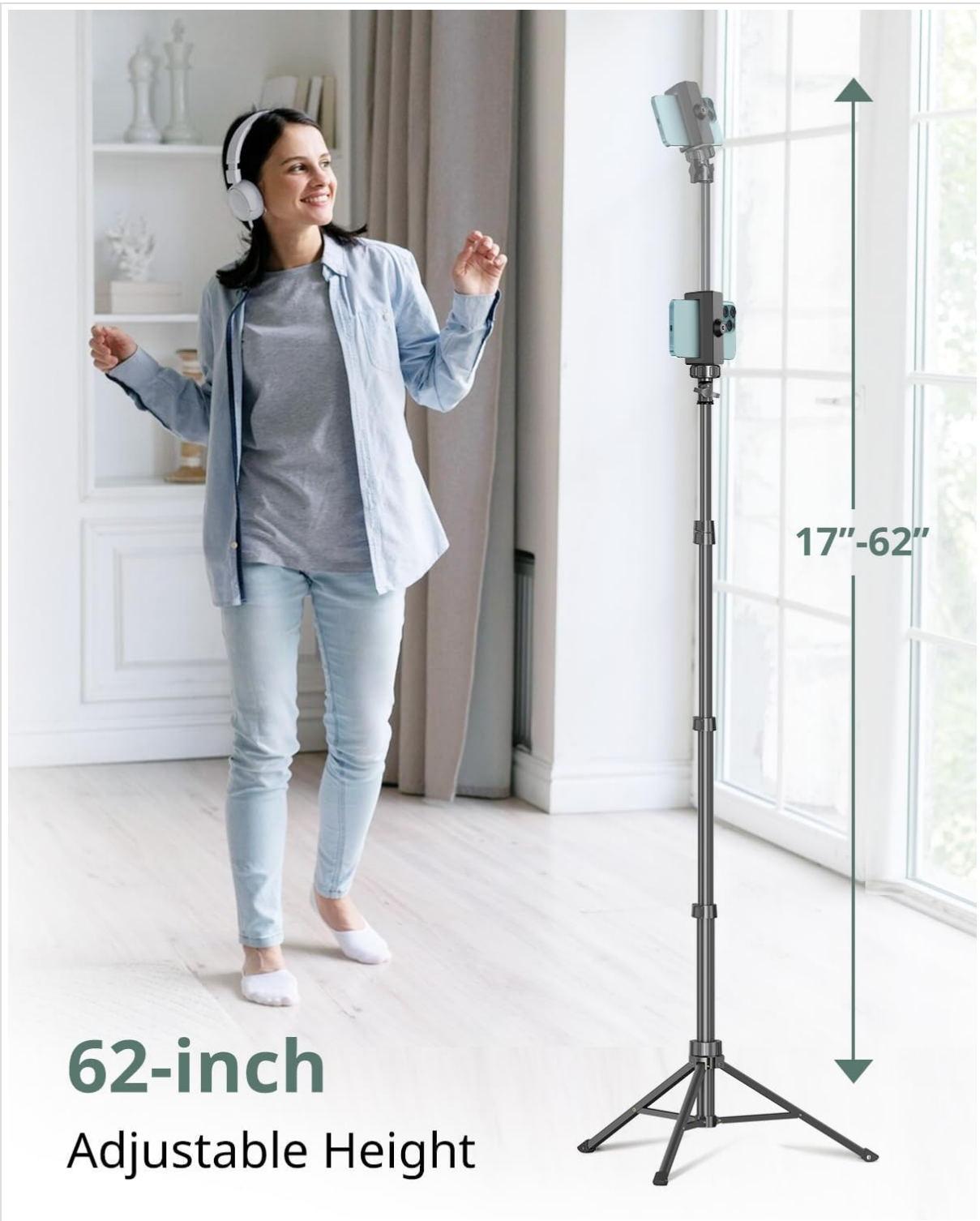
Figure 3.1: The tripod extended to its maximum height of 62 inches.