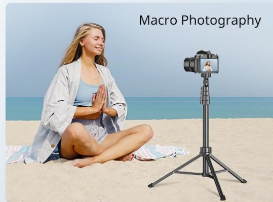
Figure 4.1: Examples of the tripod's versatile applications.