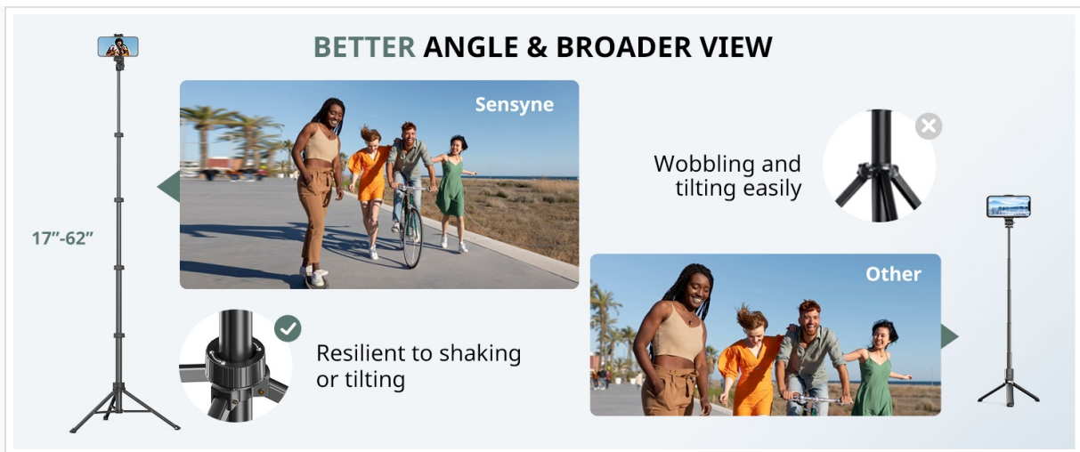
Figure 3.2: The tripod is compatible with various devices including smartphones, digital cameras, and GoPro cameras.