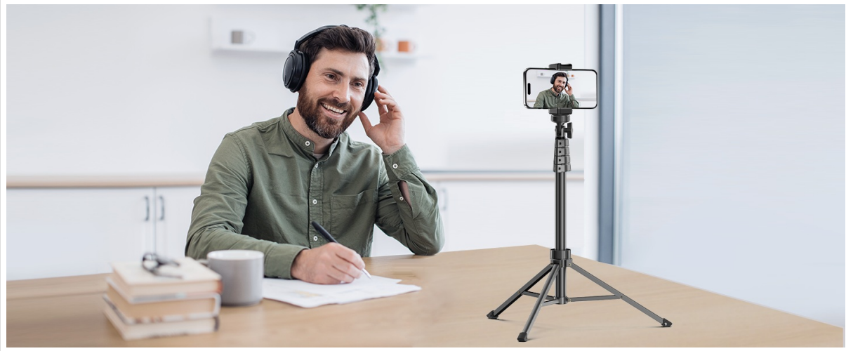
Figure 6.1: The tripod features an upgraded stand design for superior stability.