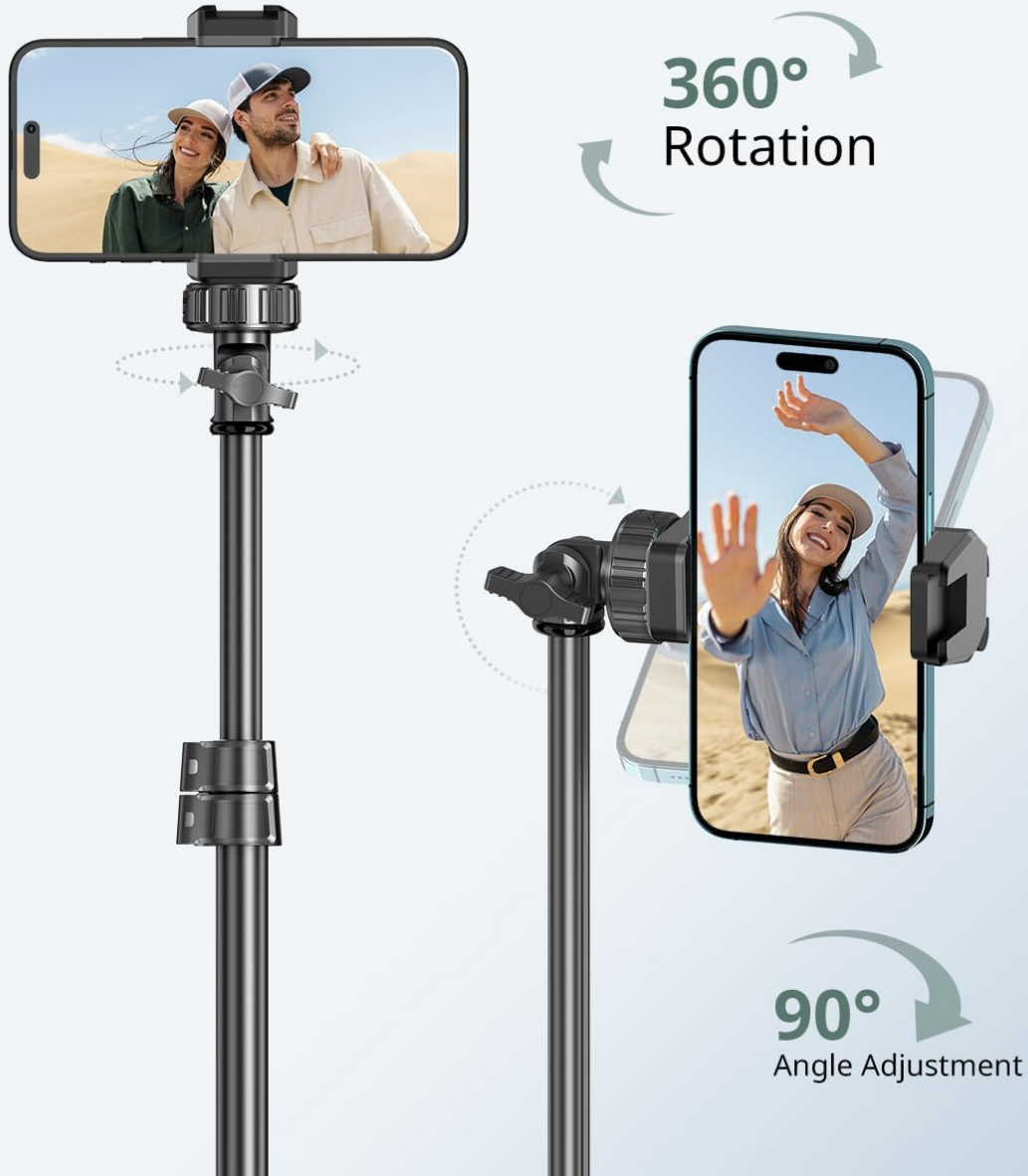
Figure 4.2: The phone holder supports both vertical and horizontal modes with full rotation and angle adjustment.