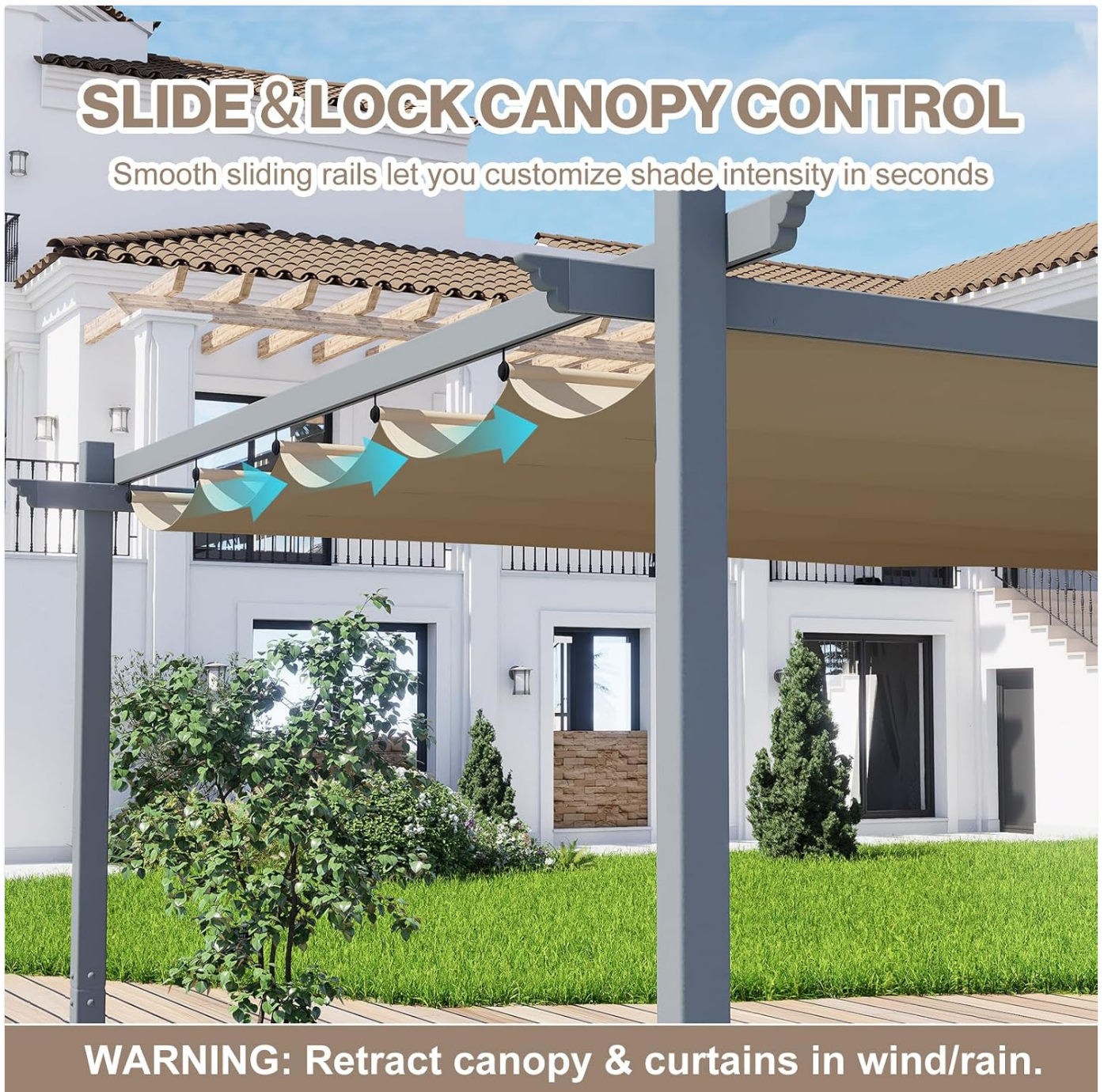
Image: A close-up view of the pergola's retractable canopy system, highlighting the smooth sliding rails and locking mechanism for adjusting shade.