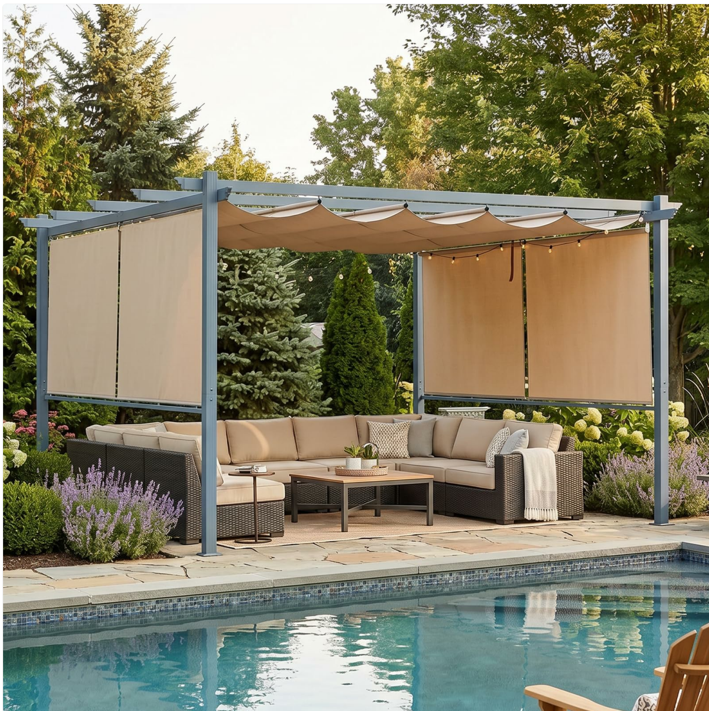
Image: The Aoodor 10x12 ft Outdoor Pergola with its retractable canopy partially extended, providing shade over outdoor furniture on a patio.