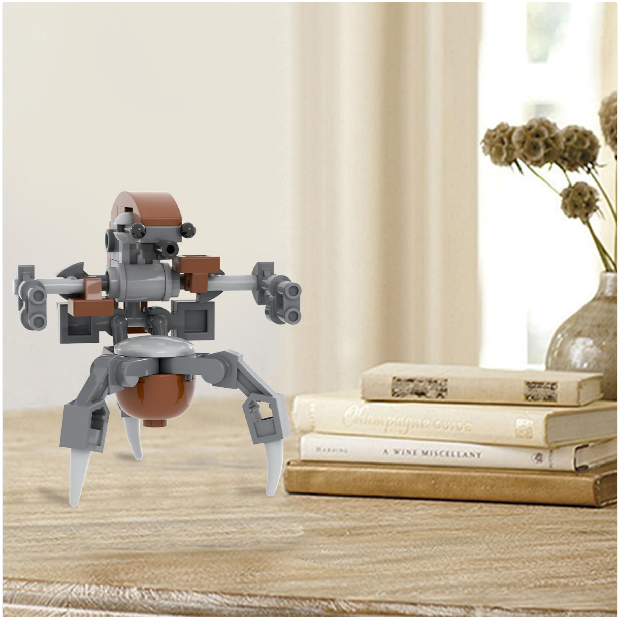
Image: The assembled MOOXI-MOC Destroyer Droideka model displayed on a wooden table next to books and a plant, showcasing its completed form.