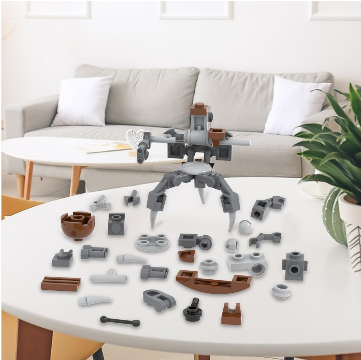
Image: All 86 building blocks for the Destroyer Droideka set laid out on a white table, ready for assembly.