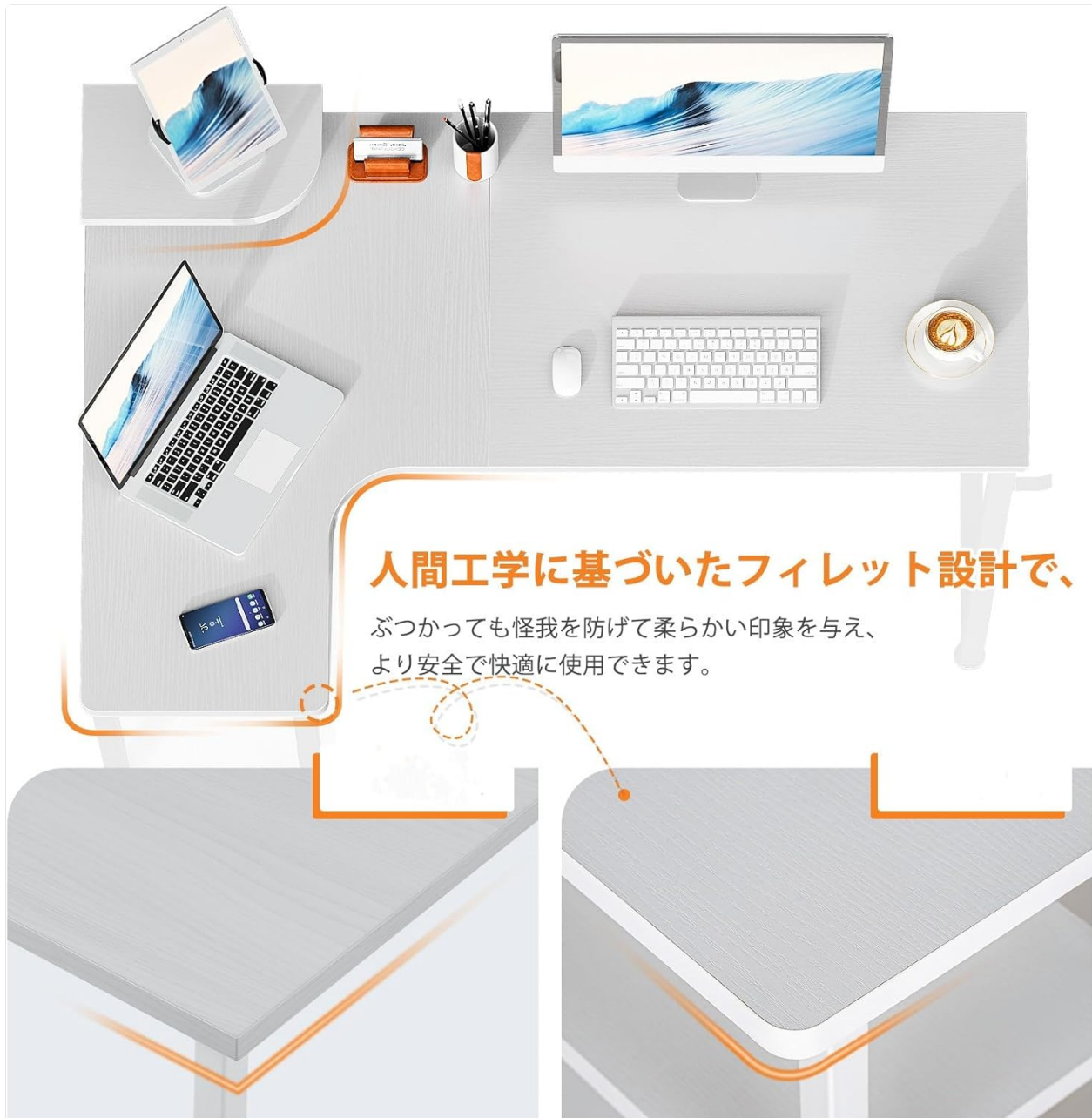
Image: Detail of the desk's fillet design, highlighting the rounded edges for user safety.