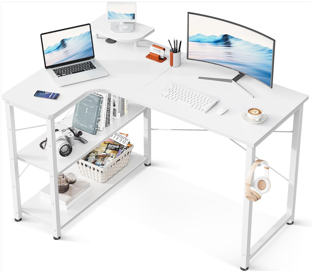
Image: The ODK L-shaped computer desk, showcasing its spacious white tabletop and integrated shelving, ideal for a modern workspace.

Key features include an integrated rack at the base for easy access to books and documents, and a sturdy construction with a 60kg tabletop load capacity. The desk is built with reinforcement pipes, cross-bracing hardware, and adjustable feet to ensure stability and a wobble-free experience.