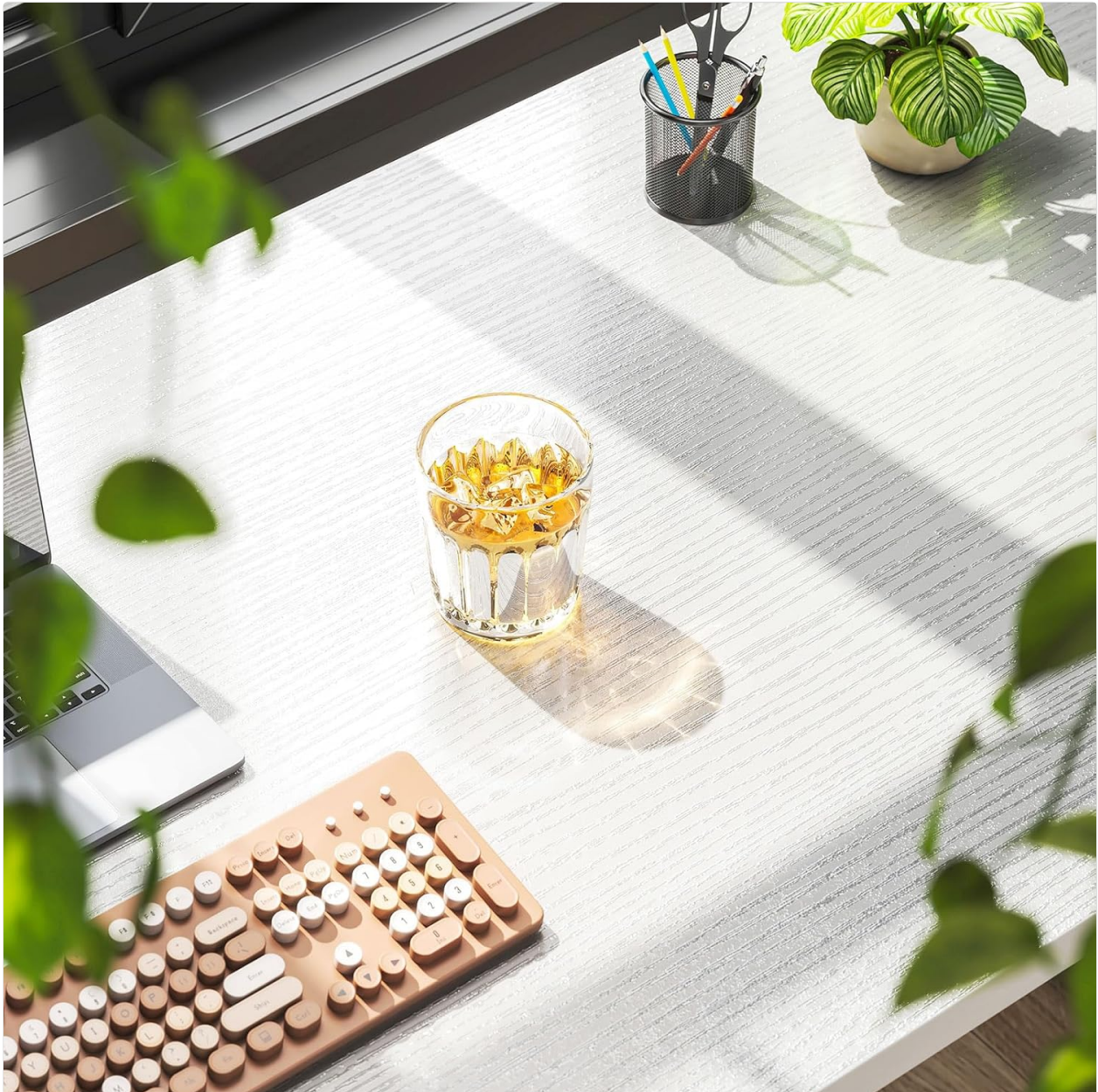
Image: A close-up view of the desk's tabletop texture, demonstrating its durable and easy-to-clean surface.