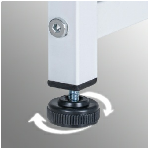
Image: Detail of the adjustable foot, which can be rotated to level the desk on uneven floors.