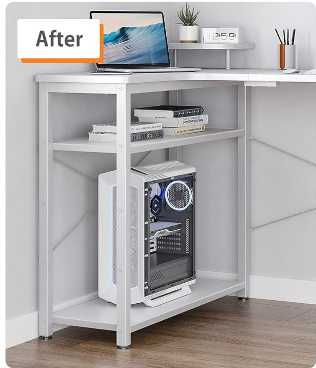
Image: Illustration of the adjustable shelf height, allowing customization for various storage needs.