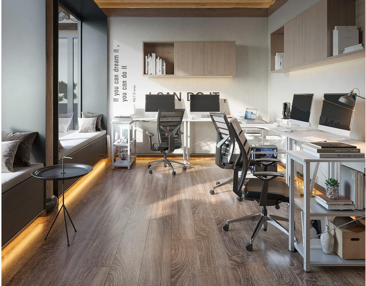
Image: The desk in an office setting, highlighting its functionality for professional work.

広い天板と足元がオープンスペースなので移動もスムーズ 圧迫感なく縦横無尽に作業でき、作業効率が格段にアップします。