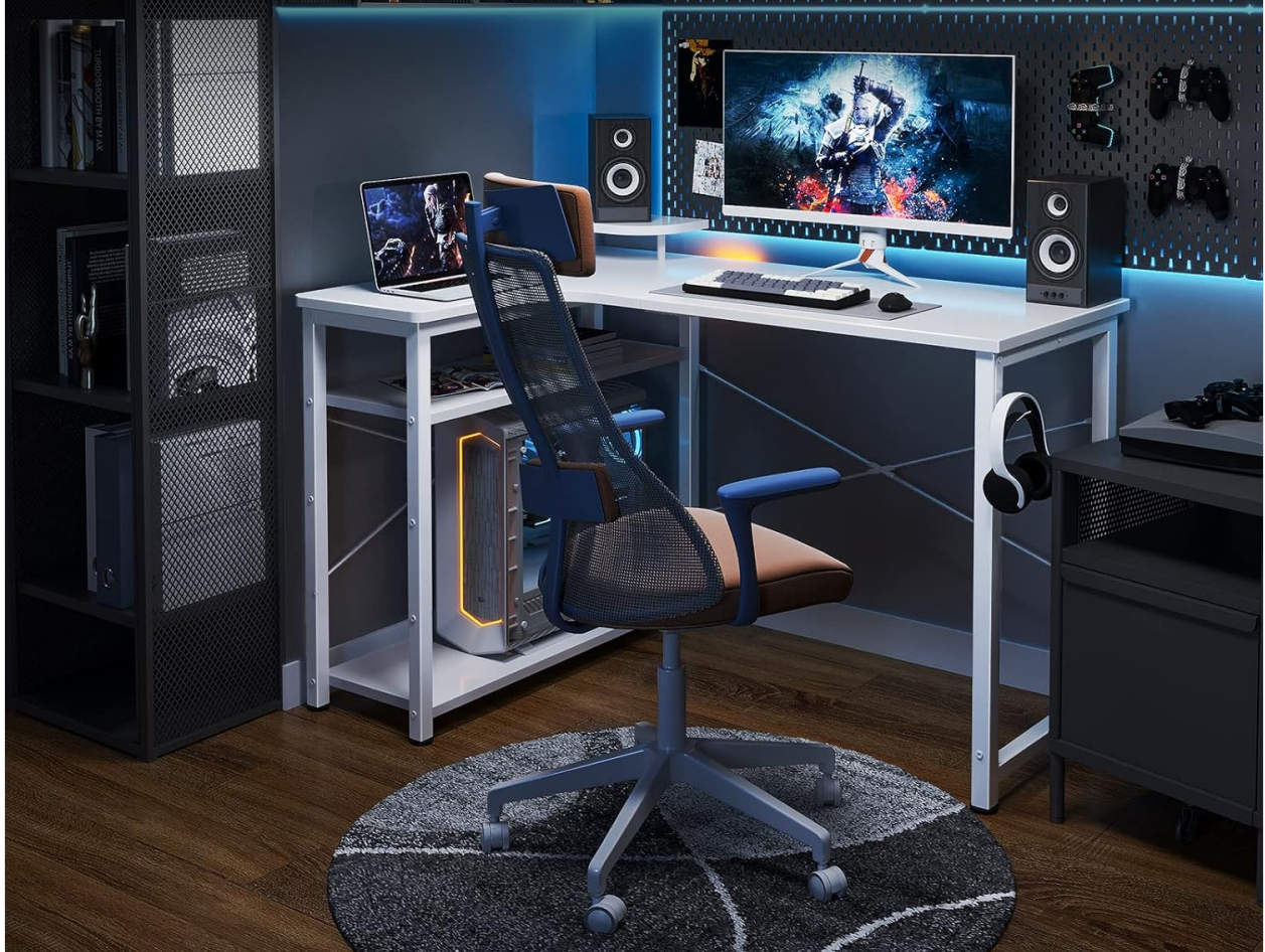
Image: The desk configured for a gaming setup, demonstrating its suitability for immersive gaming experiences.

仕事用はもちろん、ゲーム環境をアップグレードする ゲーミングデスクとしても大活躍！