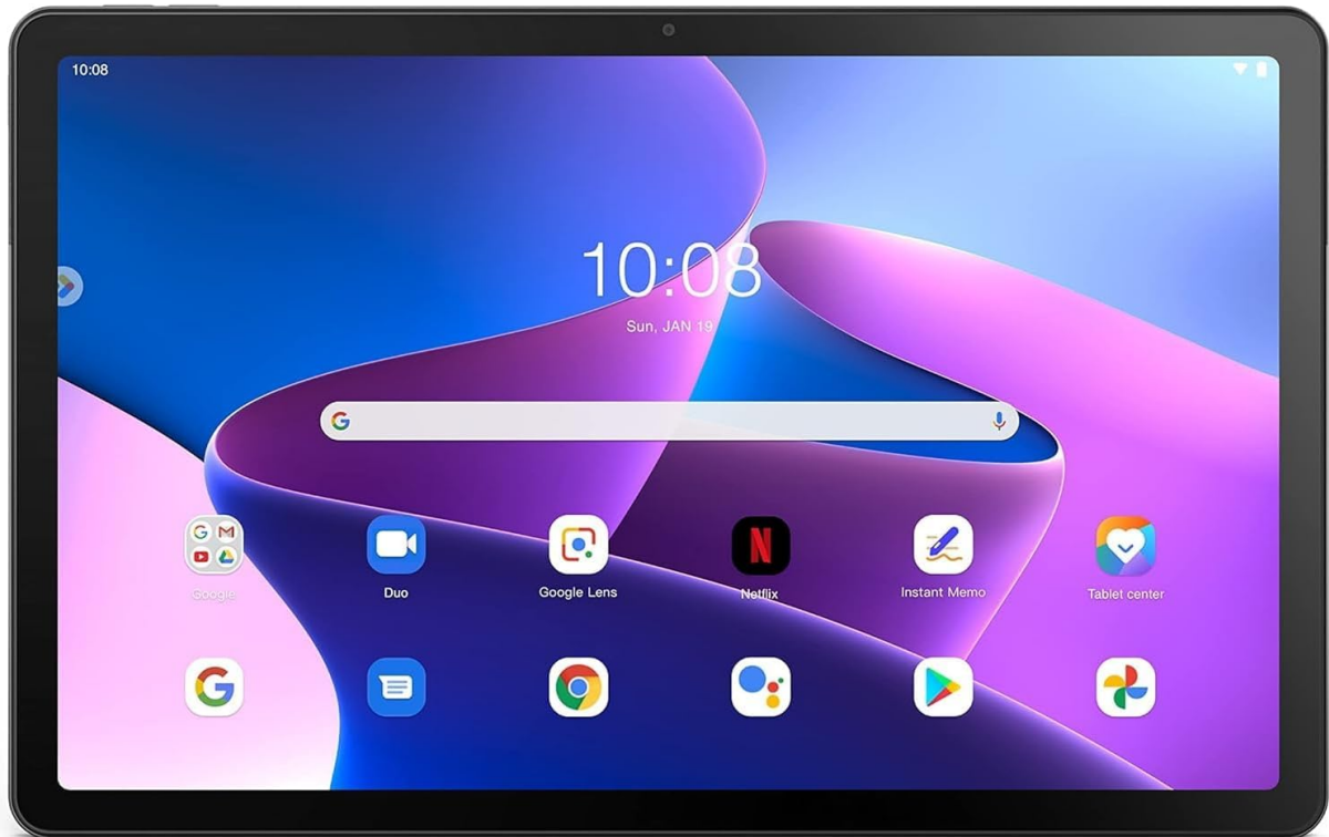
Figure 2: The tablet's home screen, displaying various applications.