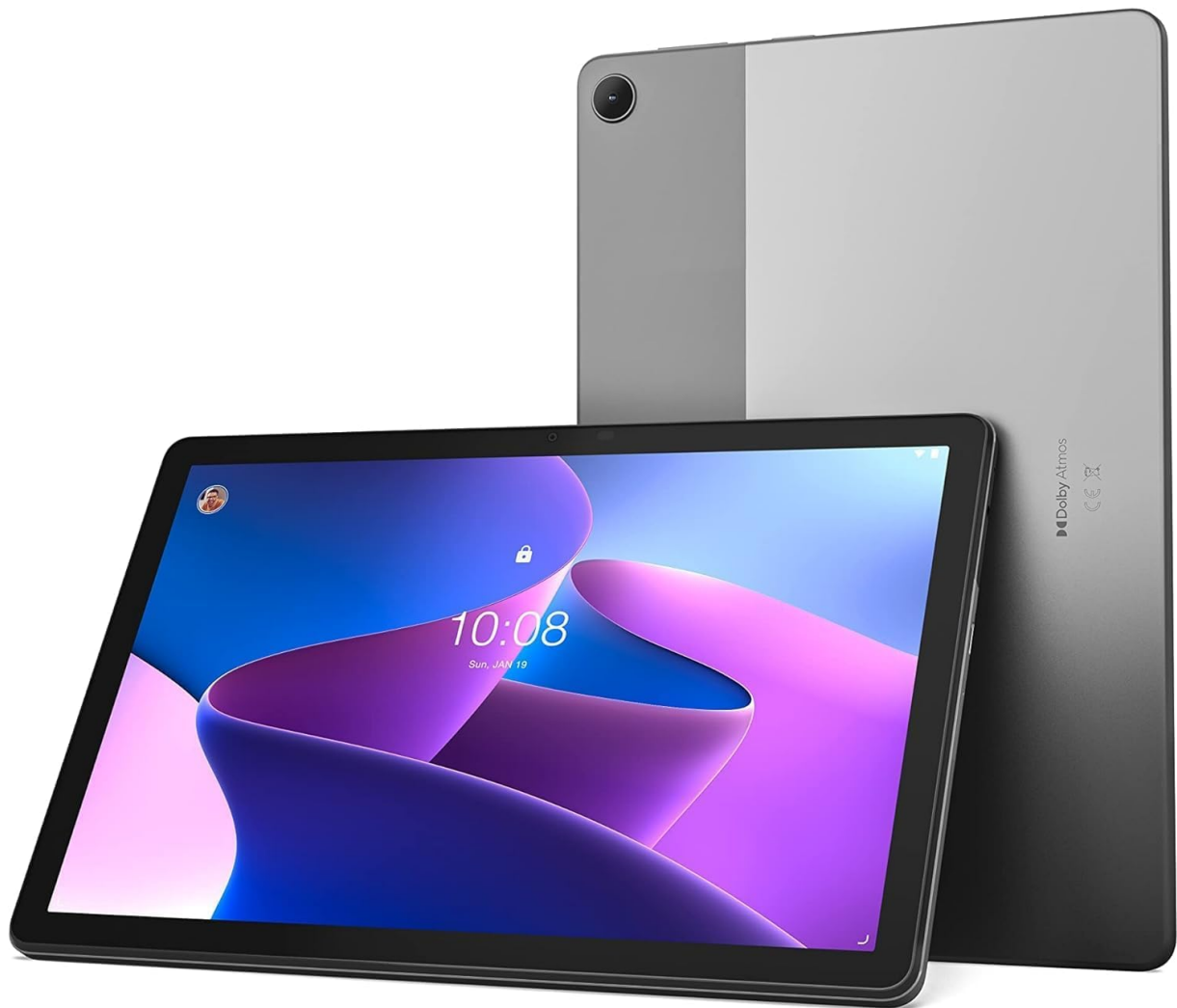
Figure 1: Front and back view of the Lenovo Tab M10 Plus (3rd Gen).