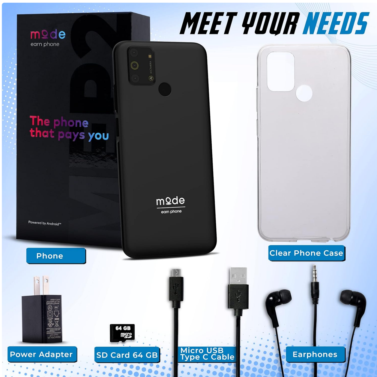
Figure 2.1: Included Accessories

This image displays all the items included in the Mode EarnPhone package: the smartphone itself, a power adapter, a Micro USB Type C cable, earphones, a 64 GB SD card, and a clear phone case. These accessories ensure the phone is ready for immediate use.