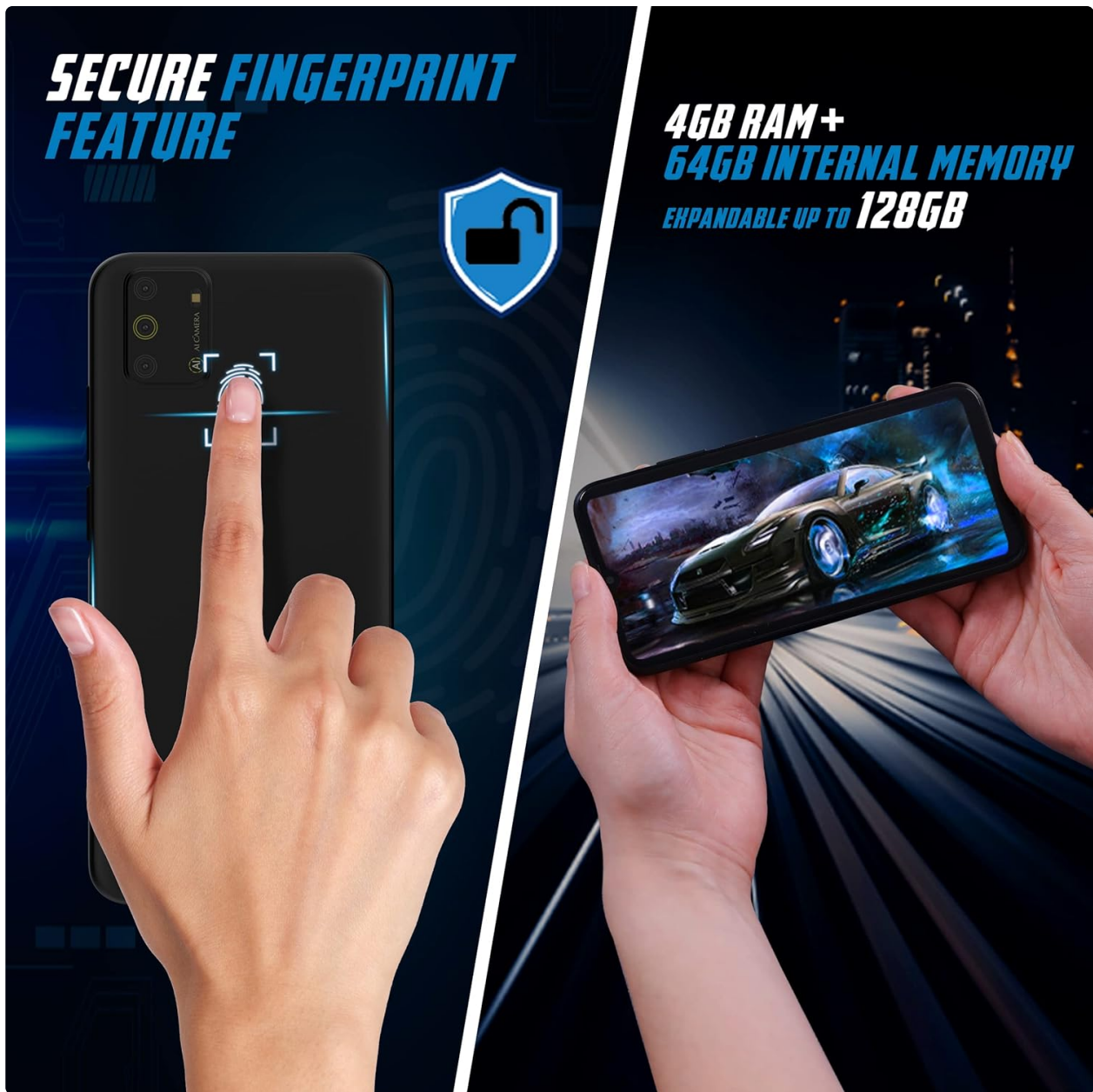
Figure 3.2: Secure Fingerprint Feature

This image illustrates the secure fingerprint feature of the Mode EarnPhone, showing a finger touching the rear-mounted fingerprint sensor. This feature allows for quick and secure unlocking of the device. The image also mentions the phone's 4GB RAM and 64GB internal memory, expandable up to 128GB.