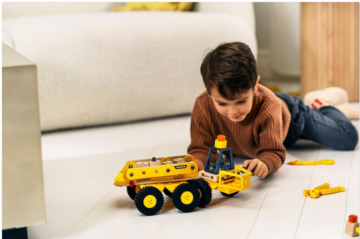
Image: A child engaging with the fully assembled BRIO Builder Volvo Hauler.

The Volvo Hauler features realistic play functions, including a dumping mechanism and a battery-operated warning light, offering an engaging and educational experience.