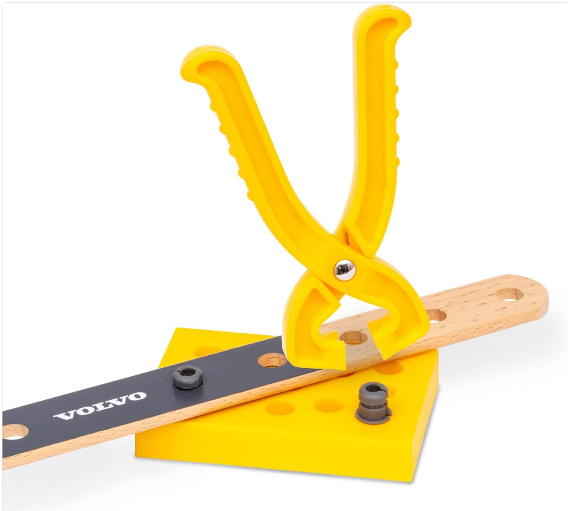
Image: Close-up view of the plier tool in action, demonstrating how to connect two toy components.