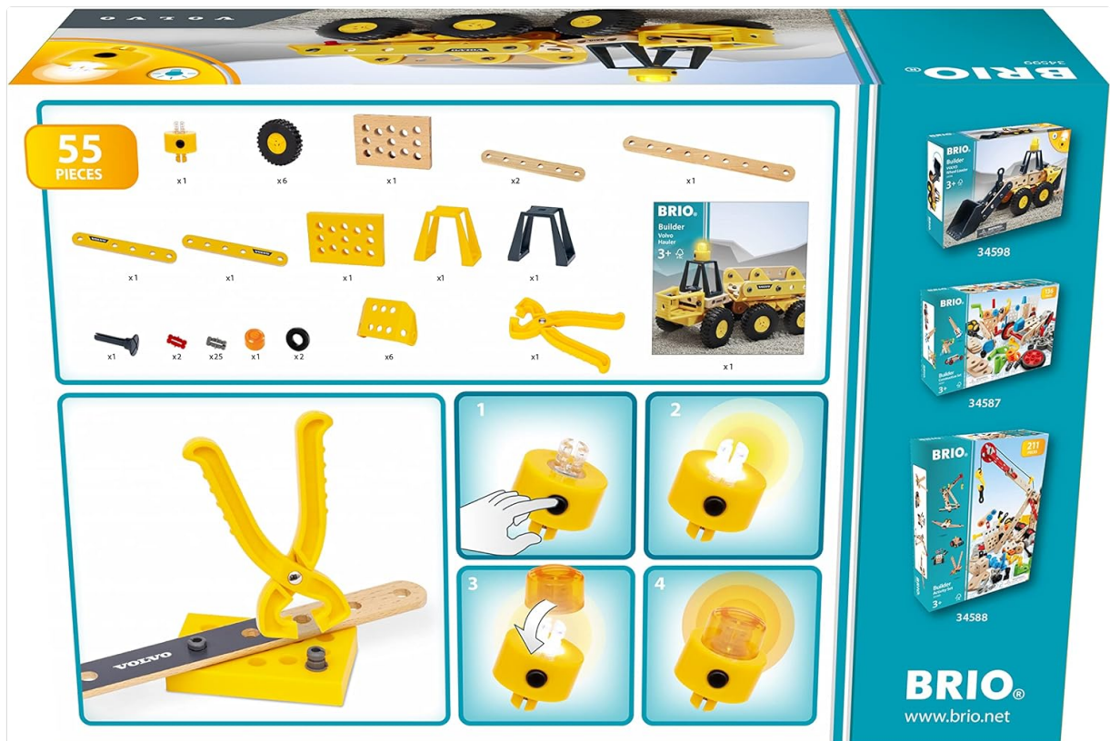
Image: The back of the product packaging illustrating all 55 included pieces and initial assembly steps.