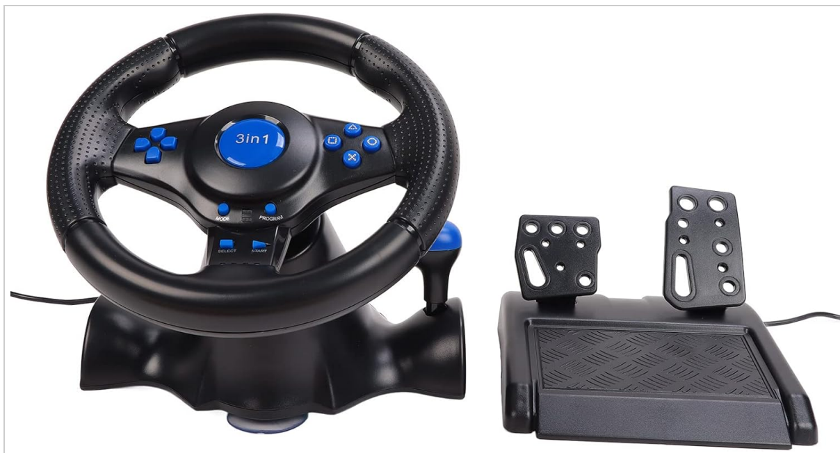
Image 1.1: The ASHATA Racing Wheel and pedal set, featuring a black steering wheel with blue accents and a separate black pedal unit.

Please read this manual thoroughly before use to ensure proper functionality and to prevent damage to the product.