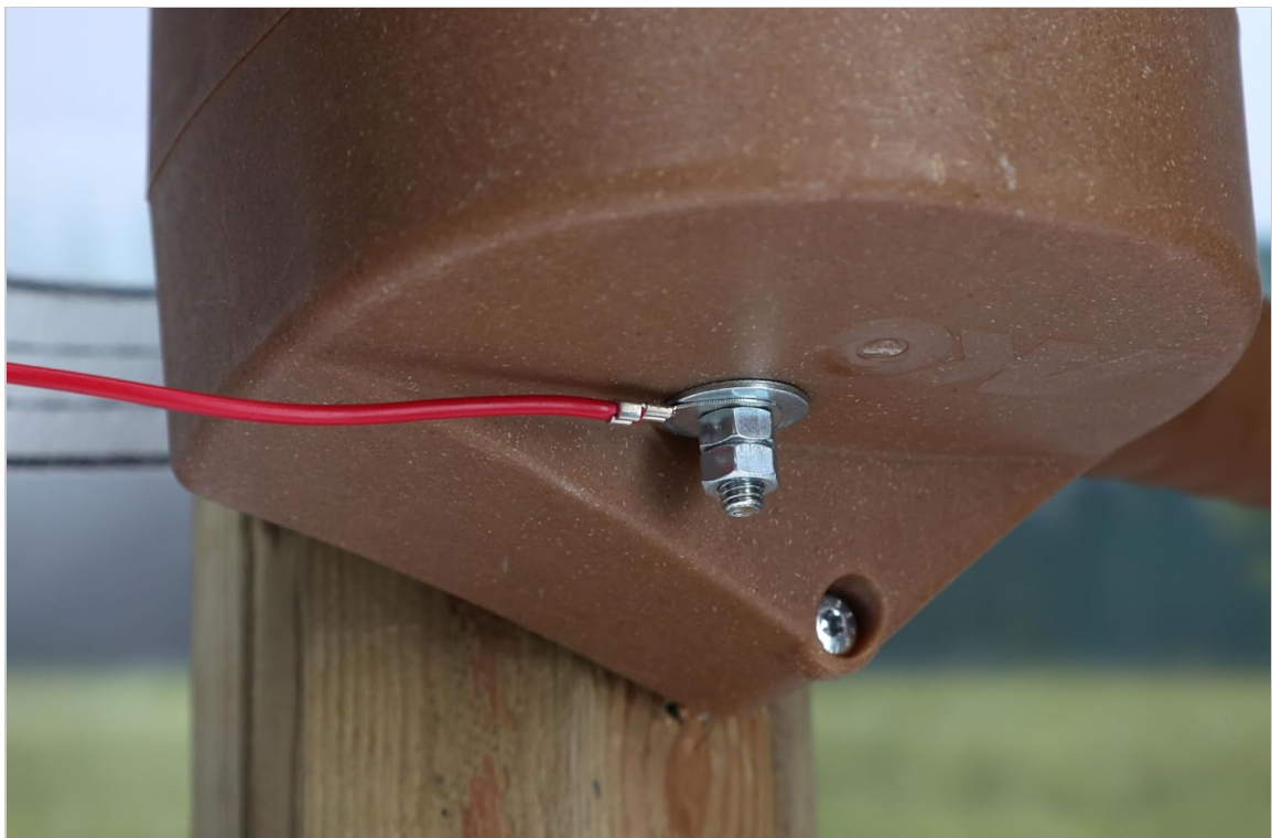
Image: A detailed shot of the screw terminal on the Flexigate casing where the electrification cable is securely fastened with a nut and washer.