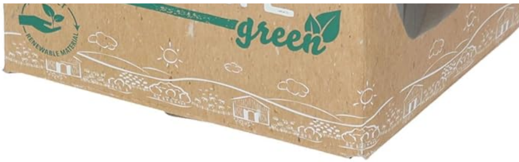
Image: The AKO Flexigate Premium Goal Set, including the casing and gate handle with tape, shown in its retail packaging.