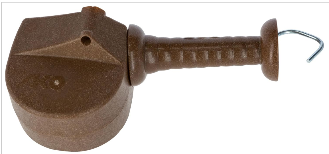
Image: The AKO Flexigate system with the gate handle fully retracted, showing the compact design of the casing when the gate is open.