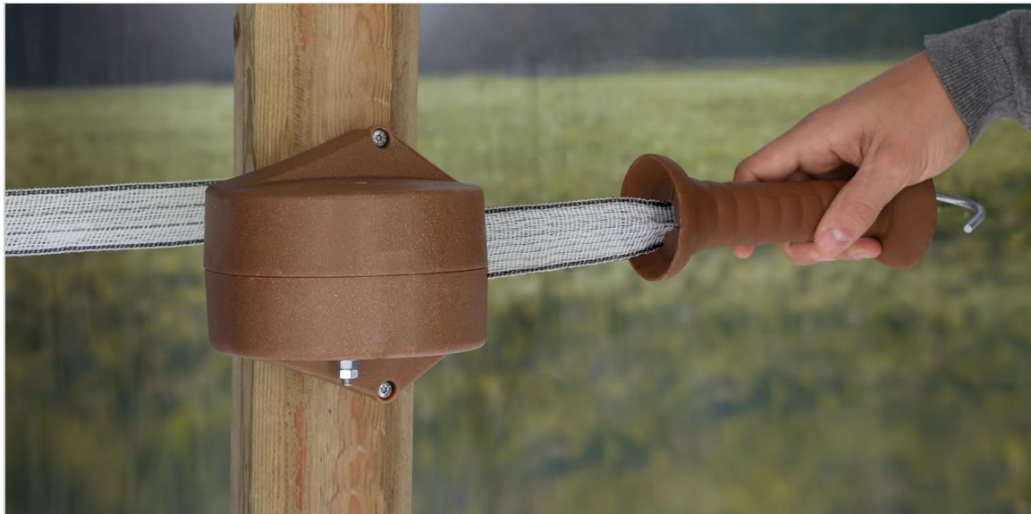
Image: The Flexigate casing securely mounted on a wooden post, with the gate handle and tape extended across the opening.