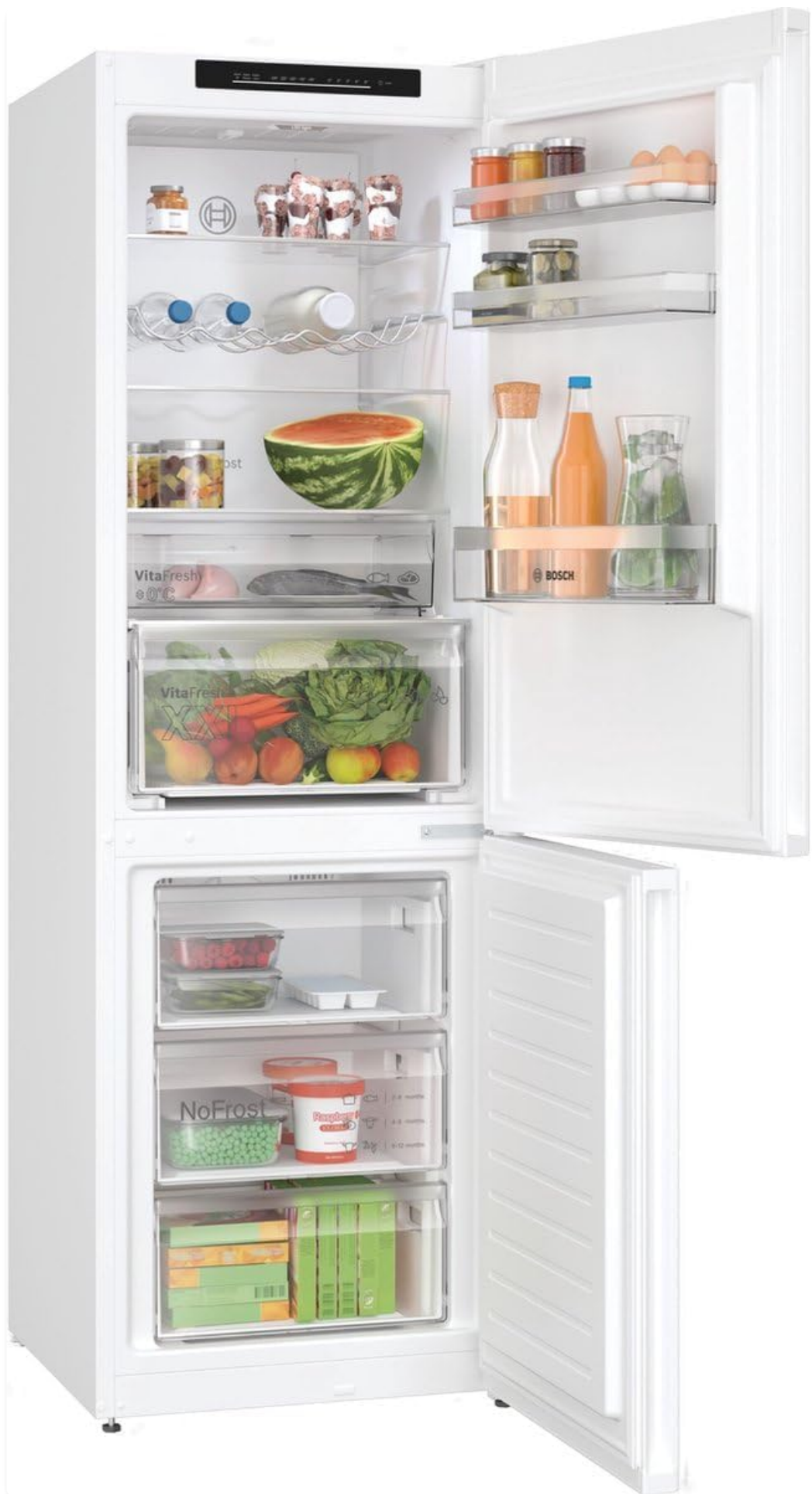
The interior of the Bosch KGN362WDF Refrigerator-Freezer with both doors open, illustrating the VitaFresh XXL drawers, adjustable glass shelves, door bins, and freezer compartments.