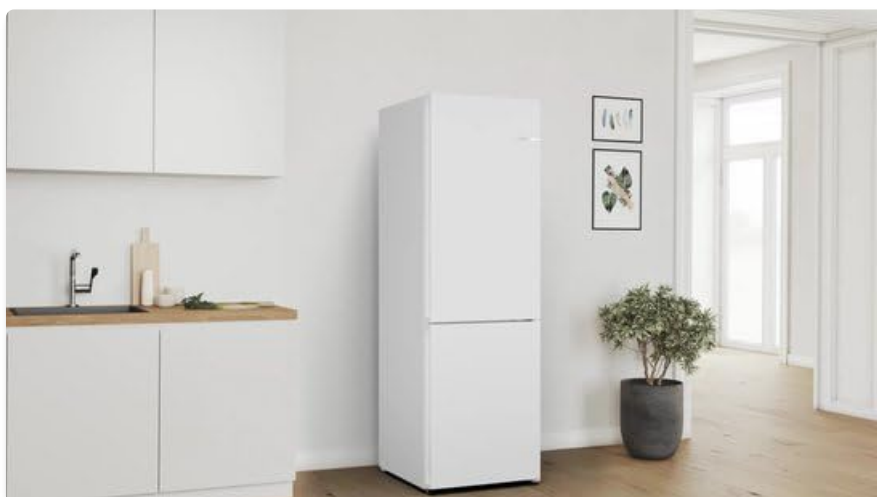
The Bosch KGN362WDF Refrigerator-Freezer integrated into a kitchen environment, demonstrating its compact footprint and aesthetic appeal.