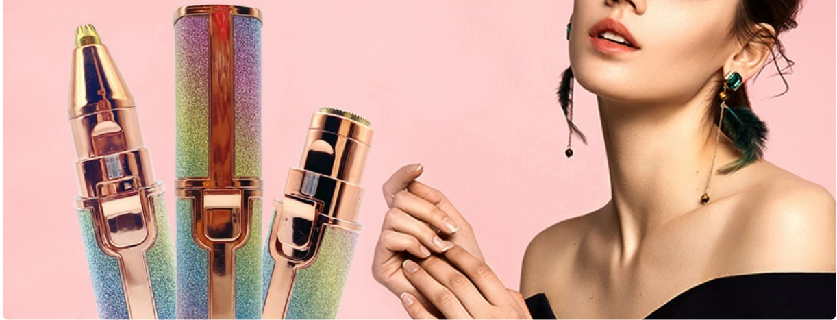
Image: The device in use, highlighting its fast, clean, safe, and painless operation for facial hair removal.

2 in 1 Personal Detail Trimmer Smooth Skin and Attractive Face