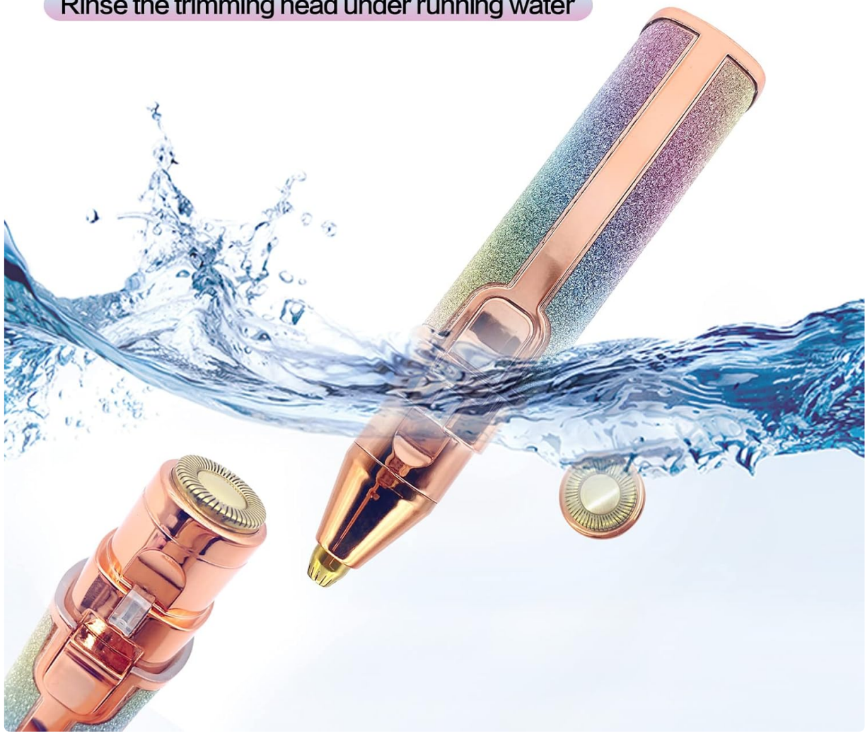
Image: The trimming heads being rinsed under water, illustrating the easy cleaning process.

Rinse the trimming head under running water