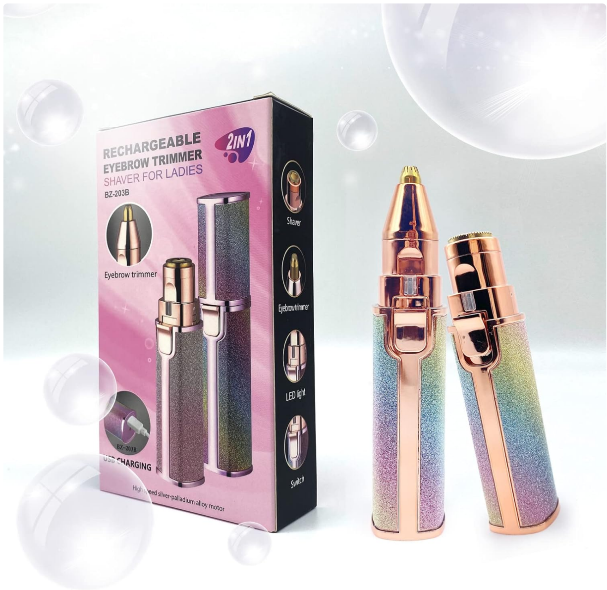
Image: The complete package contents, including the main device, two interchangeable heads, a cleaning brush, and a USB charging cable.