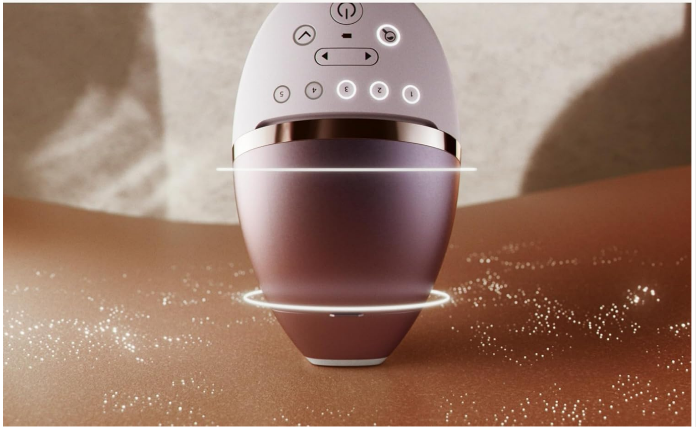
Image 4.1: The SmartSkin Sensor automatically detects skin tone to suggest an optimal light setting for comfortable and effective treatment.