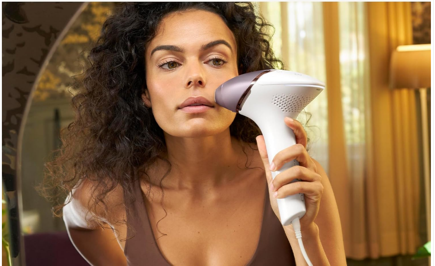
Image 2.1: The device features skin contact sensors to ensure safe operation by preventing flashes unless in full contact with the skin.

Built for safety Skin contact sensors prevent unintentional flashing