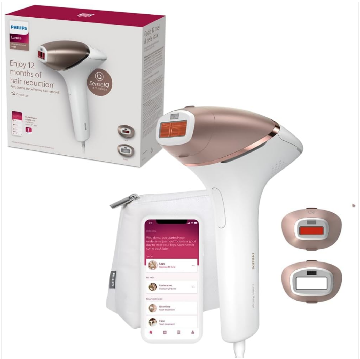
Image 1.1: Philips Lumea IPL Hair Removal Device BRI945/00, showing the device, its packaging, and the included body and face attachments.