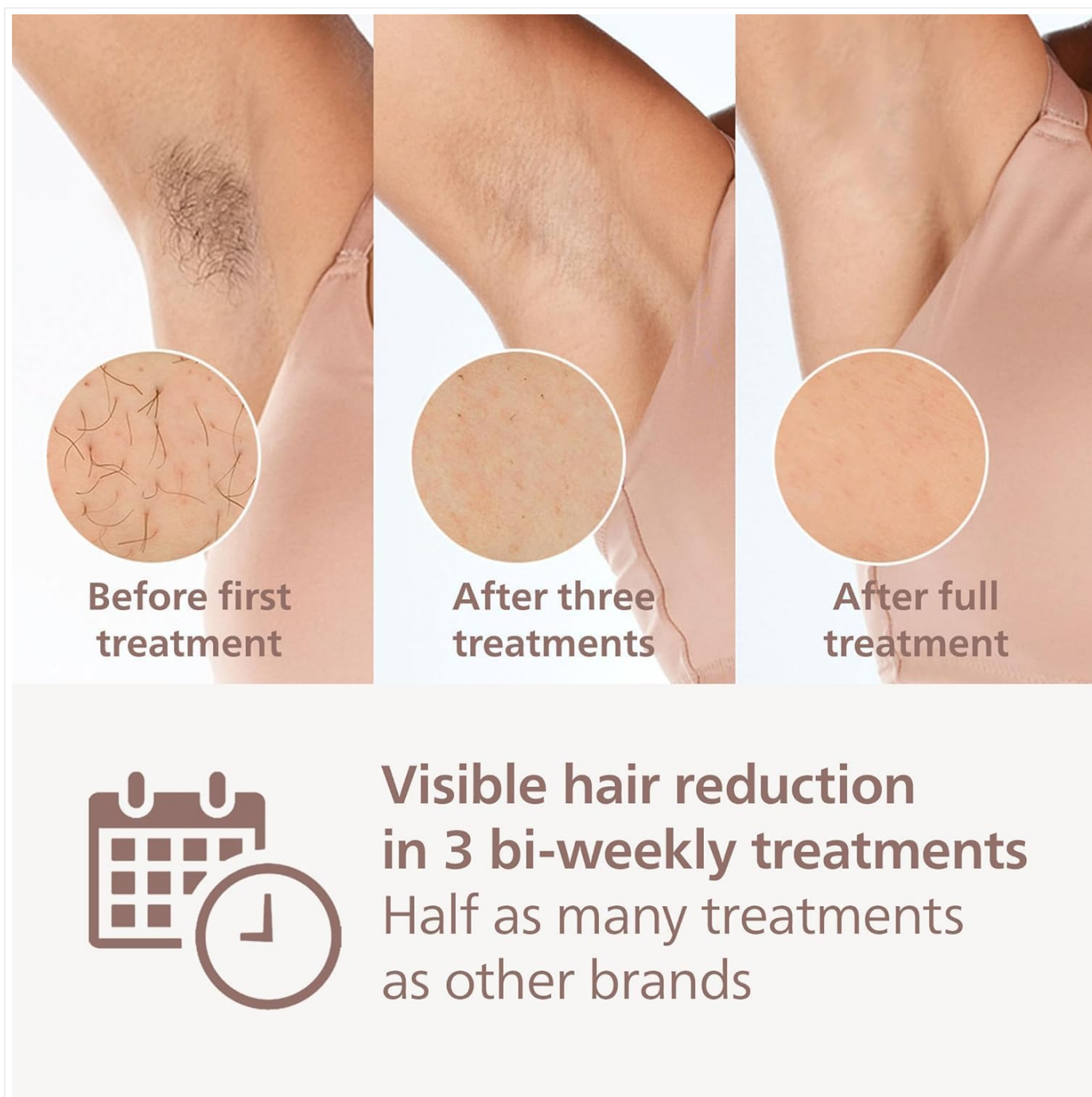
Image 4.5: Visual representation of hair reduction progress: before first treatment, after three treatments, and after full treatment.

The Philips Lumea IPL app can assist you in creating a personalized treatment plan, tracking sessions, and receiving reminders.