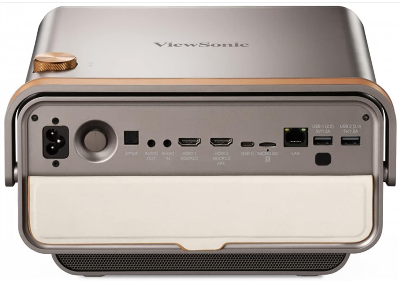
Figure 4: Rear view of the projector displaying various input and output ports including HDMI, USB-C, and audio jacks.