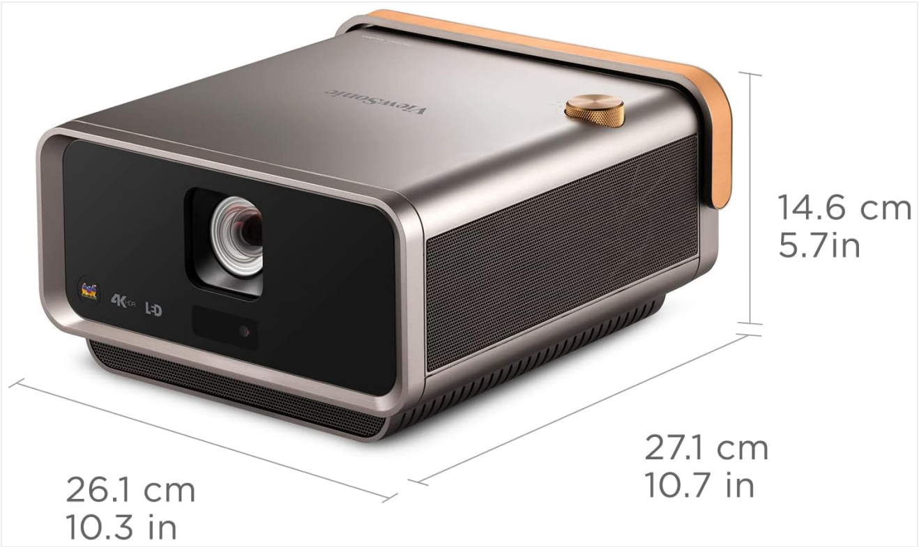
Figure 8: Image detailing the physical dimensions of the ViewSonic X11-4K projector.