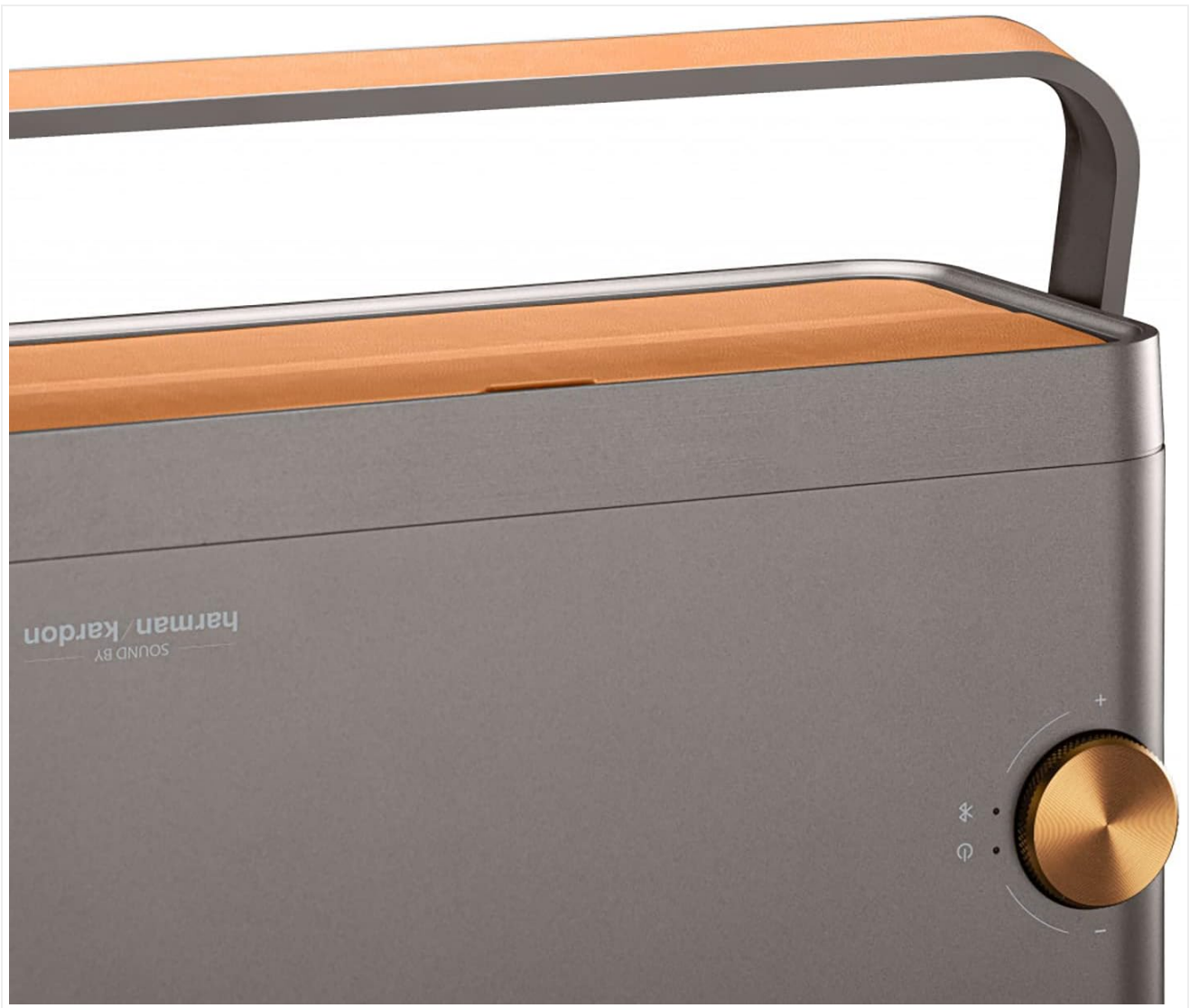
Figure 3: Top view of the projector showing the integrated control knob for power and volume, along with other control buttons.