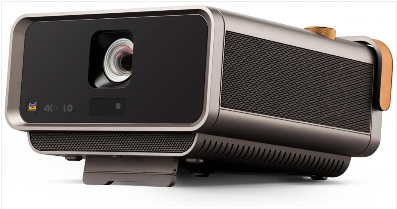
Figure 1: Front view of the ViewSonic X11-4K projector, showcasing the lens and sleek design.

projection area. The short throw lens can project images up to 100 inches from a short distance. Utilize the instant auto focus, H/V keystone, and 4-corner adjustments to achieve a perfectly aligned and sharp image.