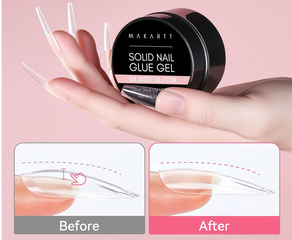
Image 5.2: Illustration of seamless blending achieved with the gel.