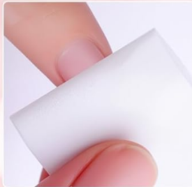
1. Remove the cuticle oil