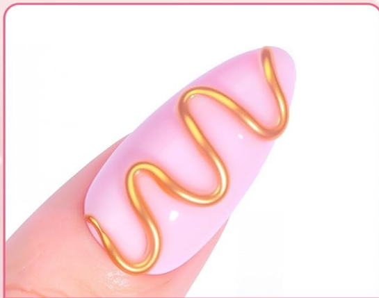
Rub Chrome Nail Powder