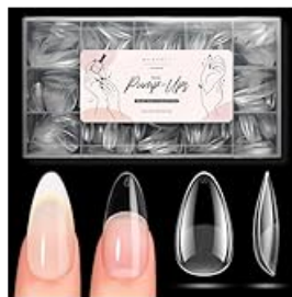
Image 4.2: Additional warm tips for nail preparation and application.