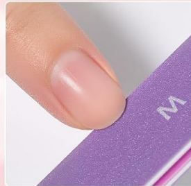
2. File nails