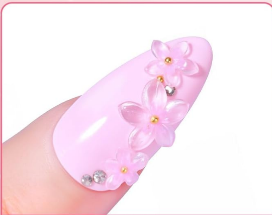
3D Nail Decor Sculpting