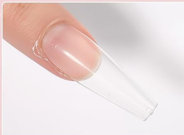
6. Press, adjust the nail glue and fix it (avoid bubbles)