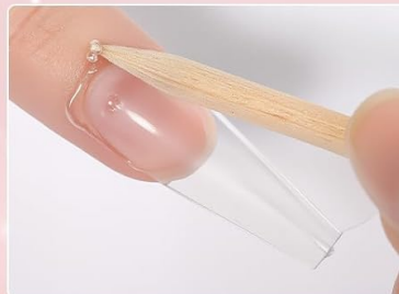
7. Wipe off excess gel