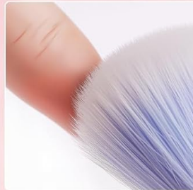
3. Clean nails