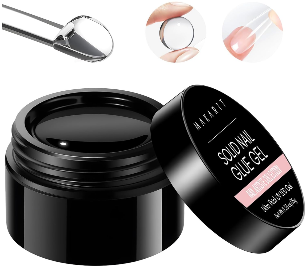
Image 3.1: Makartt Solid Nail Glue Gel product packaging, showing the gel in a jar, a scoop tool, and small examples of its use.

The Makartt Solid Nail Glue Gel is supplied in a 15ML jar. The package typically includes one jar of solid glue gel, a packaging box, and an instruction manual.