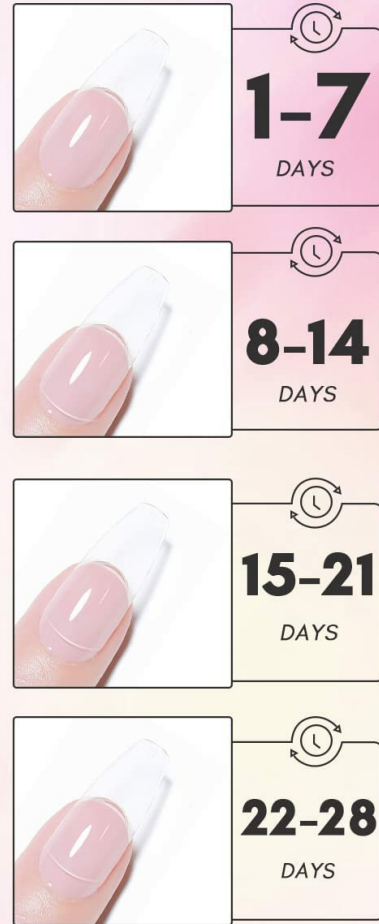
Image 6.1: Expected longevity of nail tips with Makartt Solid Nail Glue Gel.

The solid glue gel has a thick, solid texture, which is its normal state. It is not dried out. If the gel becomes too firm due to cold temperatures, you can briefly soak the jar in warm water (approximately 35°F+) to soften it for easier application. This process will not alter its solid state.