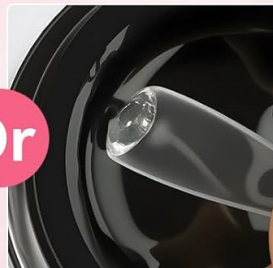
5. Pick up glue directly with nail tip