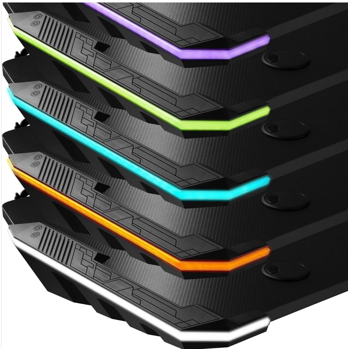
Image: A close-up view of the TecTake Sit-Stand Gaming Desk's LED lighting strip, showcasing a range of vibrant color options available.