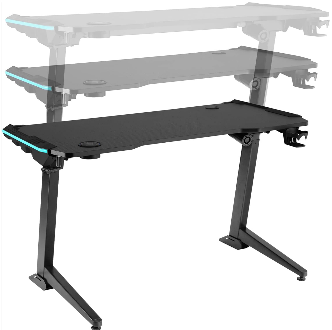
Image: The TecTake Sit-Stand Gaming Desk illustrating its height adjustment range, from its lowest to highest position, demonstrating the electric lift mechanism.