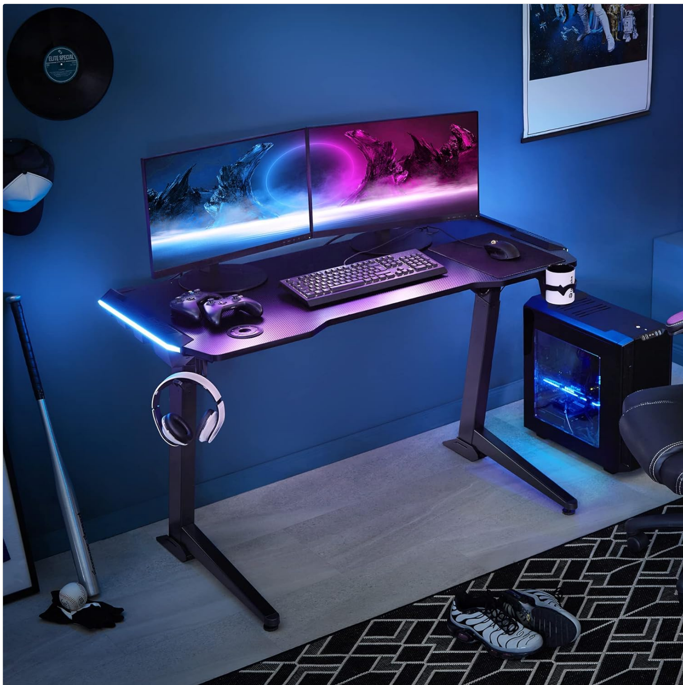
Image: The TecTake Sit-Stand Gaming Desk with LED, fully set up with two monitors, keyboard, mouse, and gaming accessories, showcasing the blue LED lighting along the desk edge.