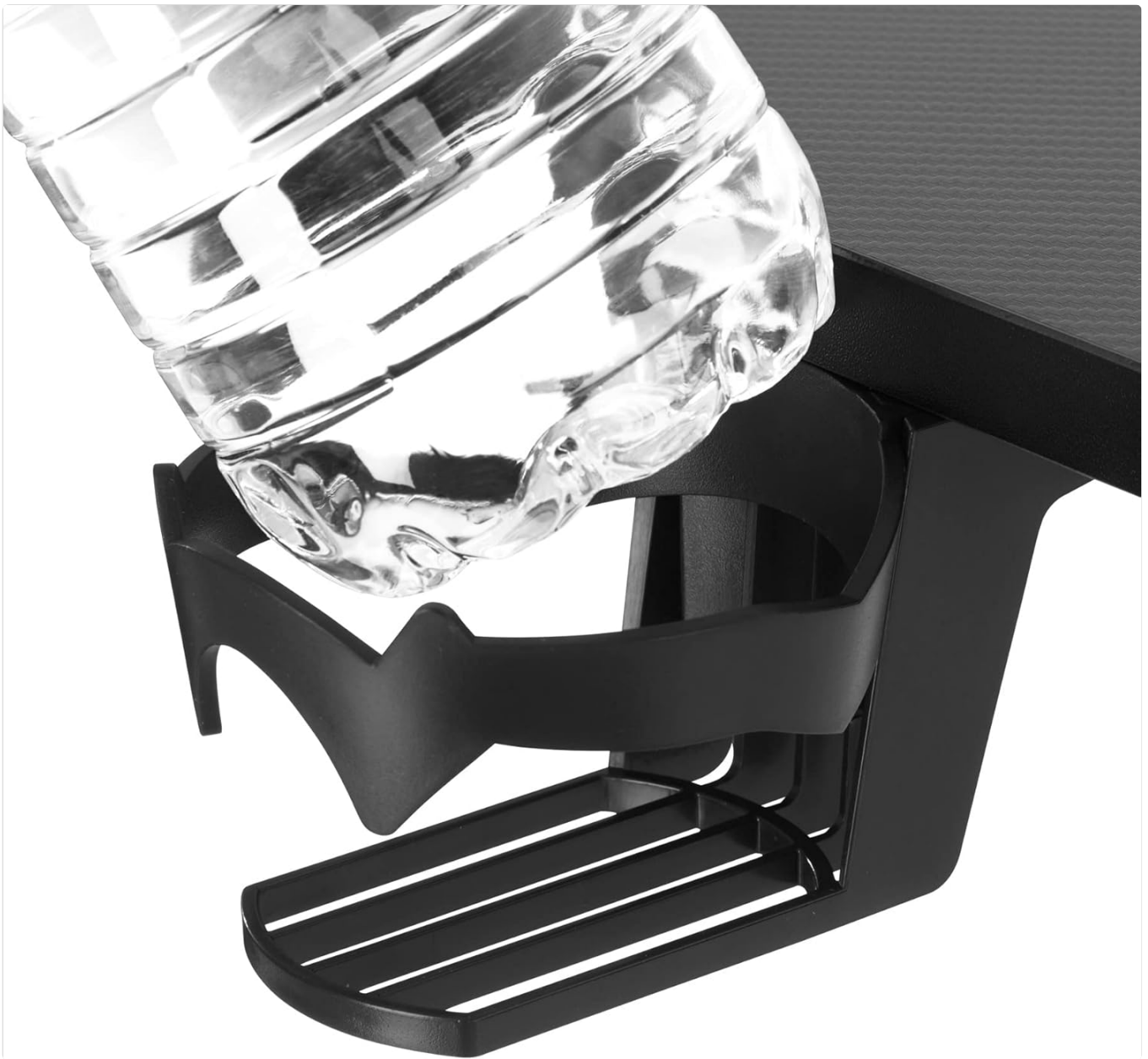
Image: A close-up of the cup holder integrated into the TecTake Sit-Stand Gaming Desk, securely holding a water bottle.