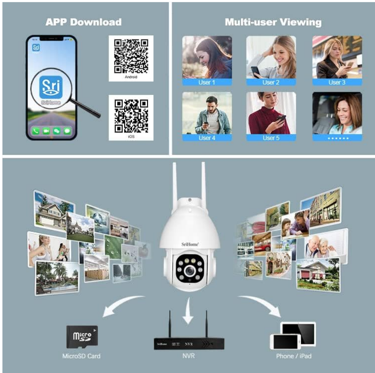
Image 4: Instructions for downloading the SriHome app and an overview of multi-user viewing and storage options.