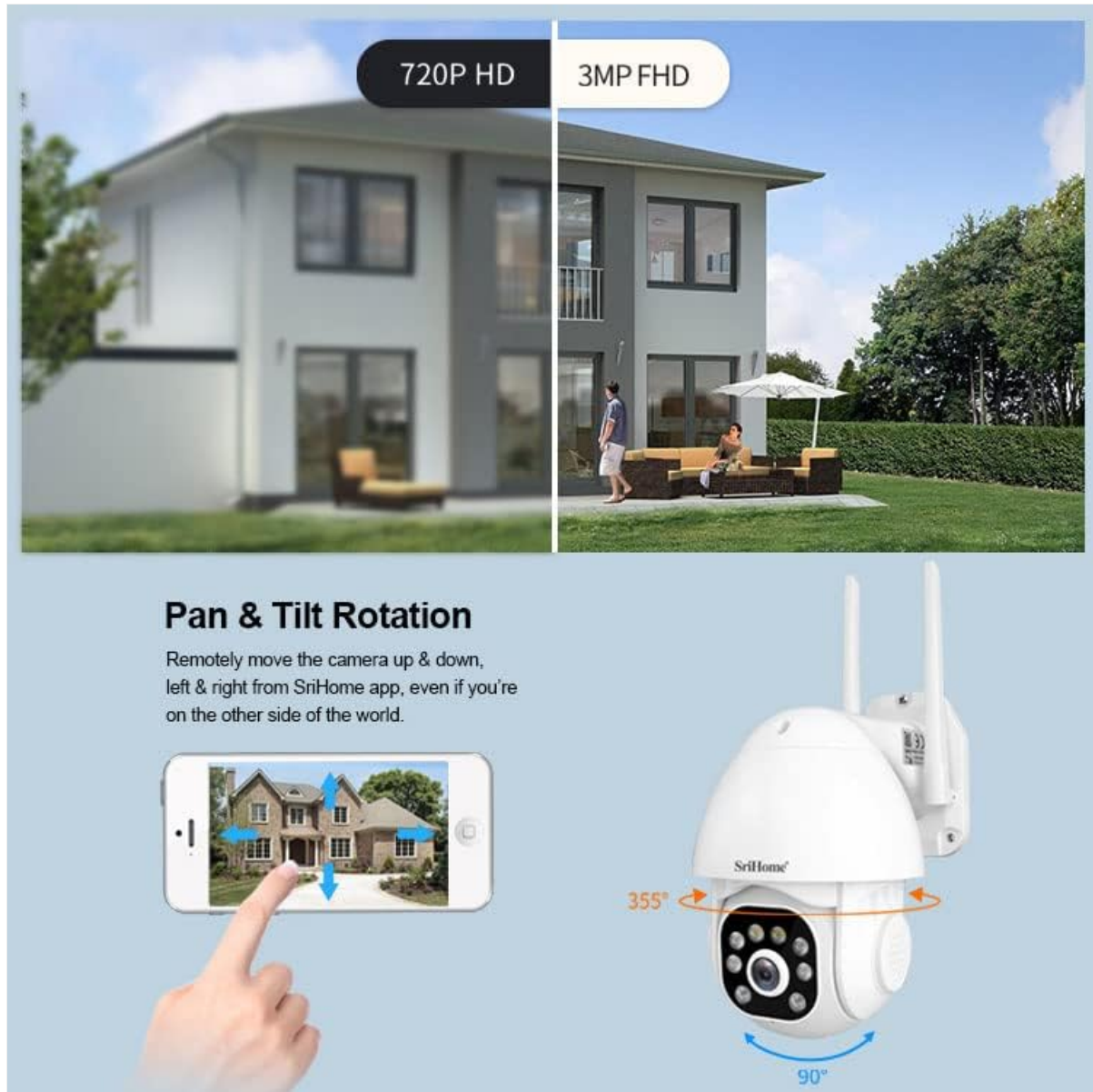
Image 5: Remote control of camera pan and tilt functions via the SriHome app.

Control the camera's viewing angle remotely through the SriHome app. The camera offers 355° horizontal pan and 90° vertical tilt for comprehensive coverage.