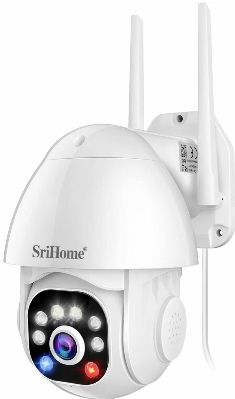
Image 1: SriHome 3MP IP Camera highlighting key features like 3MP resolution, starlight lens, two-way audio, waterproof design, human detection, motion detection, ONVIF support, color night vision, MicroSD card slot, and H.265 compression.