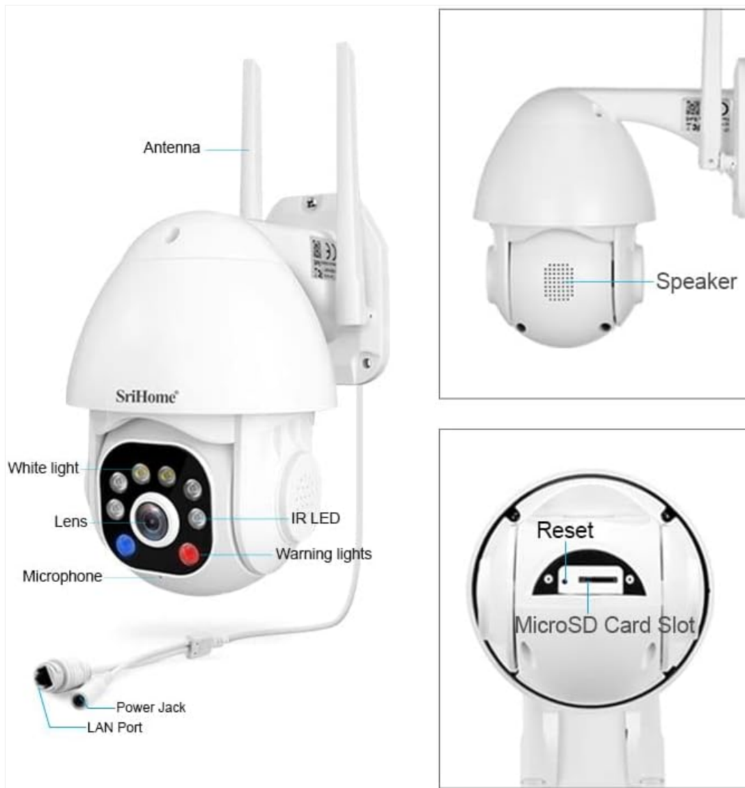
Image 3: Detailed diagram illustrating the various parts and ports of the SriHome IP Camera.