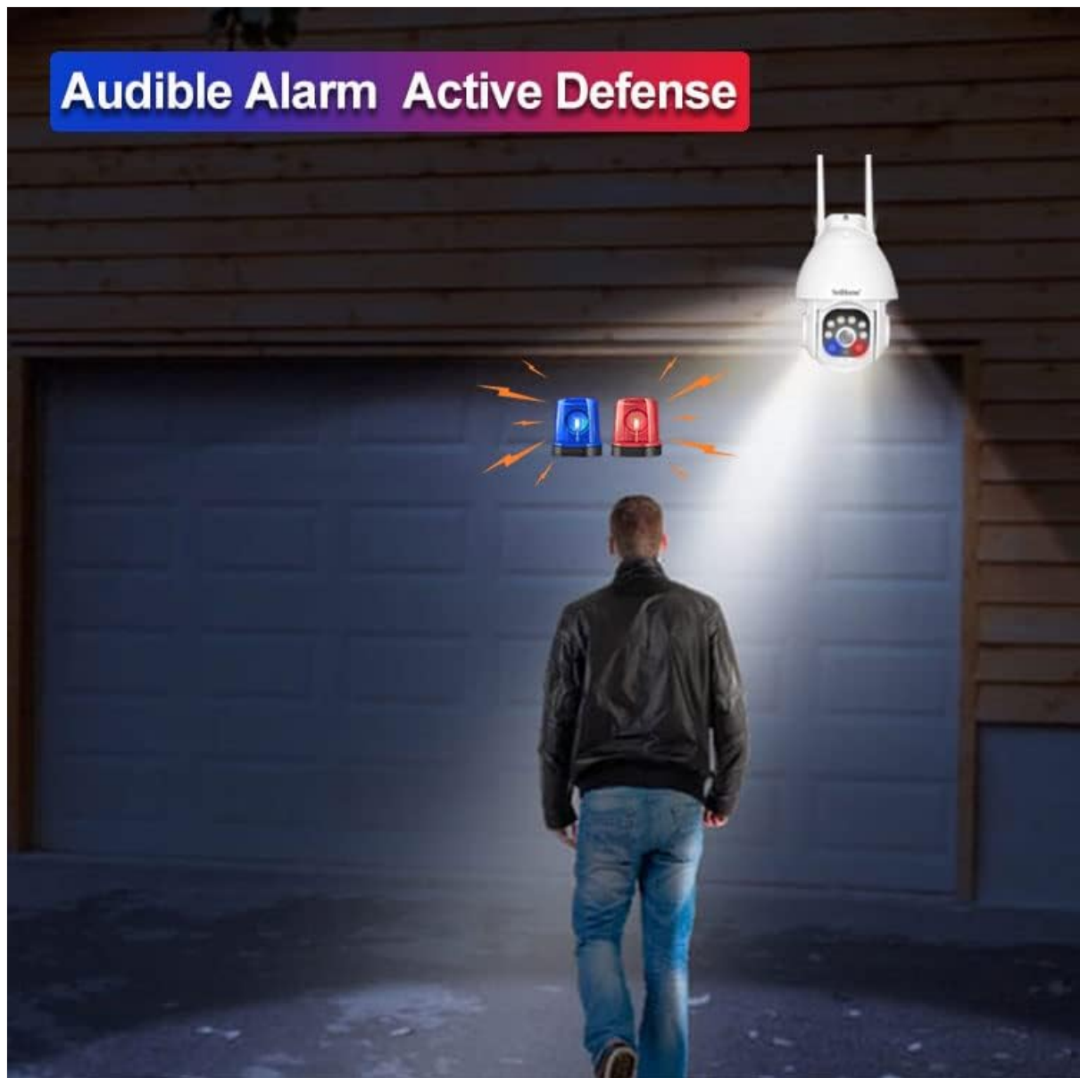
Image 8: The camera activating its audible alarm and flashing lights to deter a person.