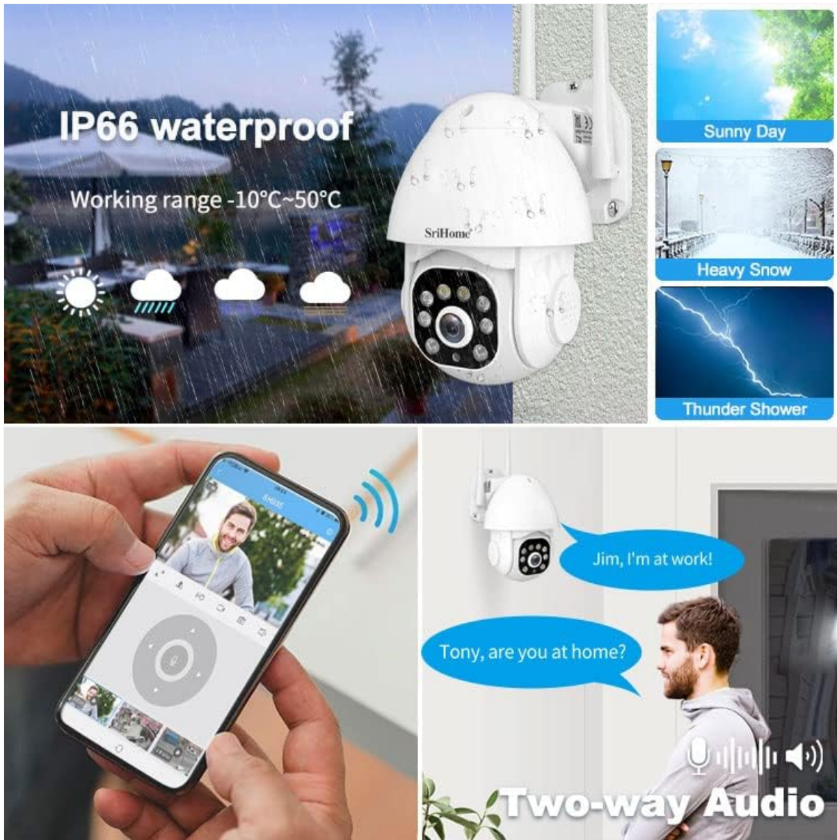
Image 7: The camera's IP66 waterproof design and two-way audio communication capability.