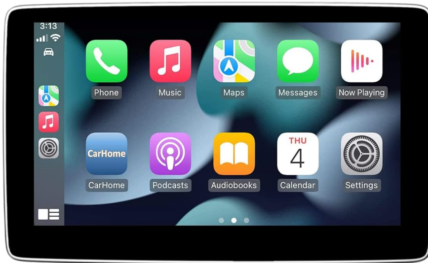
Image: DriveLink screen displaying the Apple CarPlay interface with a Siri voice control icon and examples of voice commands.