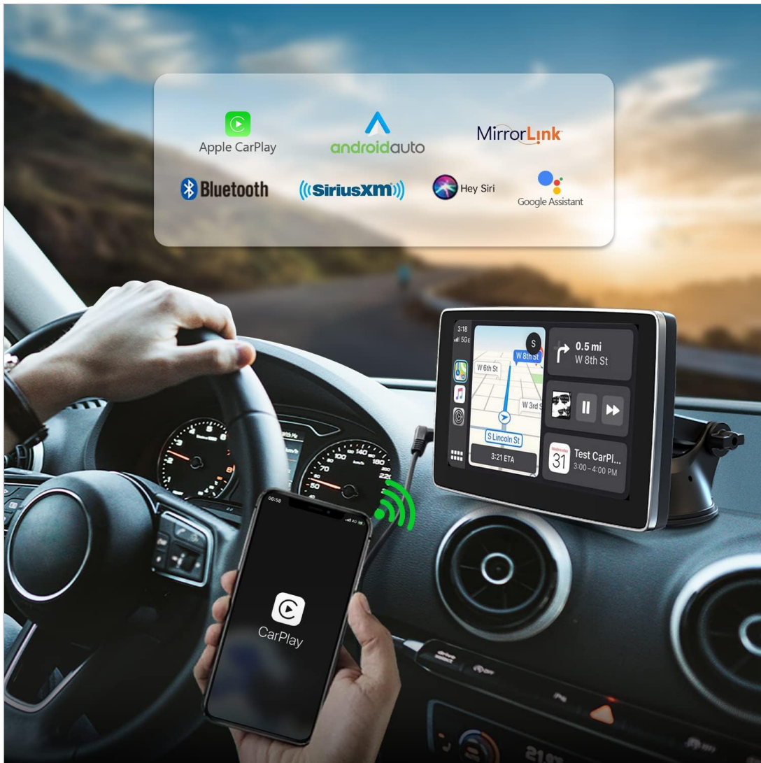
Image: A smartphone connected to the DriveLink screen, displaying a navigation map via Apple CarPlay.