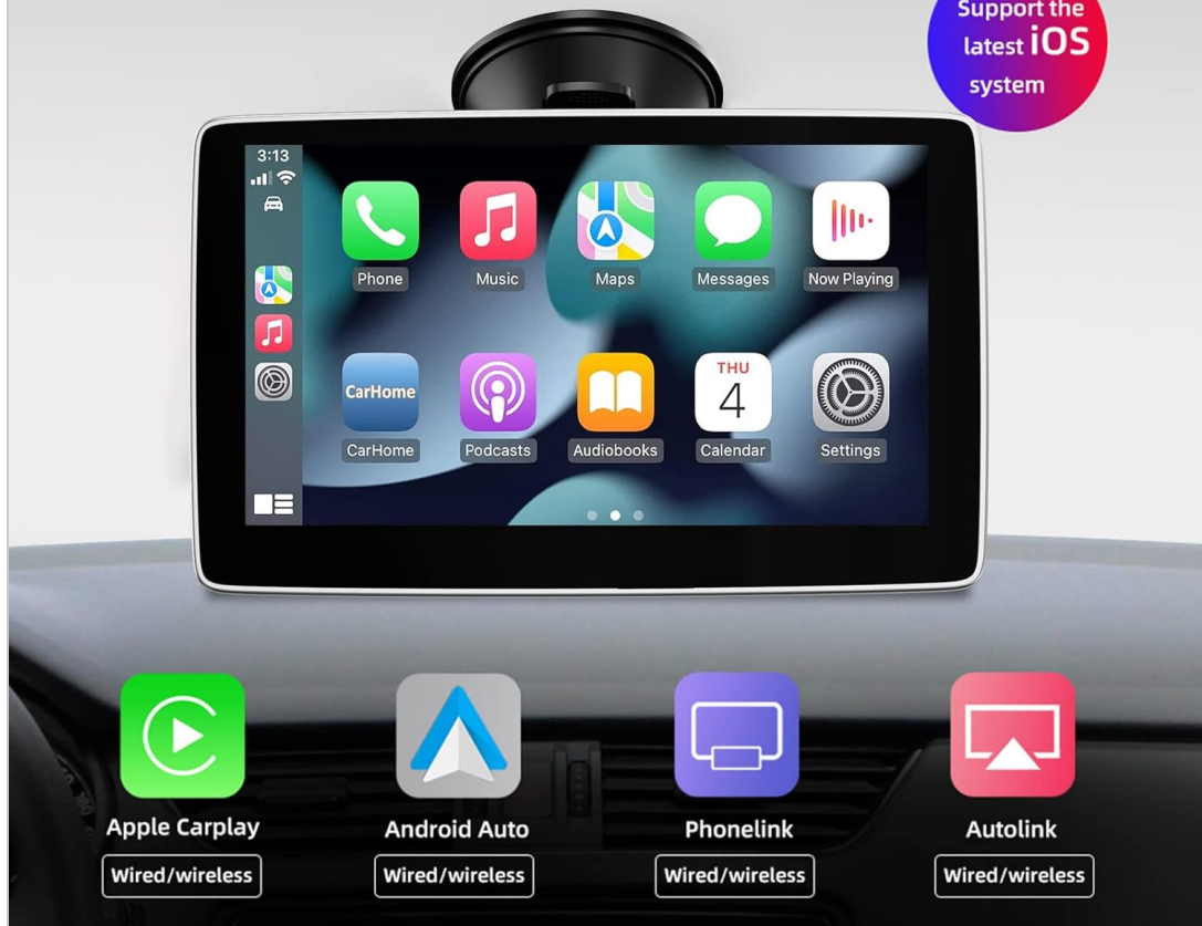
Image: DriveLink screen displaying options for Android Auto, Apple CarPlay, FM Transmitter, Bluetooth Music, and Bluetooth Phone.