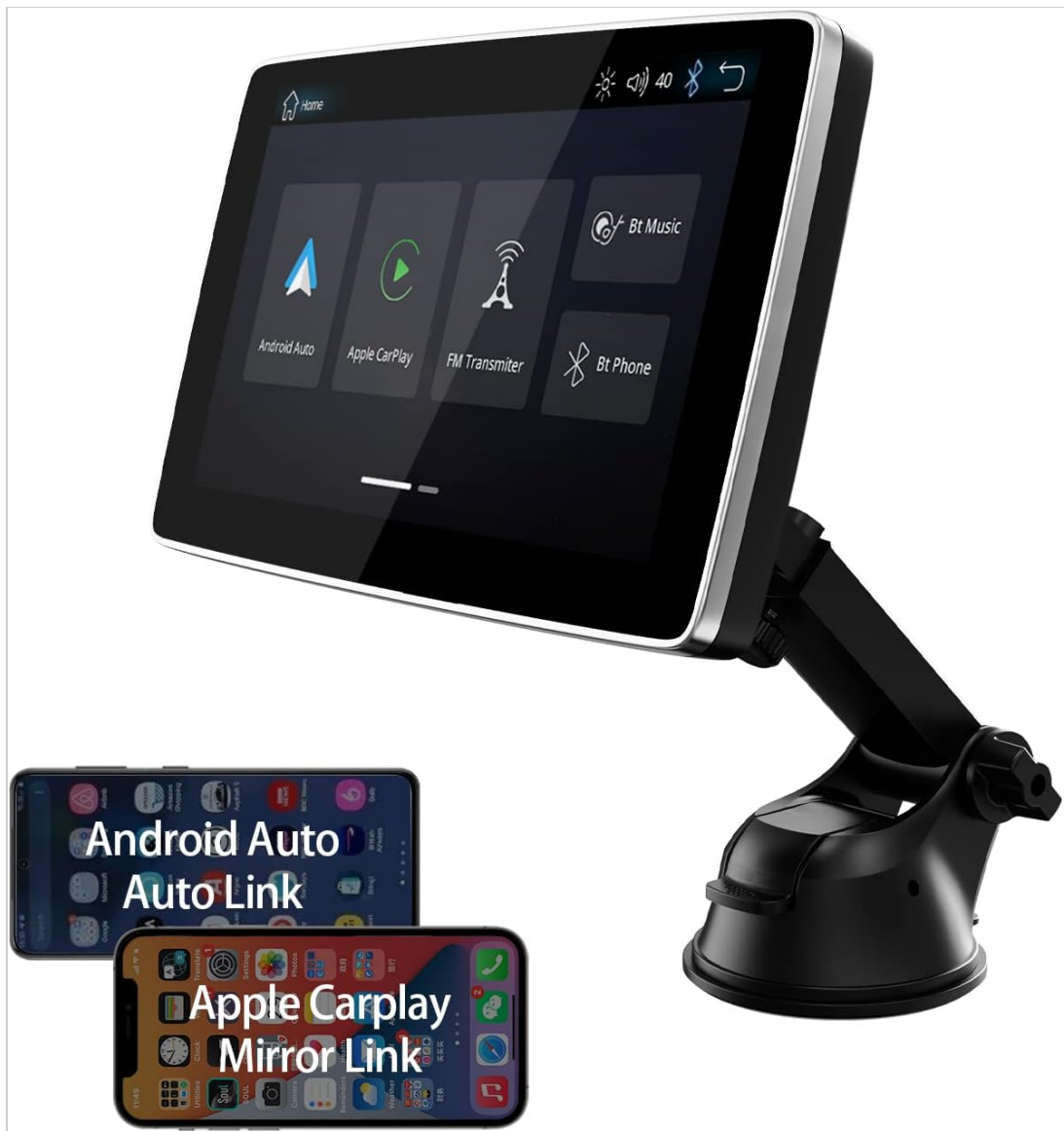
Image: DriveLink screen displaying its main interface with options for Android Auto, Apple CarPlay, FM Transmitter, and Bluetooth, alongside two smartphones showing Auto Link and Mirror Link features.