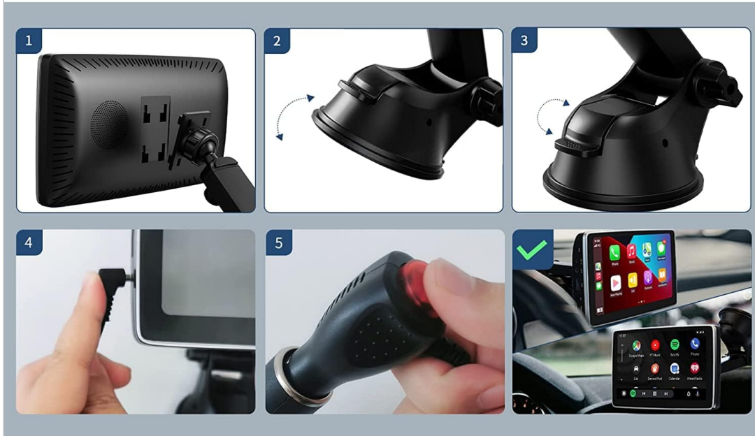
Image: Step-by-step guide showing how to attach the screen to the suction cup mount and secure it to a car dashboard.