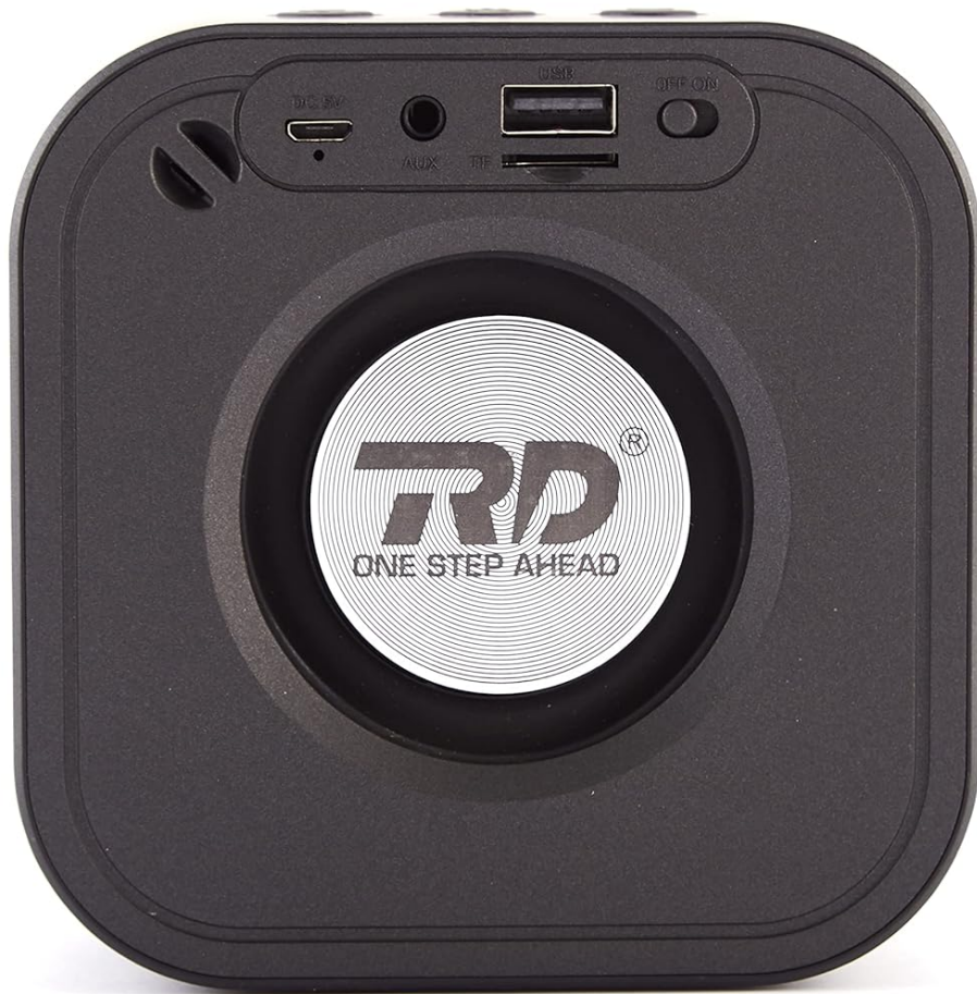
Image: Rear panel of the RD B-42 speaker. Visible ports include a micro USB DC 5V charging input, a 3.5mm AUX input, a TF (MicroSD) card slot, a standard USB-A port, and an On/Off switch.