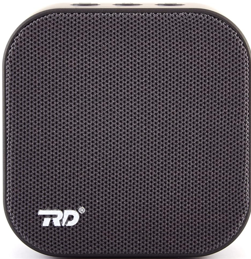
Image: Front view of the RD B-42 Wireless Bluetooth Speaker, featuring a dark grey speaker grille and the RD logo prominently displayed in white.