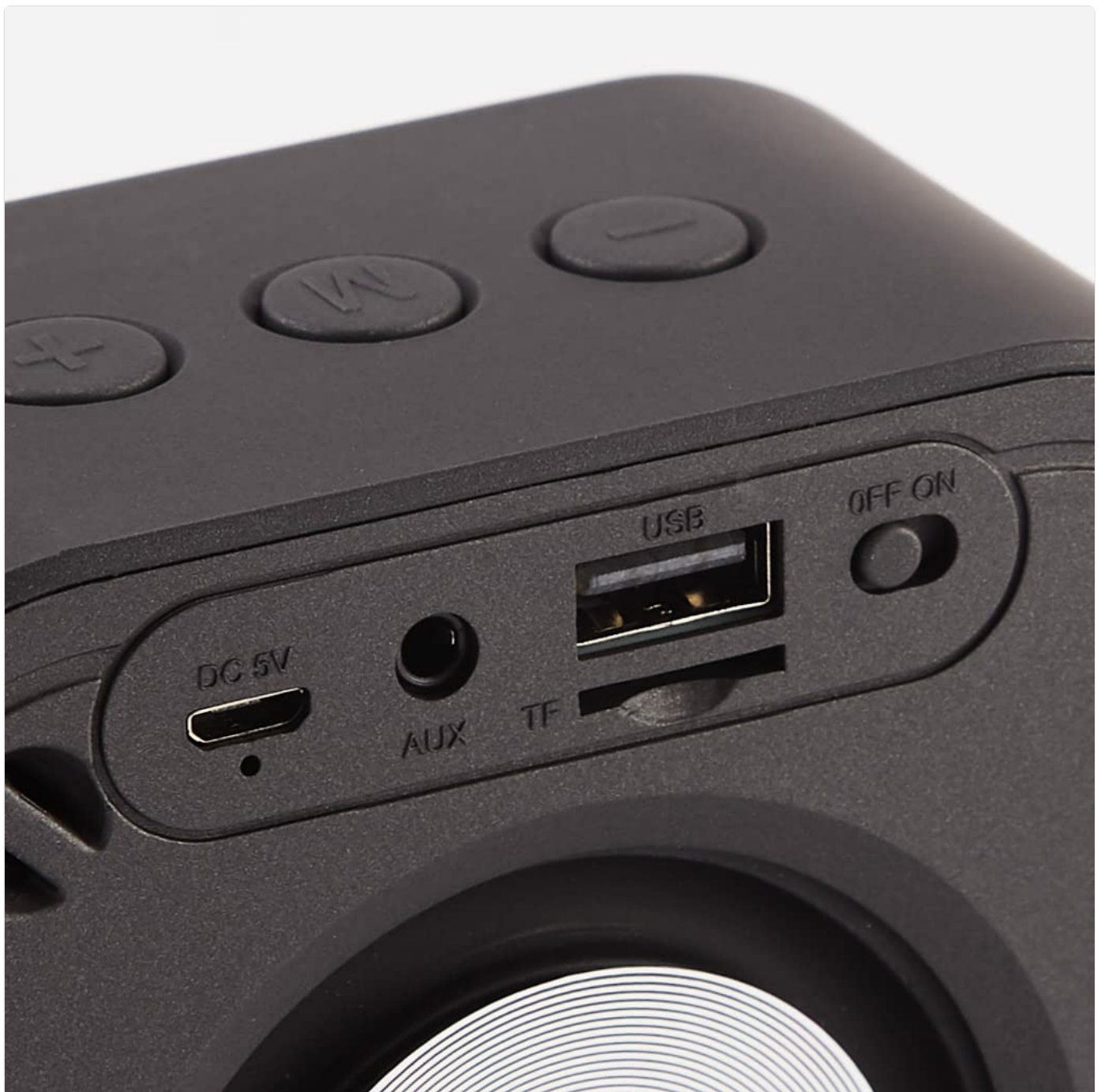
Image: A close-up shot of the speaker's connectivity panel, highlighting the DC 5V charging port, AUX input, TF card slot, and USB port for various audio input options.