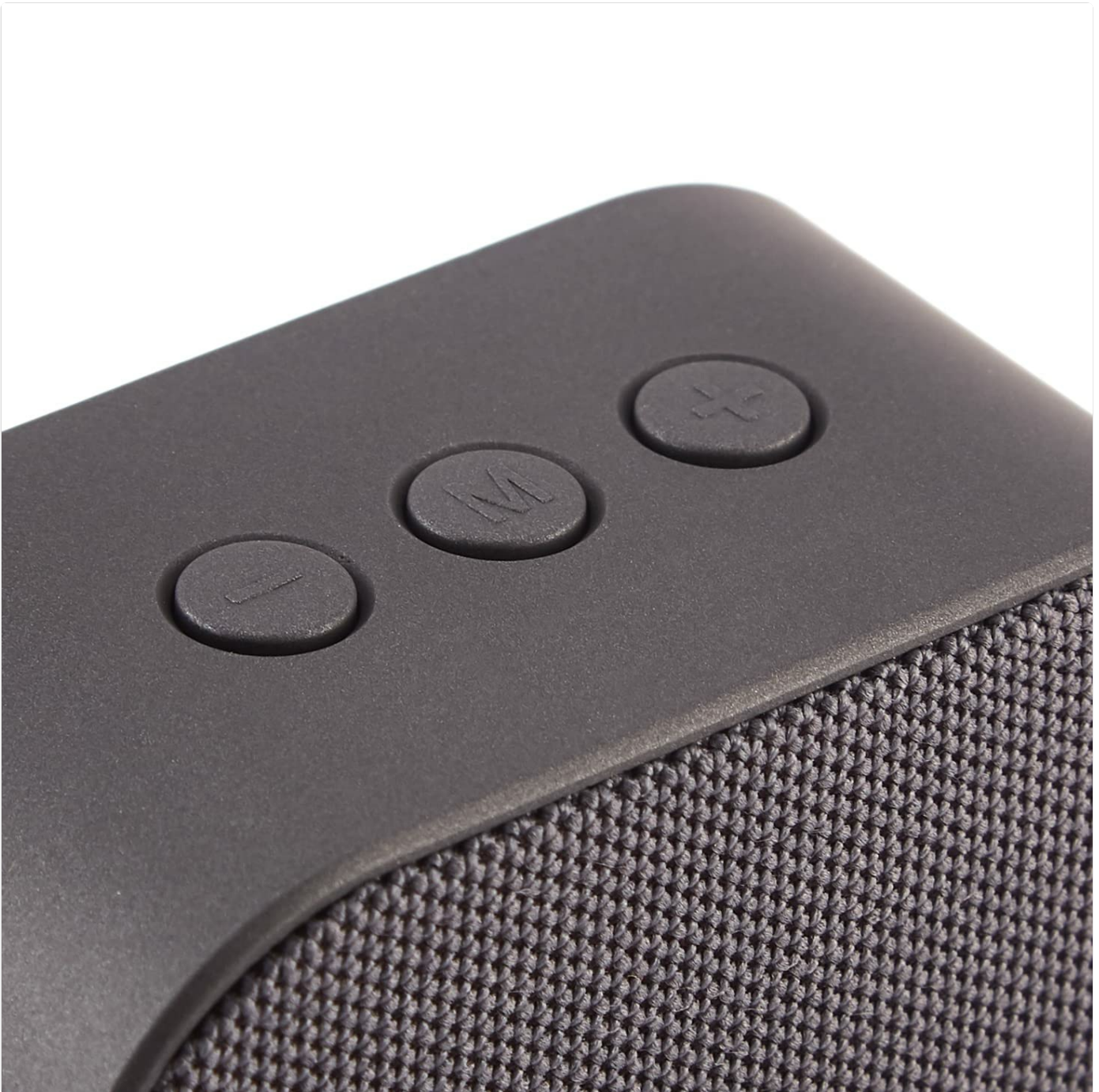
Image: Top surface of the RD B-42 speaker, displaying three circular control buttons. From left to right, these are typically for Volume Down/Previous Track, Mode selection, and Volume Up/Next Track.