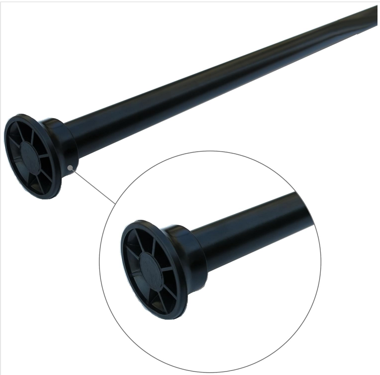
Figure 2: Detail of the rod's end cap, designed for secure, non-slip contact with wall surfaces.