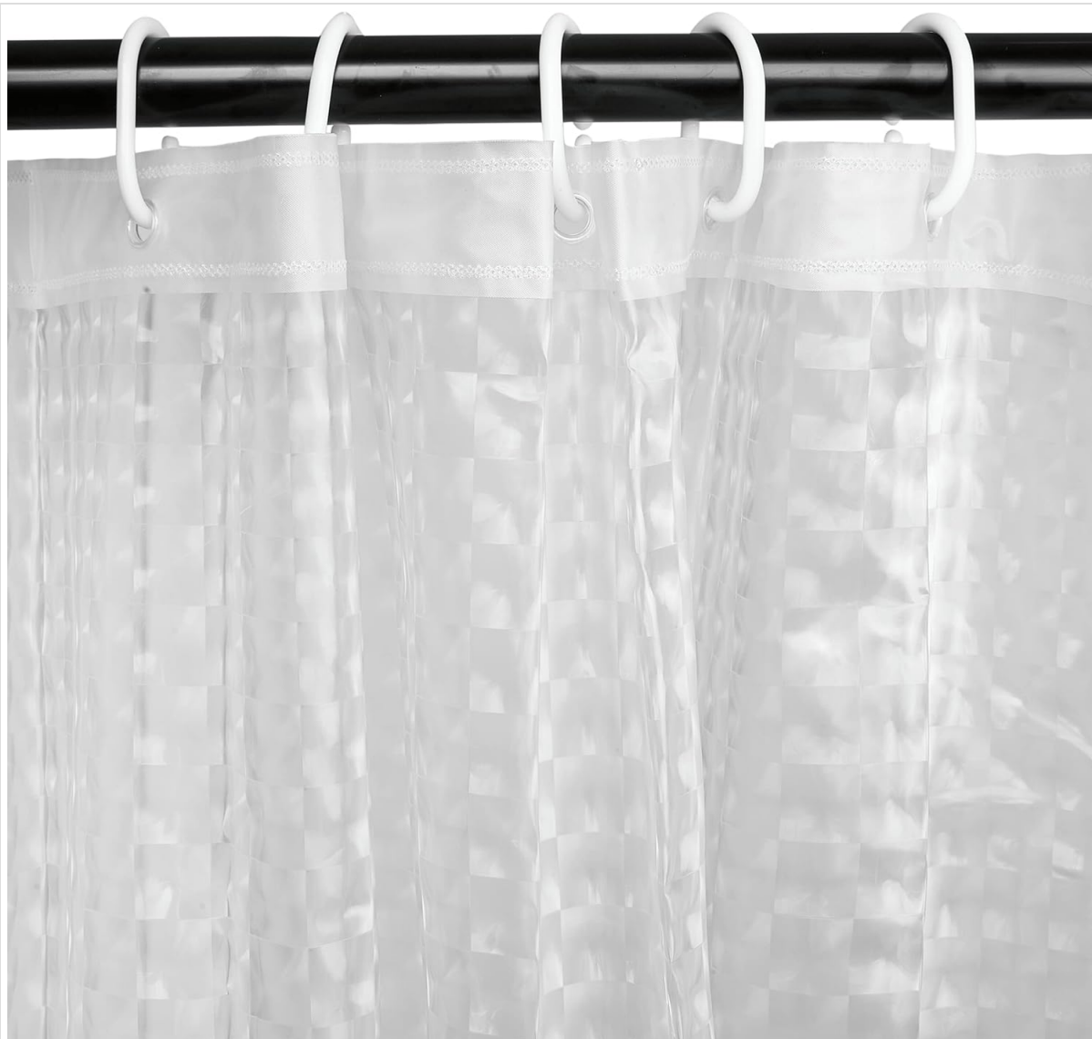
Figure 3: A shower curtain properly hung on the rod, demonstrating typical use.