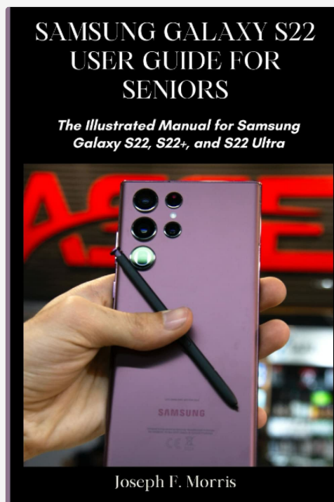
Image Description: The front cover of the "Samsung Galaxy S22 User Guide for Seniors" book. The title is prominently displayed at the top. Below the title, a hand holds a purple Samsung Galaxy S22 series phone with its S Pen stylus. The author's name, Joseph