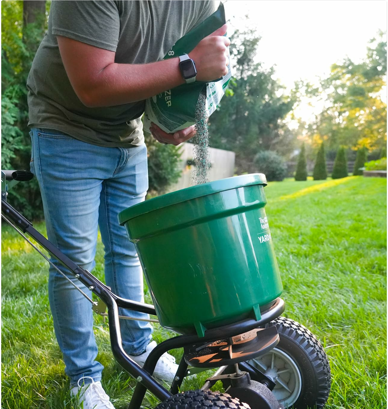
Image: A person using a push spreader to apply the granular fertilizer to a lawn.