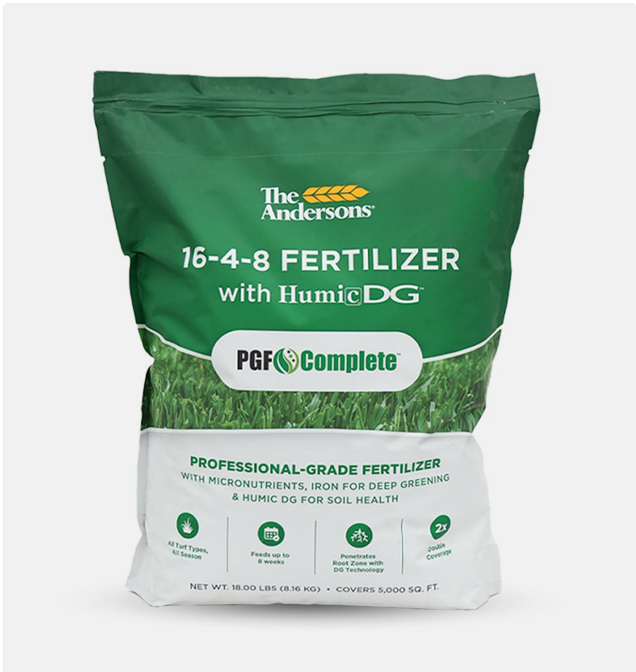
Image: The Andersons Professional PGF Complete 16-4-8 Fertilizer with Humic DG product bag.