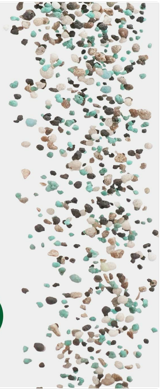
Image: Infographic highlighting the benefits of professional-grade fertilizer, including versatility, rapid green-up, and controlled-release nitrogen.