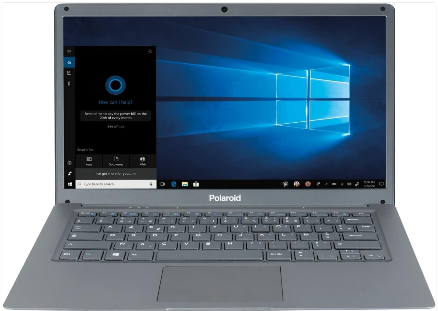
Image: The Polaroid 14.1-inch Pro Series Laptop with its screen on, showing the Windows 10 operating system interface.