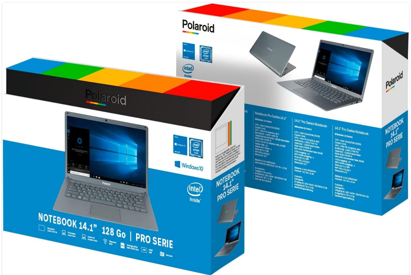
Image: The retail packaging for the Polaroid 14.1-inch Pro Series Laptop, showing the laptop and its key features on the box.