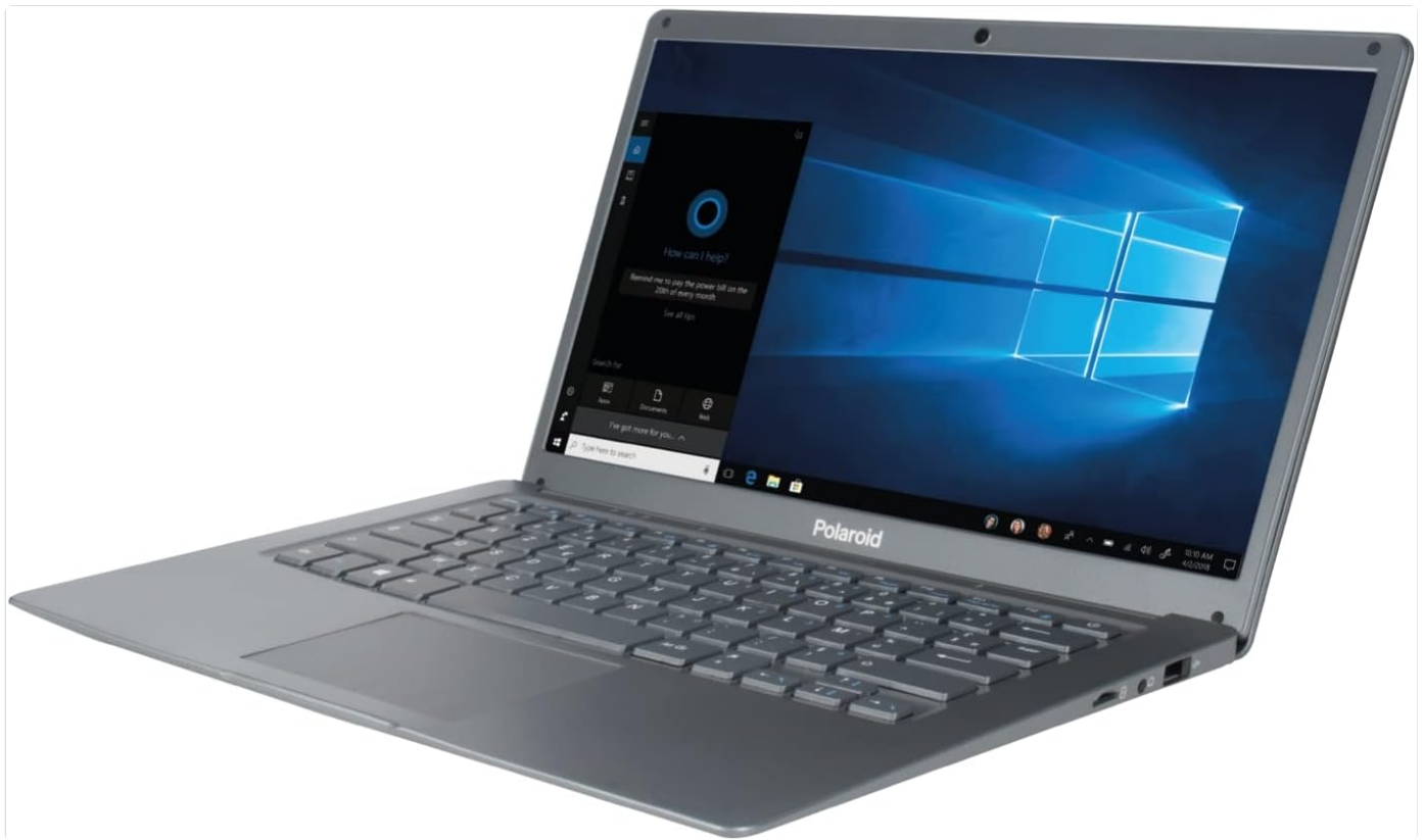
Image: An angled view of the open laptop, highlighting the keyboard and touchpad area.