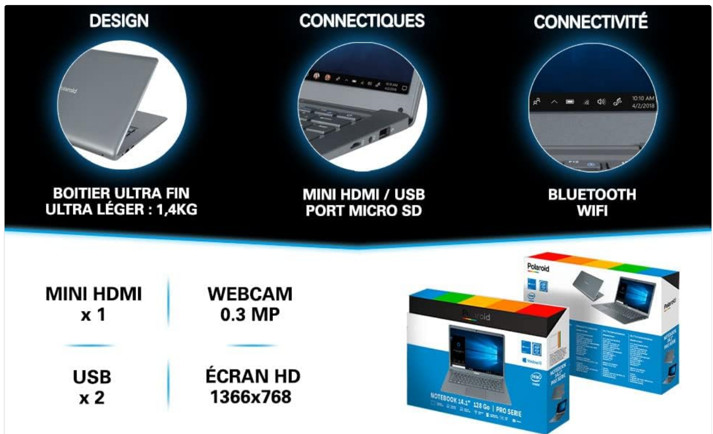
Image: A visual representation of the laptop's connectivity options, including Mini HDMI, USB ports, Bluetooth, and Wi-Fi indicators.