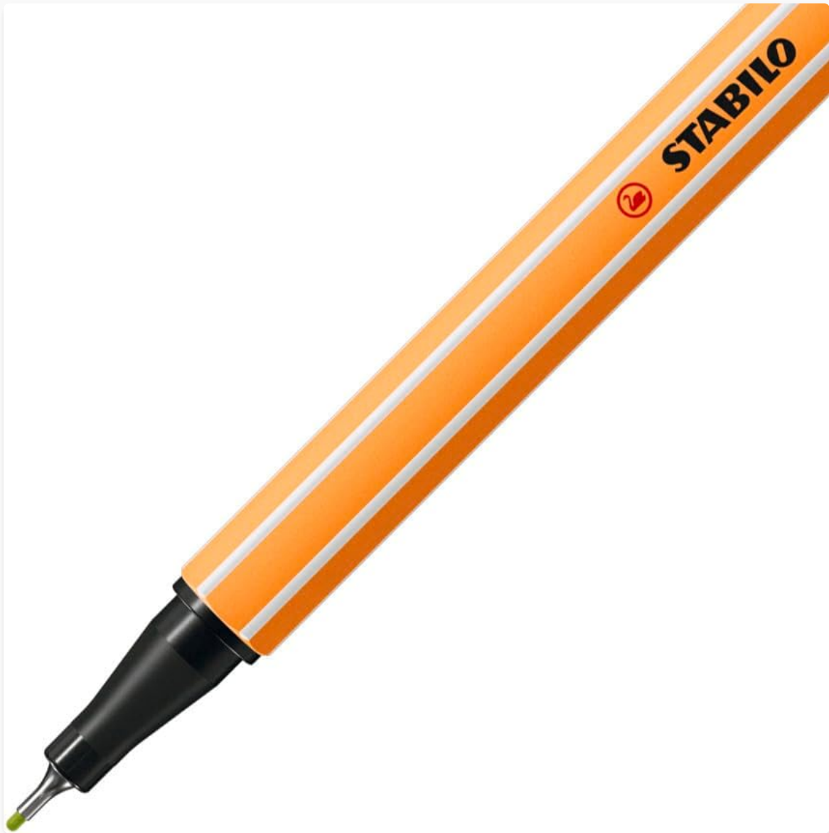
Image: A detailed view of the metal-cased 0.4mm tip of the STABILO Fineliner point 88, highlighting its precision.