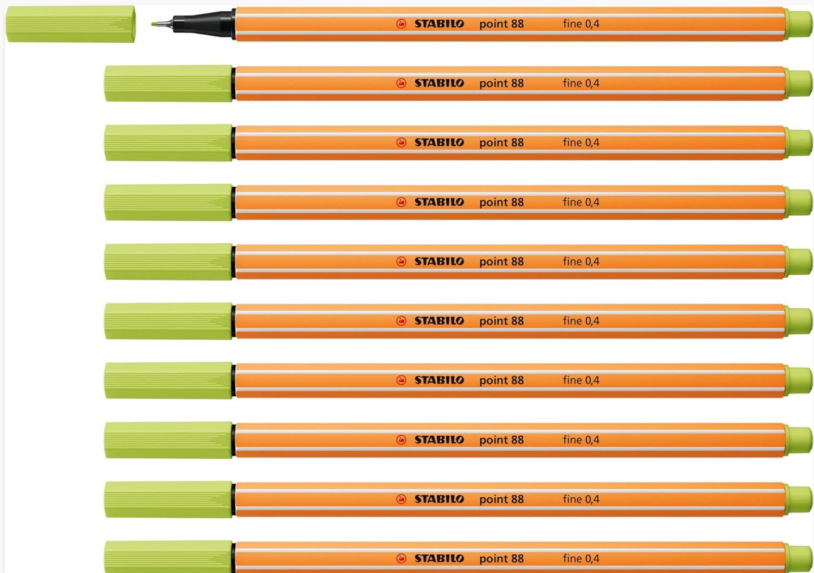
Image: A pack of 10 STABILO Fineliner point 88 pens, showcasing their vibrant lime green color and iconic design.

The STABILO Fineliner point 88 is a versatile and reliable fineliner pen, ideal for writing, drawing, sketching, and structuring texts. Its distinctive hexagonal barrel and metal-cased tip ensure durability and precision.