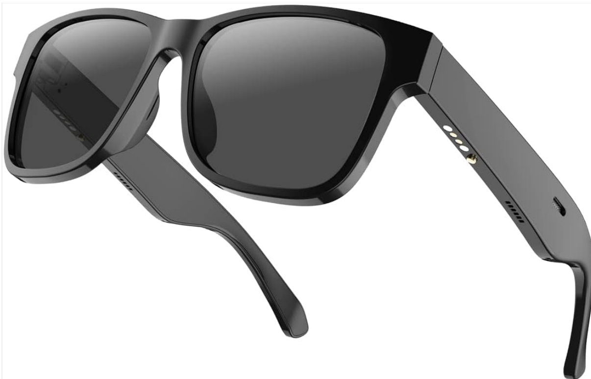
Figure 1: RUIMEN Smart Sunglasses

The RUIMEN Smart Sunglasses combine stylish eyewear with advanced audio technology, offering an open-ear listening experience. Designed for both men and women, these smart glasses allow you to listen to music and make hands-free calls while remaining aware of your surroundings. They feature anti-UV lenses for eye protection and are built with a lightweight, IPX4 waterproof design for durability.