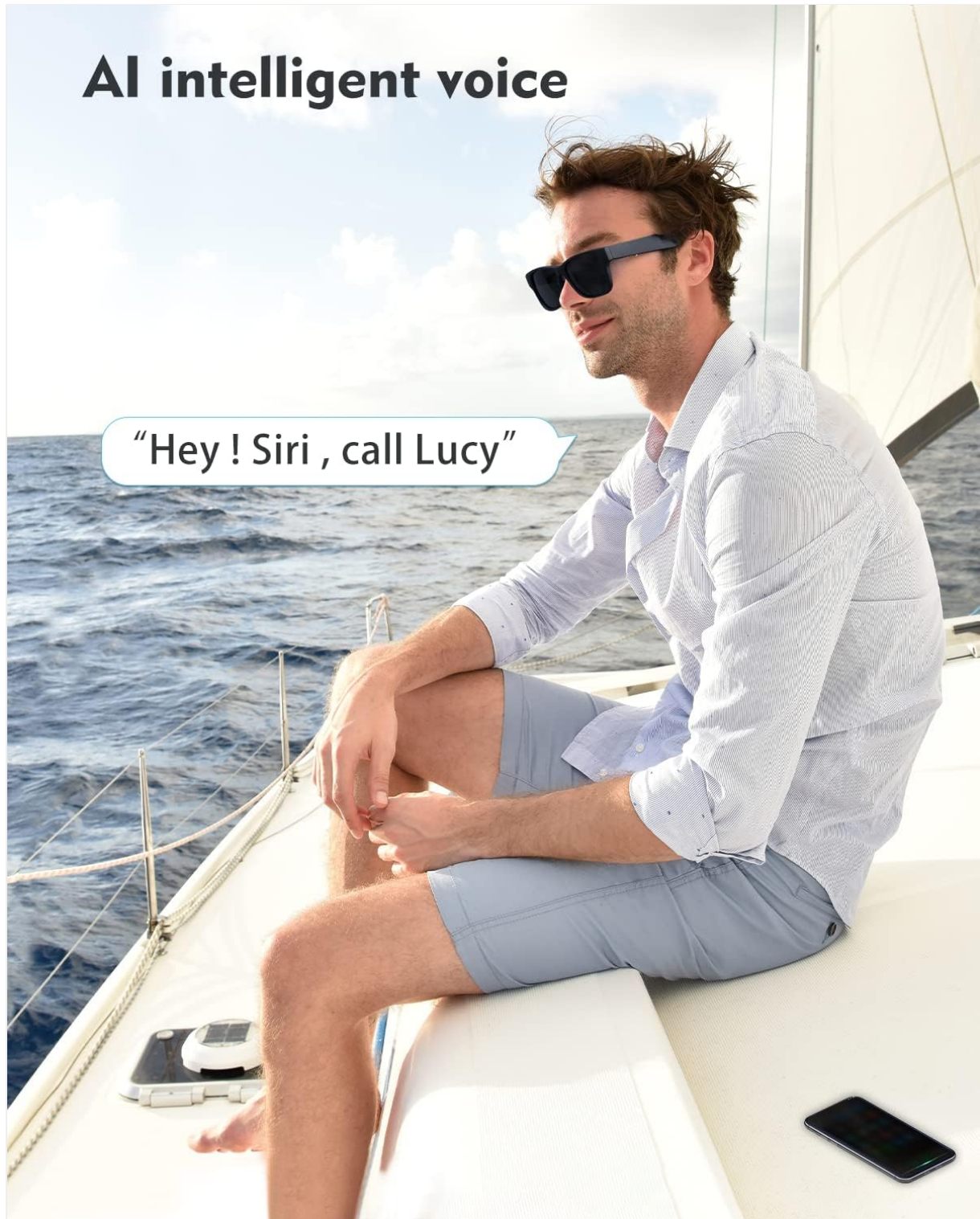
Figure 4: Voice Control in Use