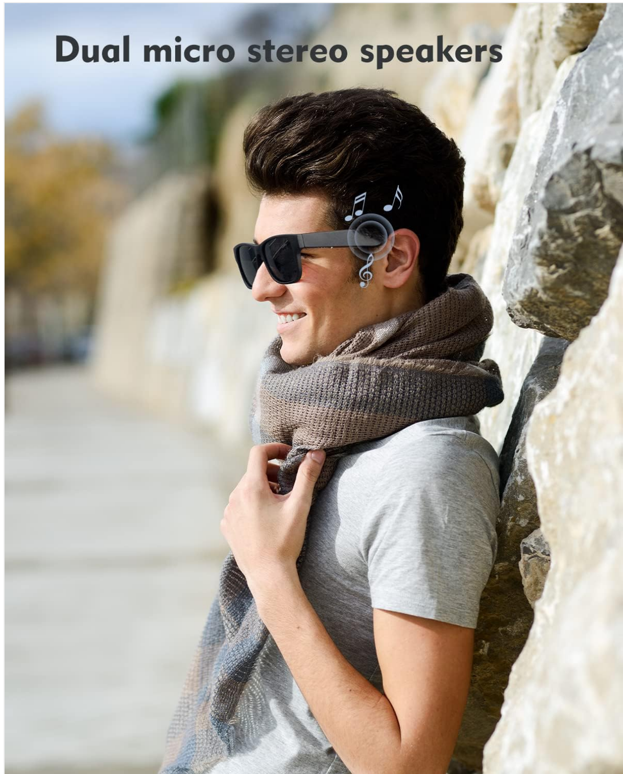
Figure 2: Open-Ear Speaker Placement

providing a high-quality stereo experience while minimizing sound leakage to protect your privacy.