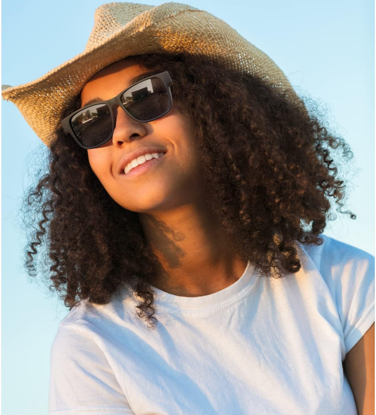
Figure 6: UV Protection