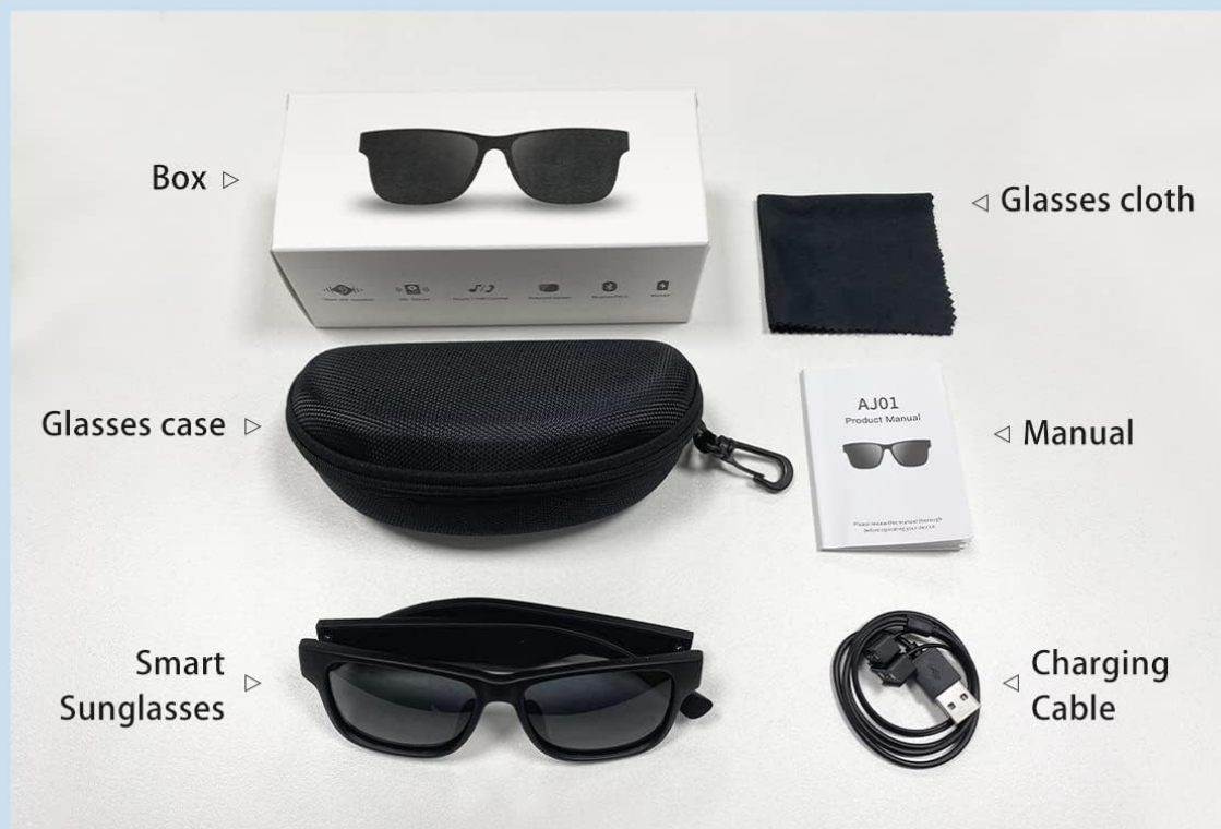
Figure 8: Package Contents