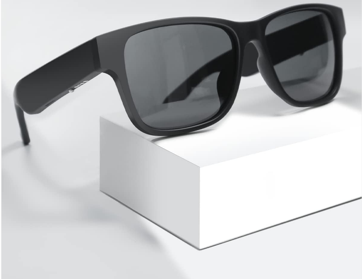
Figure 5: Extended Battery Performance