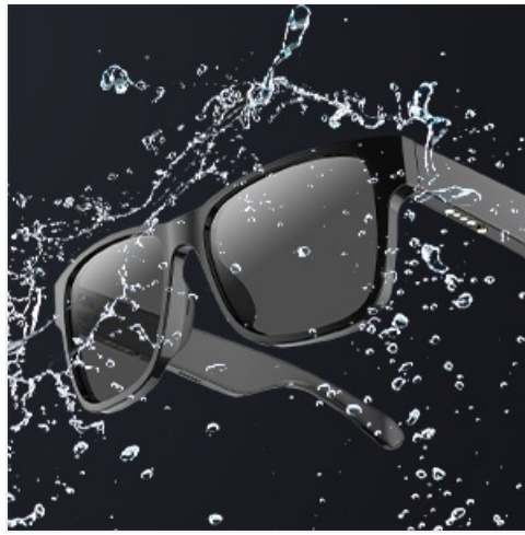
Figure 3: Bluetooth 5.0 Technology