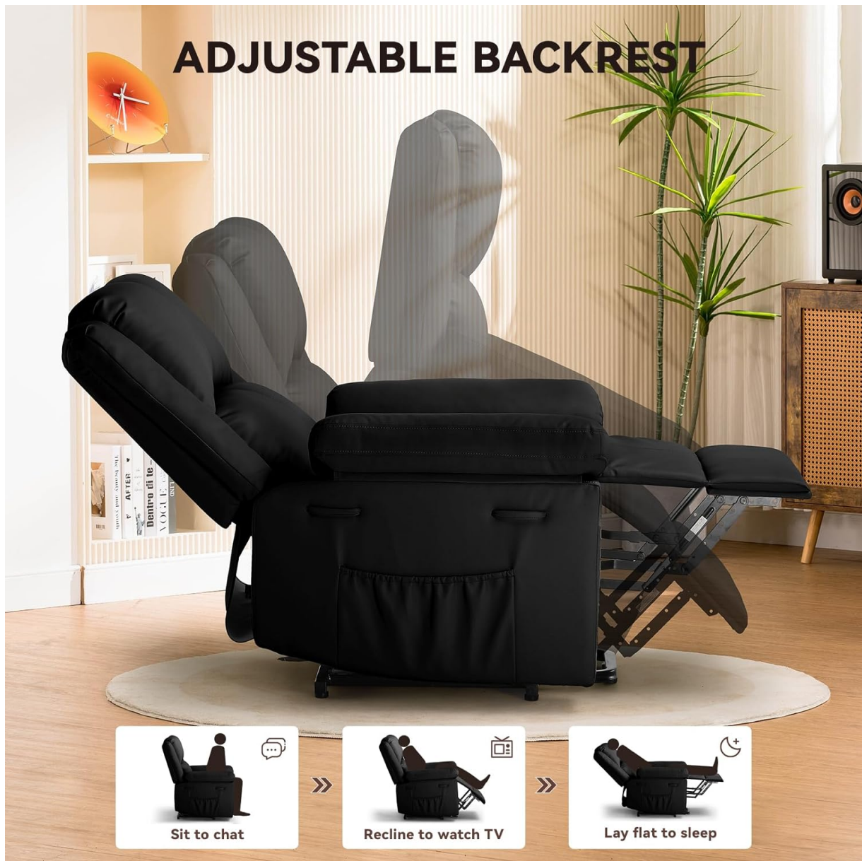
Image 4.2: An image demonstrating the adjustable backrest, showing three positions: upright for chatting, reclined for watching TV, and fully flat for sleeping.