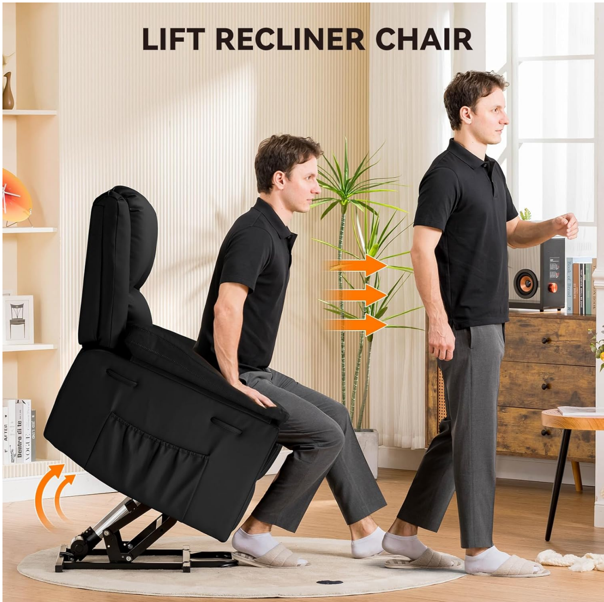
Image 4.1: A sequence showing a person using the power lift function, transitioning from a seated position to a standing position with the chair gently elevating.