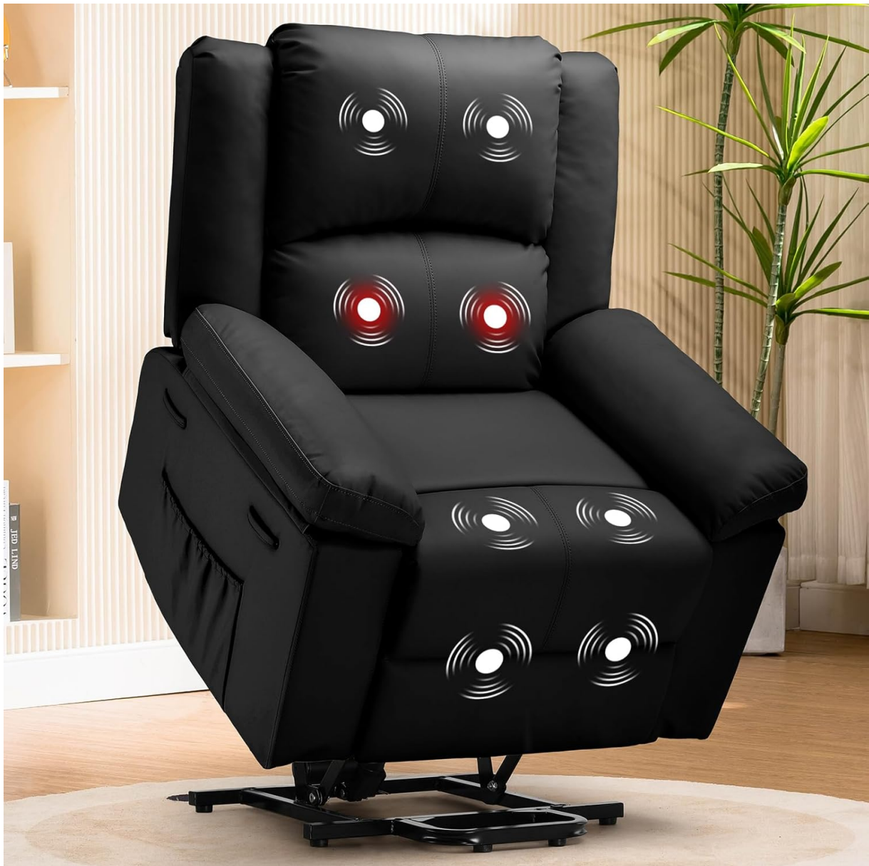
Image 1.1: COMHOMA Power Lift Recliner in black, featuring highlighted areas indicating the massage and heating functions on the backrest, lumbar, and leg rest.