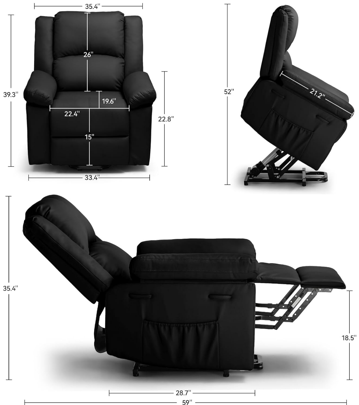
Image 7.1: A technical diagram illustrating the various dimensions of the recliner, including height, width, and depth in both upright and reclined positions.