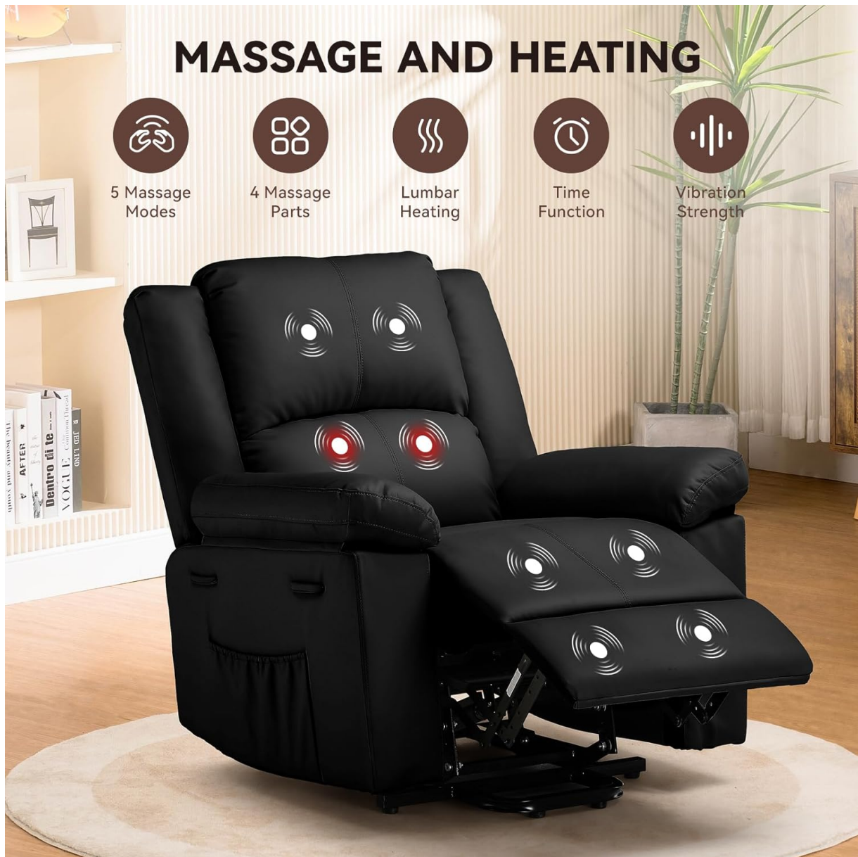
Image 4.3: This graphic highlights the key features of the recliner's massage and heating system, including 5 massage modes, 4 massage parts, lumbar heating, time function, and vibration strength.