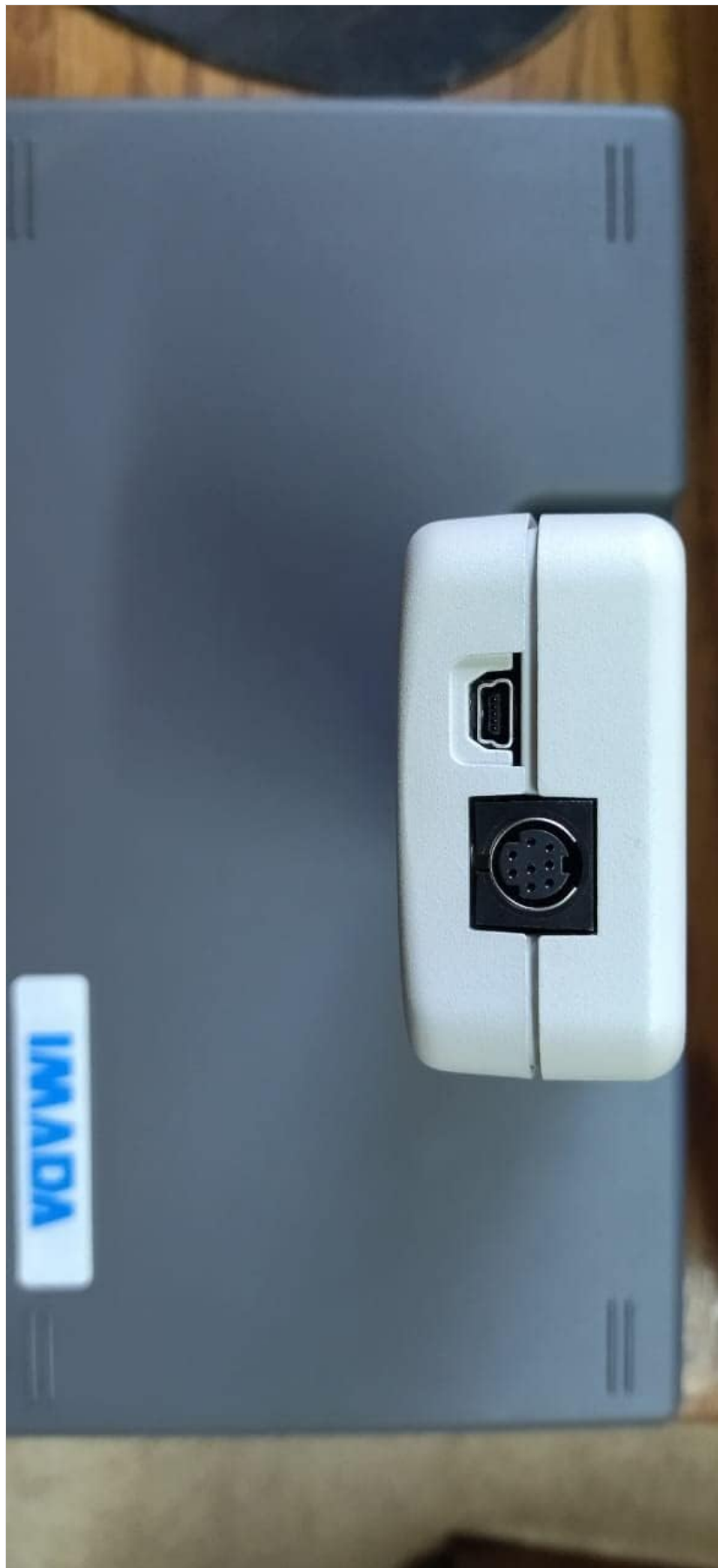
Image: A close-up view of the side of the IMADA DSV-1000N, highlighting the mini-USB port for charging/data connection and a multi-pin circular connector, likely for advanced data output or external device integration.