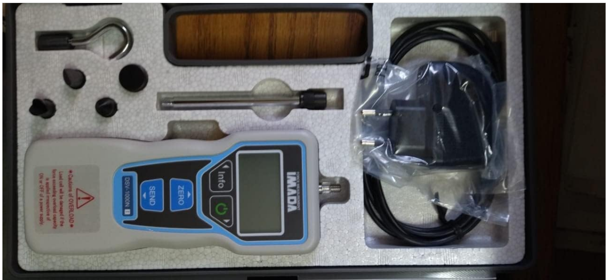
Image: The IMADA DSV-1000N Digital Force Gauge, along with its various attachments, power adapter, and instruction manual, neatly organized within its protective carrying case.