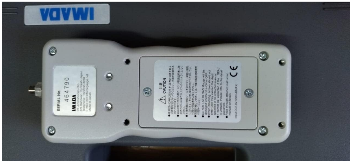
Image: The rear casing of the IMADA DSV-1000N, displaying the serial number label, manufacturer details, and caution labels regarding proper usage and input power specifications (DC5.0V 500mA MAX).