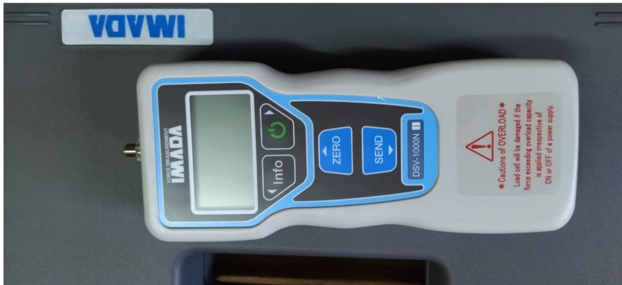
Image: The front panel of the IMADA DSV-1000N Digital Force Gauge, showing its digital display, power button, ZERO button, SEND button, and INFO button, all clearly labeled for user interaction.