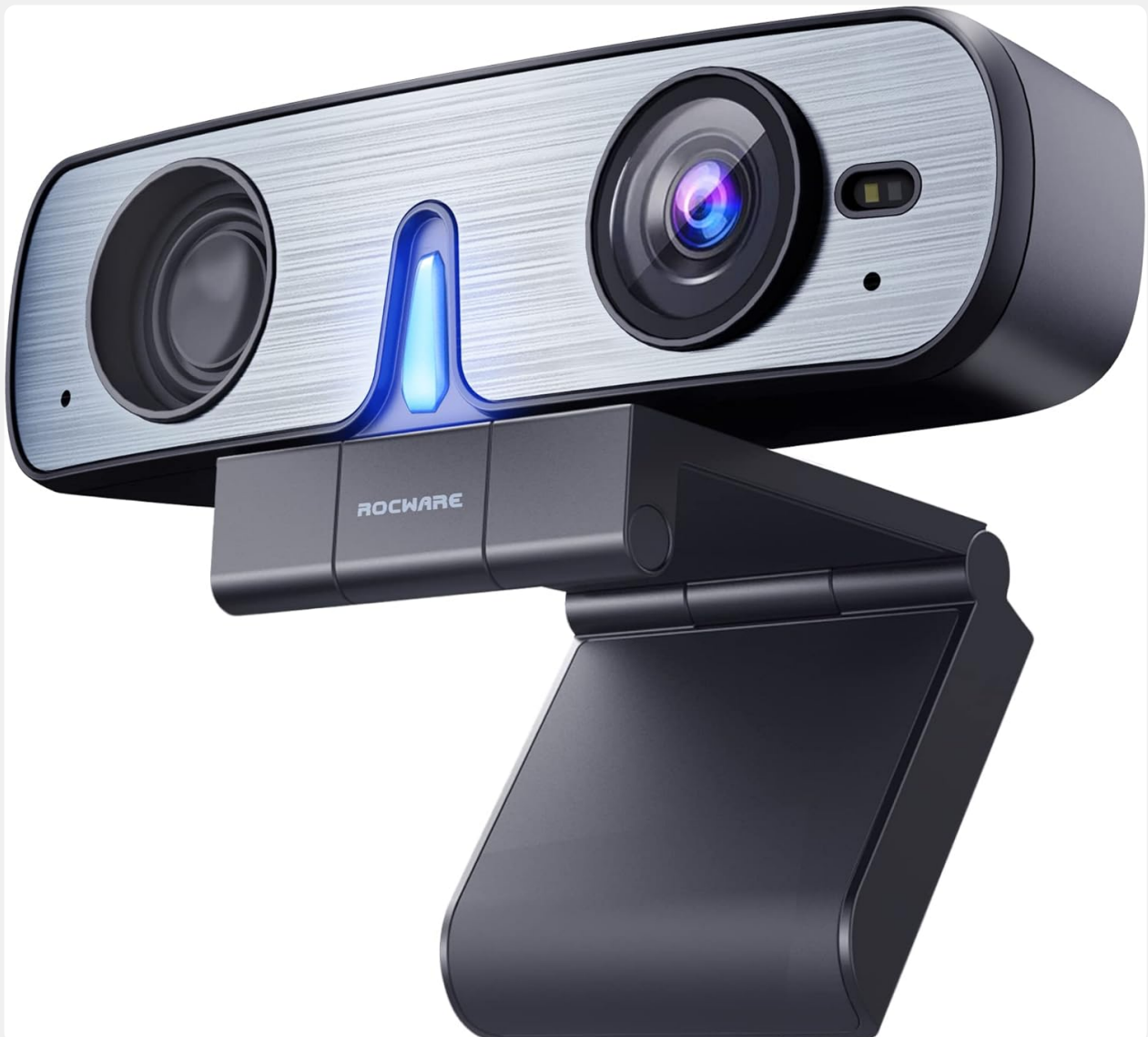
Image of the ROCWARE RC08 2K Webcam with Speaker, showcasing its sleek design and integrated stand.