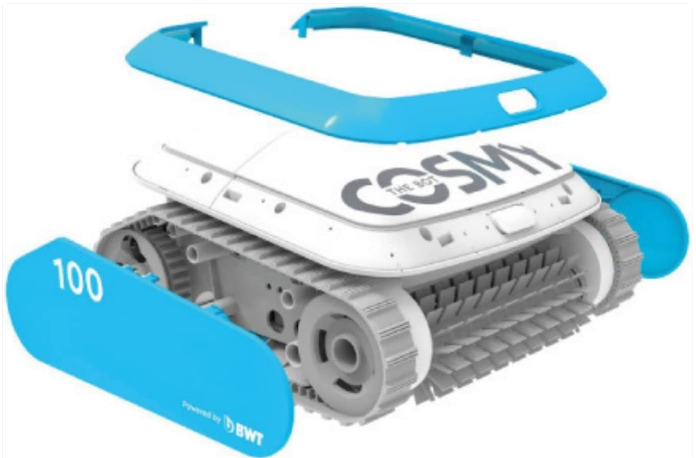
Figure 2: Exploded view of the COSMY The BOT 100, illustrating the main body and removable side panels.