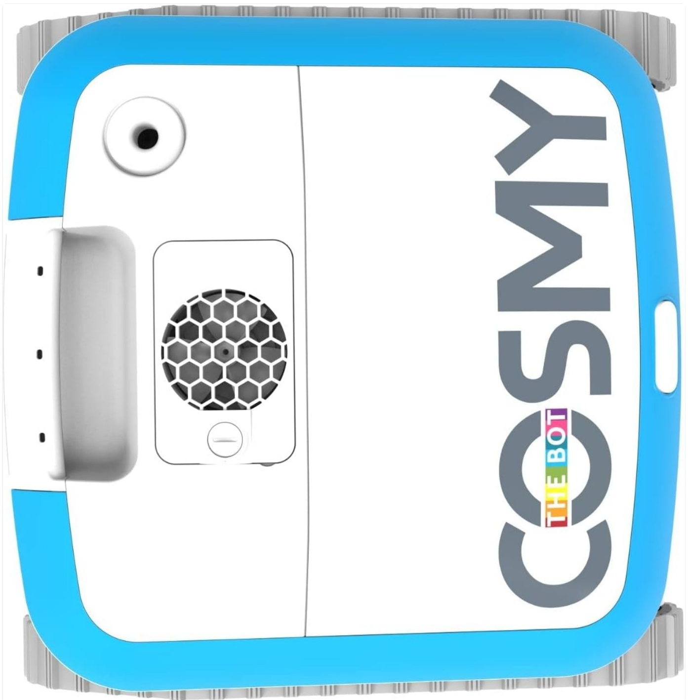
Figure 5: Top view of the COSMY The BOT 100, highlighting its compact design and "COSMY THE BOT" branding.