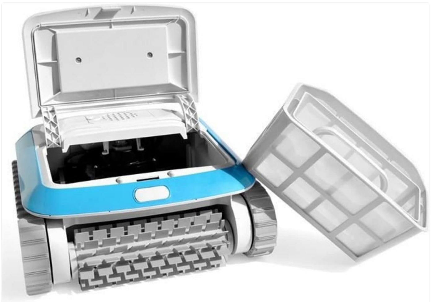
Figure 3: The COSMY The BOT 100 with its top lid open and the filter basket removed, showing the internal compartment.