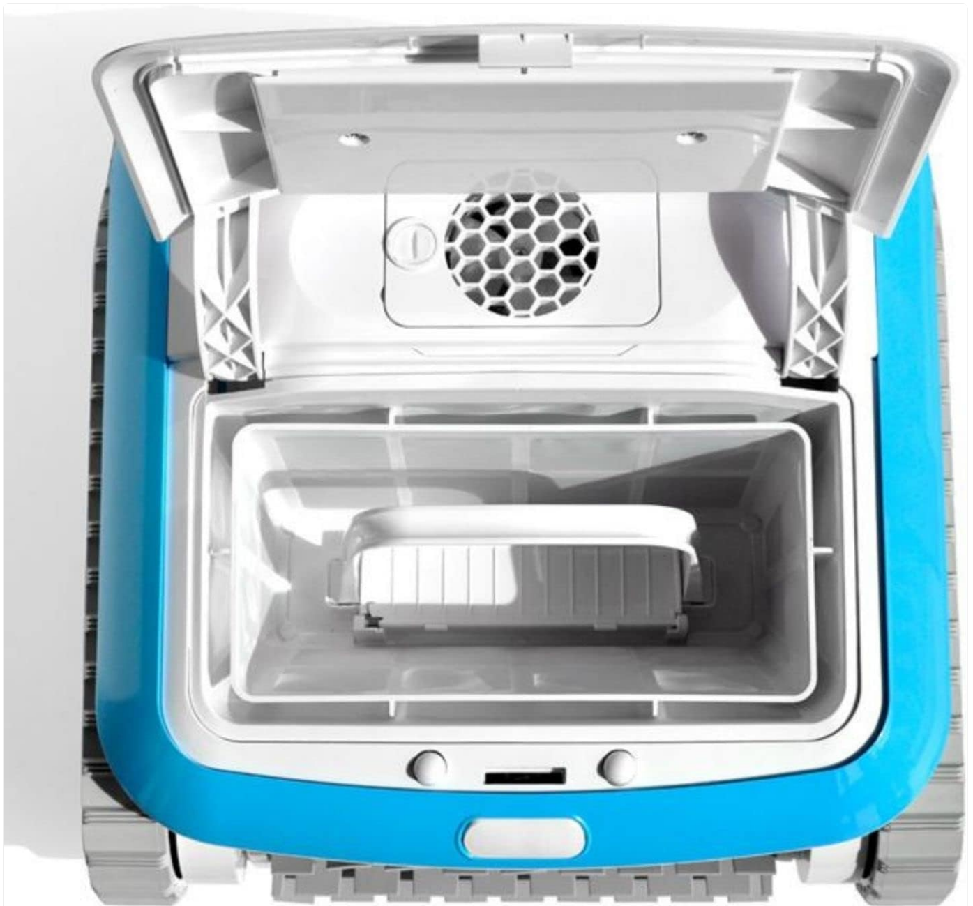
Figure 4: Top view of the COSMY The BOT 100 with the lid open, showing the filter compartment ready for basket removal.