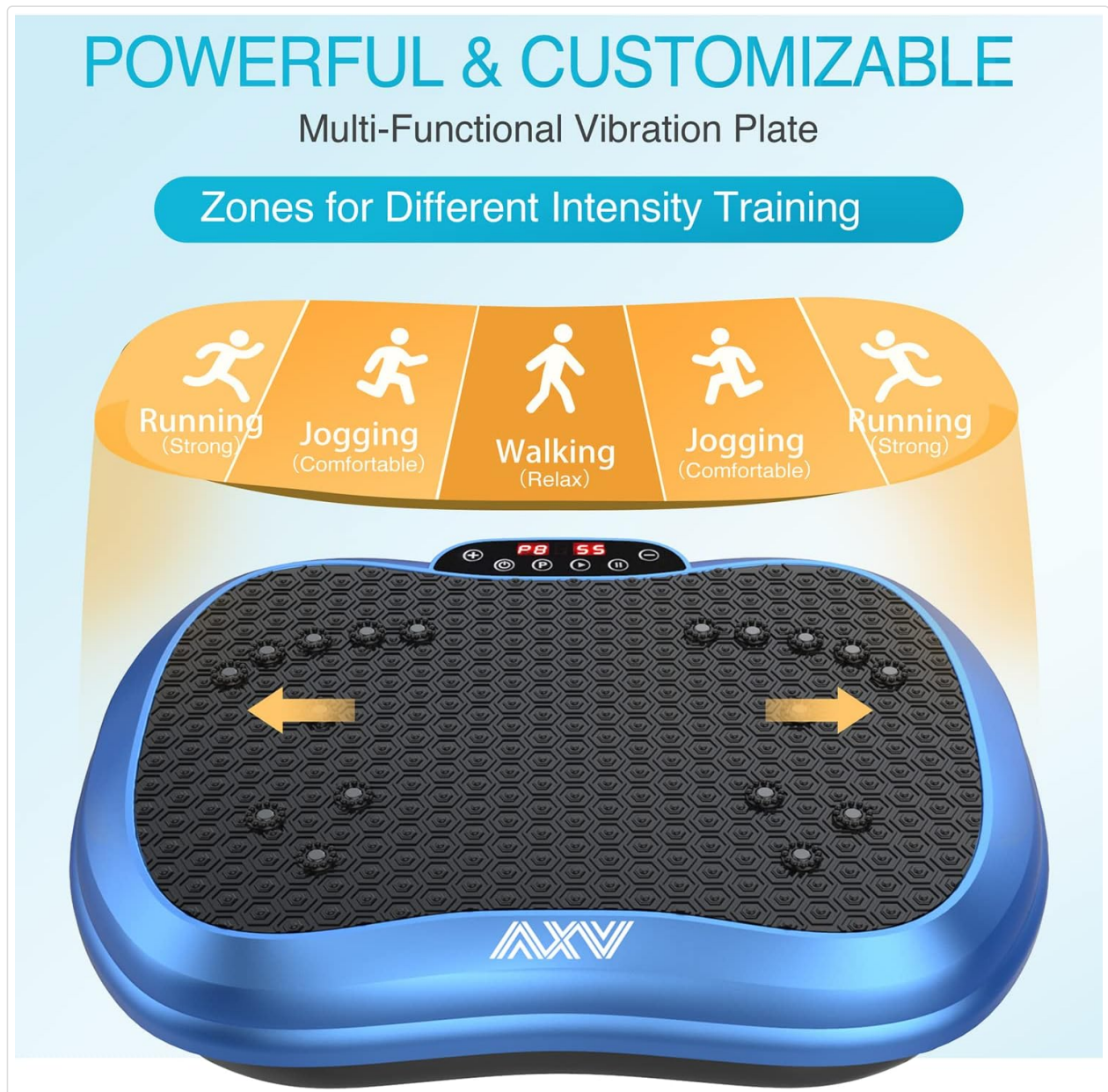
Image: Visual guide for foot placement on the AXV Vibration Plate to achieve different exercise intensities: Walking (relax), Jogging (comfortable), and Running (strong).

The integrated magnet health massage function targets specific points on the feet for enhanced comfort during use.