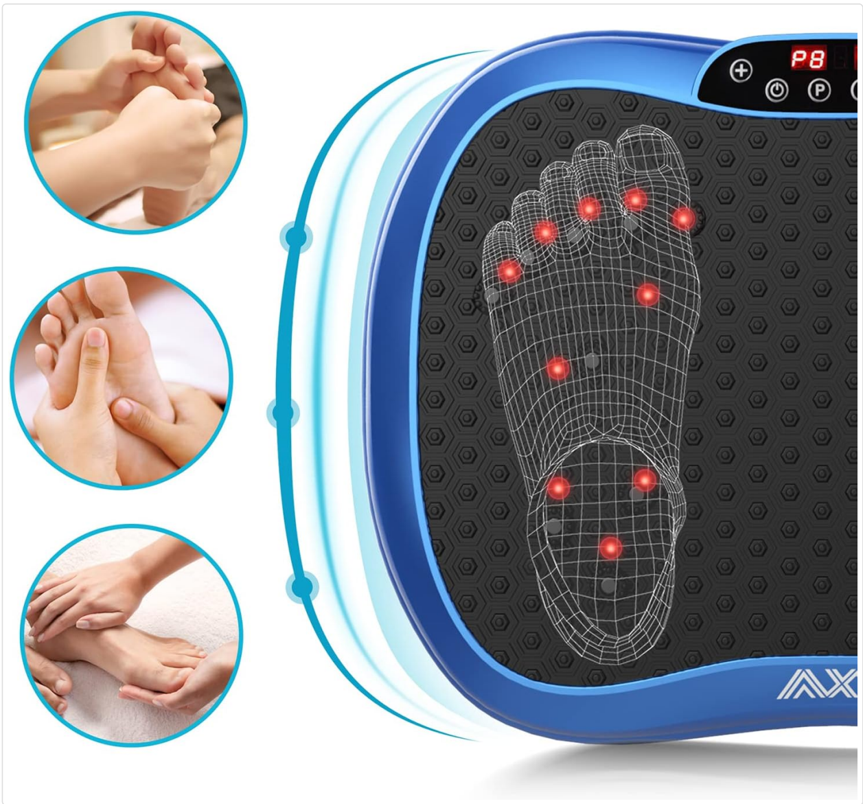
Image: Close-up view of the AXV Vibration Plate's surface, showing the textured foot pads and highlighted magnet massage points for foot stimulation.