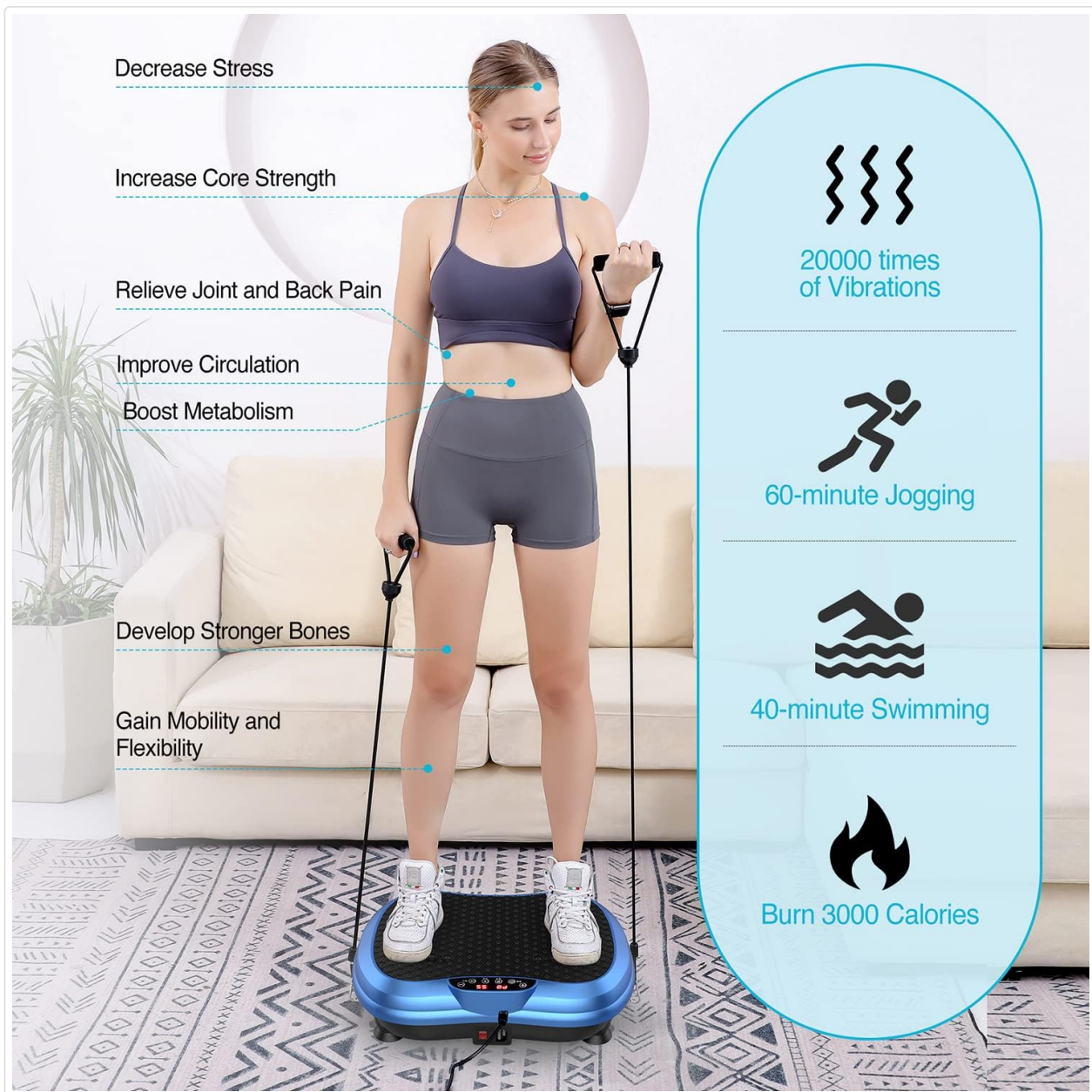
Image: A woman standing on the AXV Vibration Plate, holding the resistance bands to perform an upper body exercise, demonstrating combined workout potential.