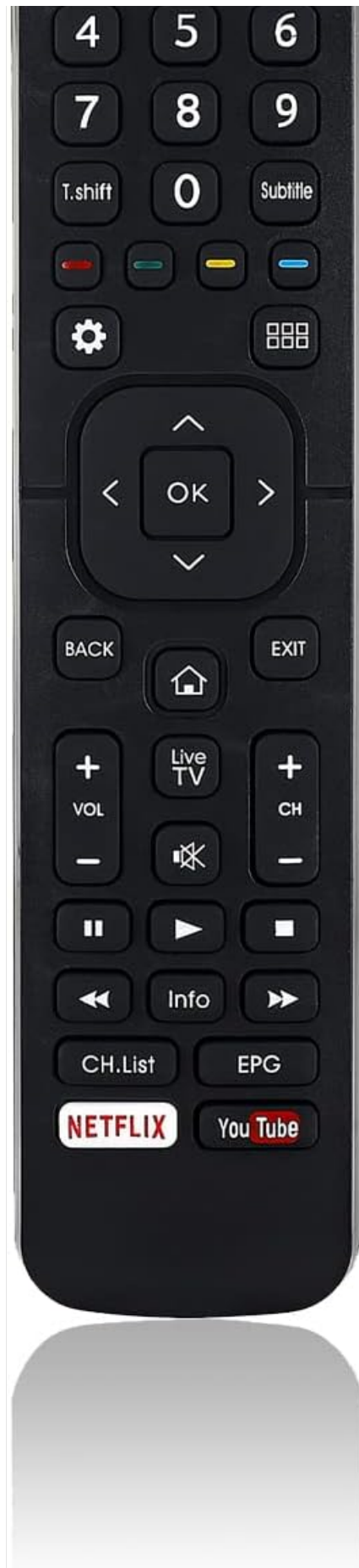
Image: A clear front view of the JISOWA replacement remote control, displaying all buttons including power, input, number pad, navigation, volume, channel, and dedicated Netflix and YouTube buttons.