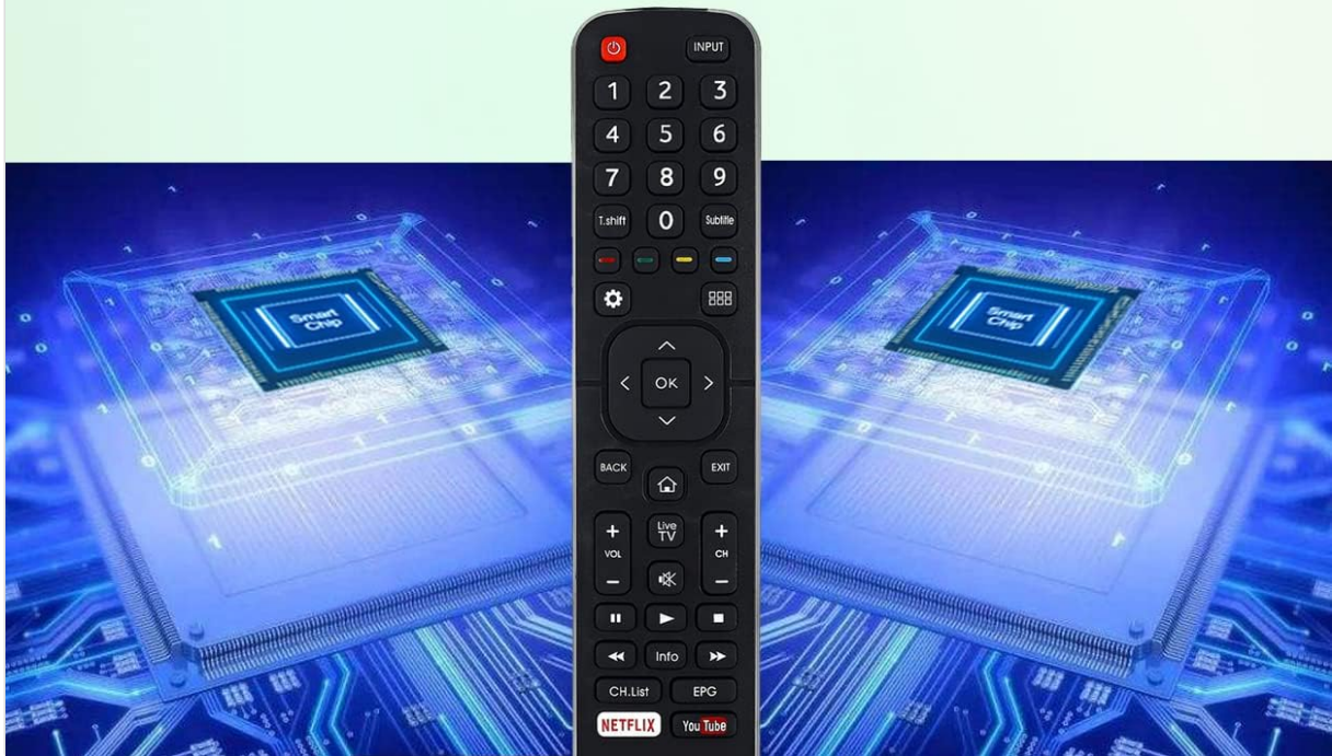
Image: The JISOWA replacement remote control, highlighting its features such as sensitivity, durability, stable signal, precise control, and the absence of programming requirements. This image illustrates the ease of use and reliability of the device.