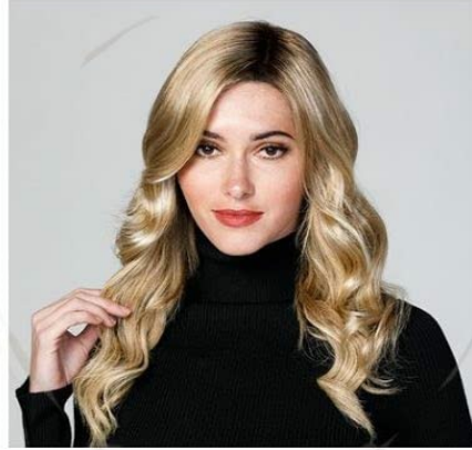
Wavy 18 inch