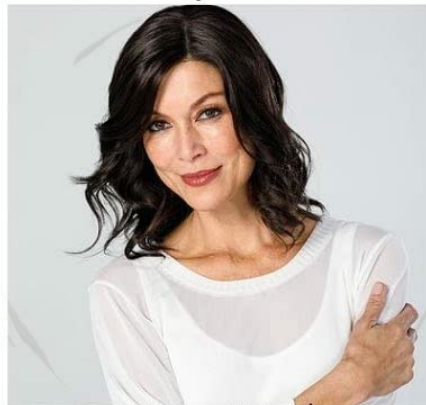
Wavy 12 inch