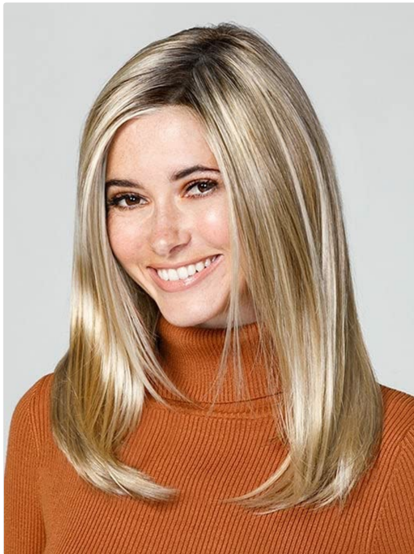
Figure 2: A model demonstrating the natural appearance of the Jon Renau SmartLace Topper when properly applied.