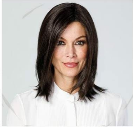
Straight 12 inch