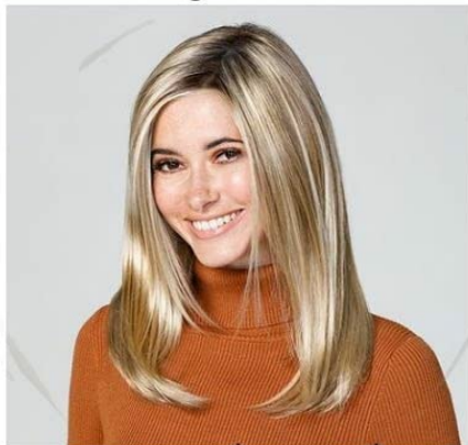
Straight 18 inch