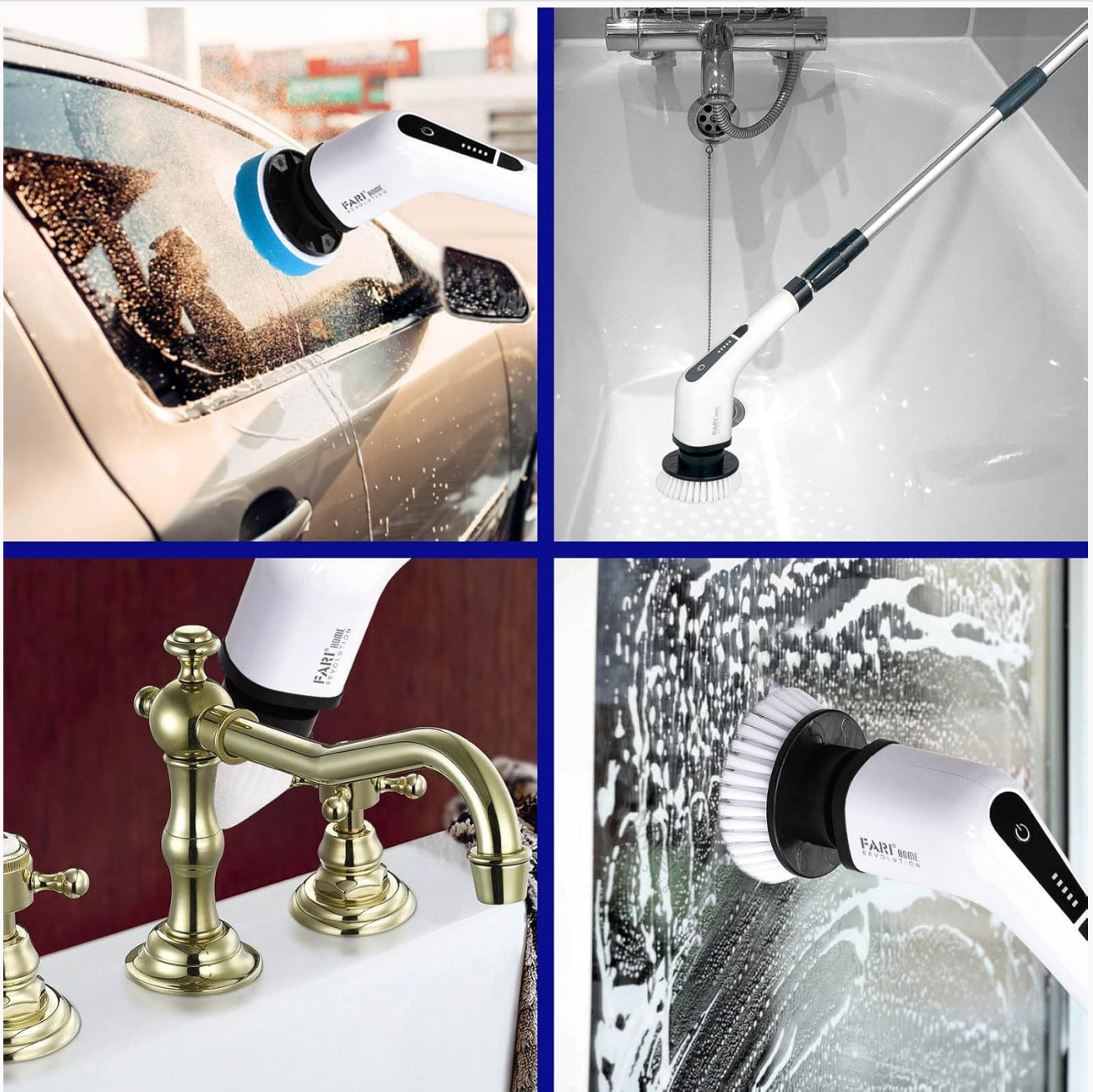
An infographic illustrating the specific uses for each of the seven included brush heads, such as bathroom cleaning, kitchen cleaning, corner cleaning, polishing, grease cleaning, car cleaning, and window cleaning.